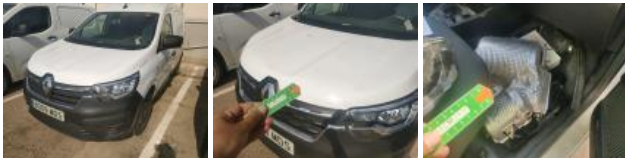
Bodywork, Glue residues, Remove lettering