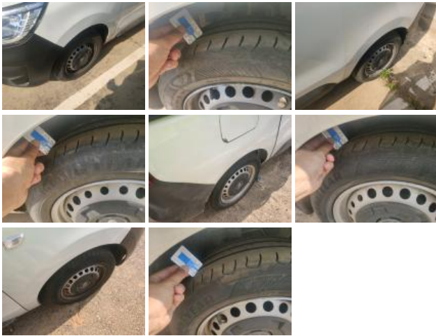
Bodywork, Accident, Check