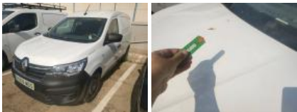
Bodywork, Not original part, Acceptable