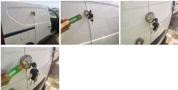
Bodywork, Accident, Check