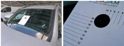
Windscreen glue kit, Required to install glazing, Repair/replace (lump sum)