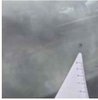
Damage Type Chipped