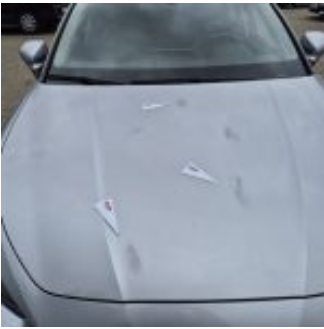
Damage Part Hood