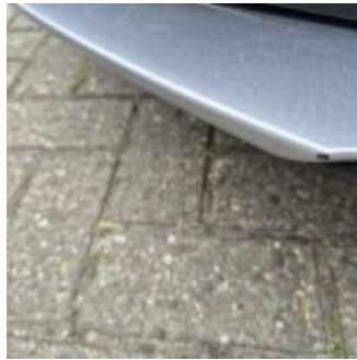
Damage Type Scratch(es)