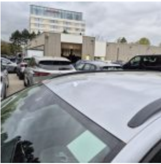
Damage Part Roof