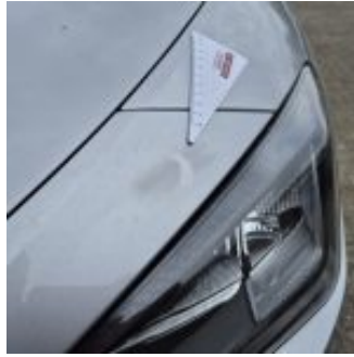
Damage Type Scratch(es)