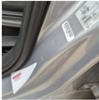
Damage Type Scratch(es)