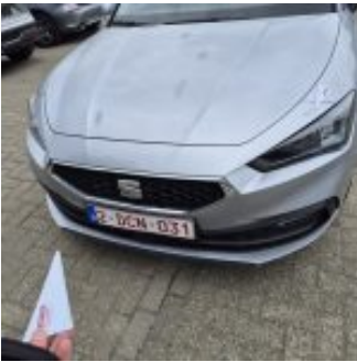
Damage Part spoiler FB