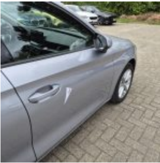
Damage Part Frontdoor - Right