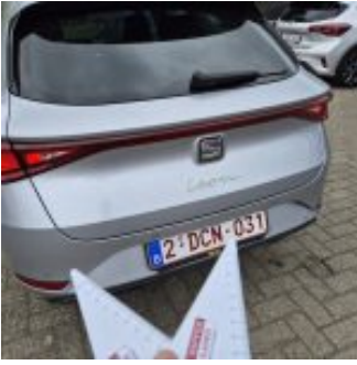
Damage Part Bumper - Rear