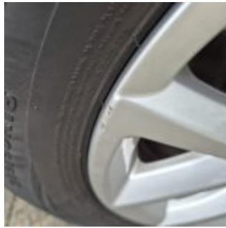
Damage Type Damaged