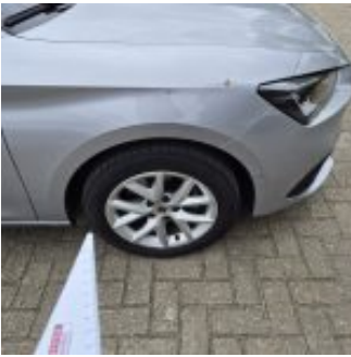
Damage Part Alloy - Right Front