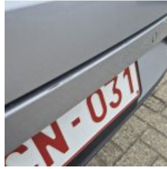
Repair Type Spray