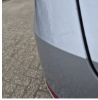
Damage Type Scratch(es)