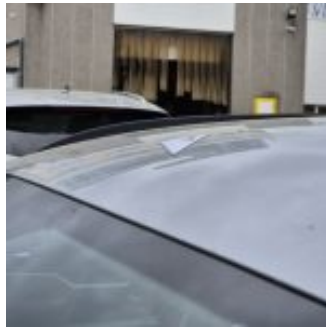
Damage Type Scratch(es)