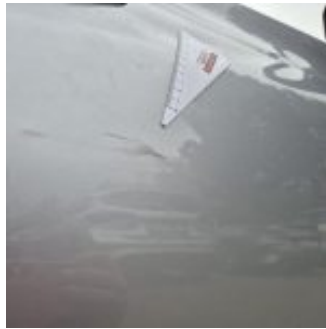
Damage Type Small scratch(es)