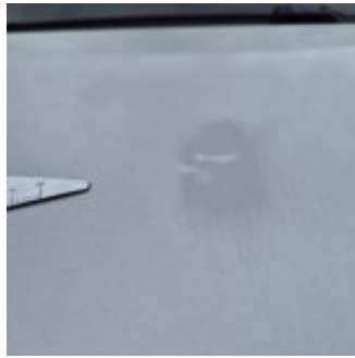
Damage Type Scratch(es)