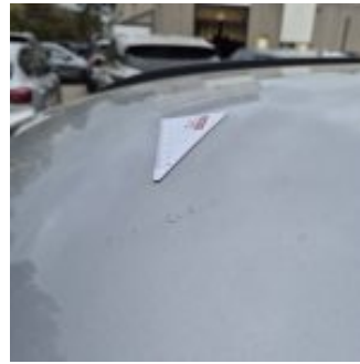
Repair Type Spray