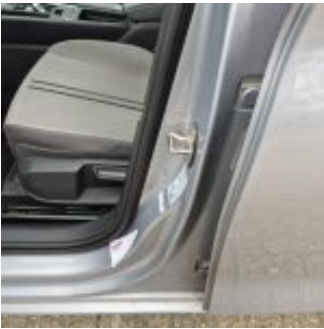
Damage Part Skirt - Left