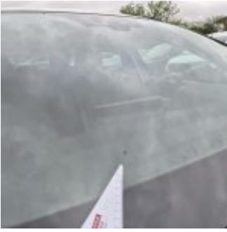
Damage Part Windscreen - Front