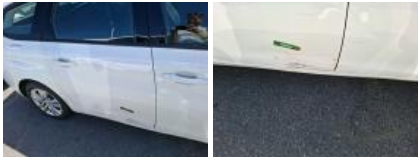
Door FR, Scratch(es), Paint