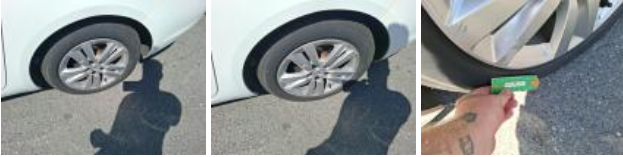
Alloy rim RR, Scratch(es), Repair/replace (lump sum)