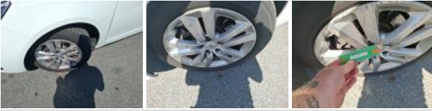
Alloy rim RL, Scratch(es), Repair/replace (lump sum)