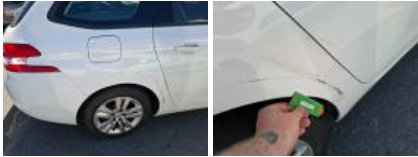
Outer sill R, Dent(s) and scratch(es), Repair and paint (complete)