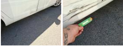
Door RR, Dent(s) and scratch(es), Repair and paint (complete)