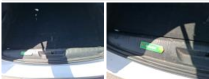
Boot lid covering R, Scratch(es), Replace