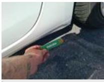
Wing RR, Scratch(es), Paint