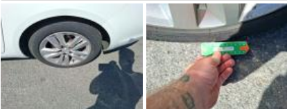
Outer sill L, Dent(s) and scratch(es), Repair and paint (complete)