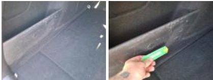
Internal boot lining R, Scratch(es), Replace