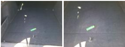
Internal boot lining L, Scratch(es), Replace