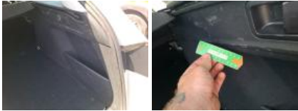
Rear bulkhead lining, Scratch(es), Replace