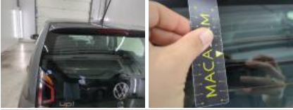
Roof, Scratch(es), Repair and paint (complete)