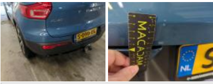
Bumper corner RR, Scratch(es), Repair and paint (complete)