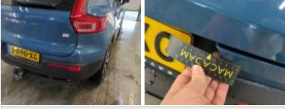
Tailgate / Boot, Dent(s), Repair and paint (complete)