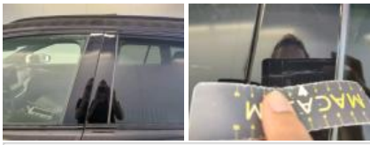
Door FL, Dent(s), Repair and paint (complete)