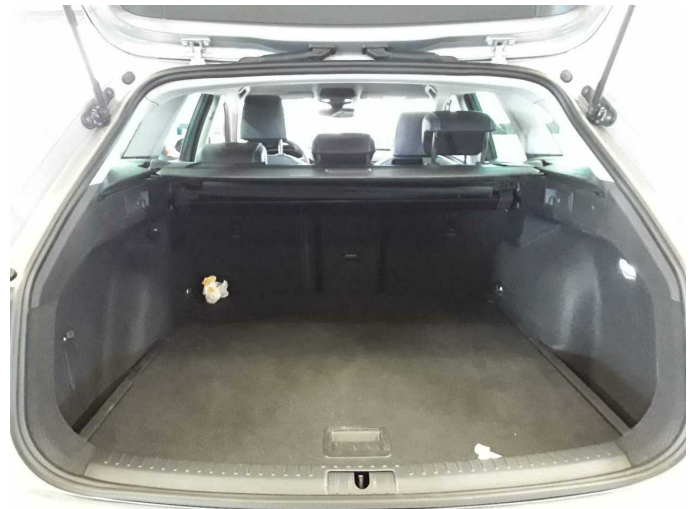
Figure 10: Cargo area