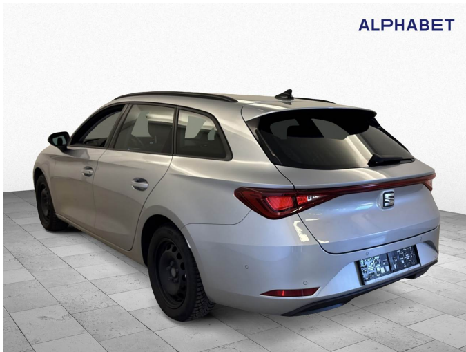
Figure 3: Diagonal rear (left)