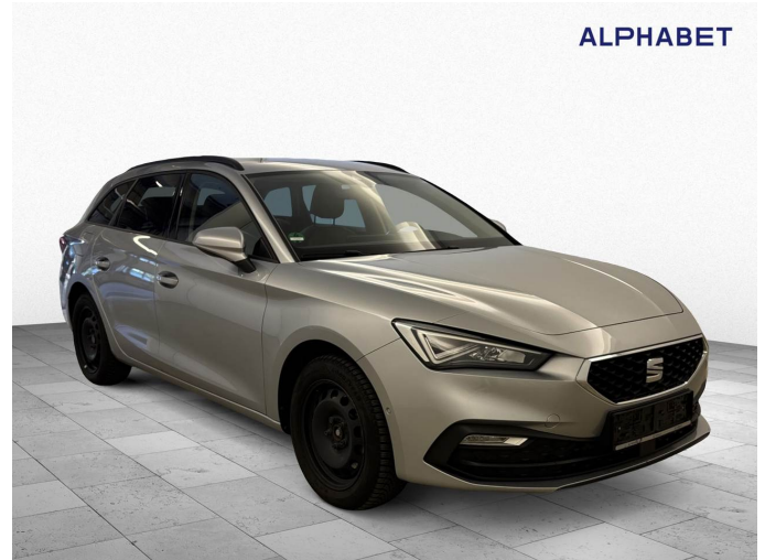
Figure 2: Diagonal front (right)