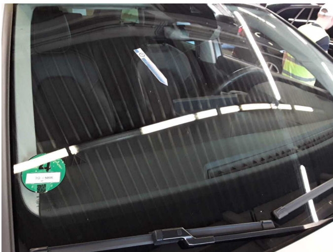
Wear and tear 3: Vehicle glazing: Windscreen - Stone chips - No deduction