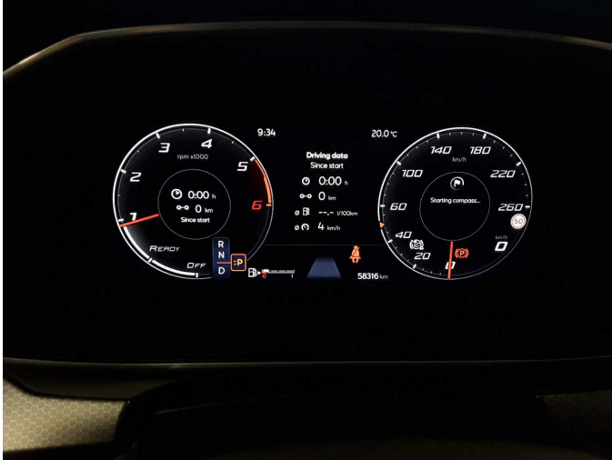
Figure 7: Instrument cluster