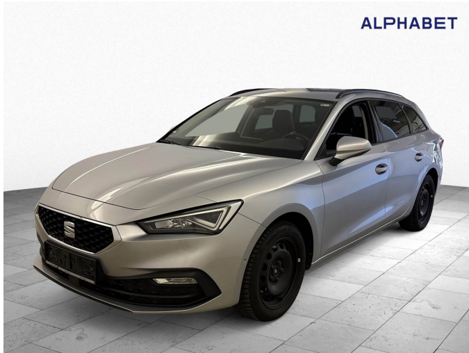
Figure 1: Diagonal front (left)