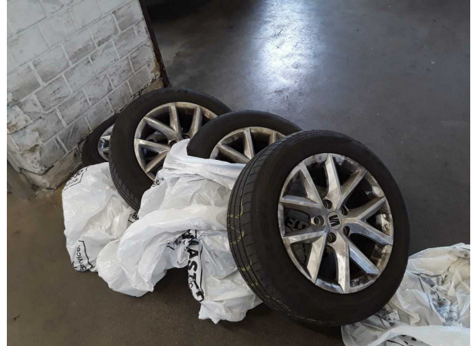
Figure 14: Additional tyres