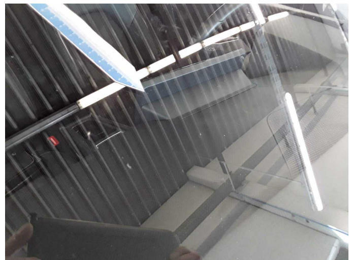
Wear and tear 3: Vehicle glazing: Windscreen - Stone chips - No deduction