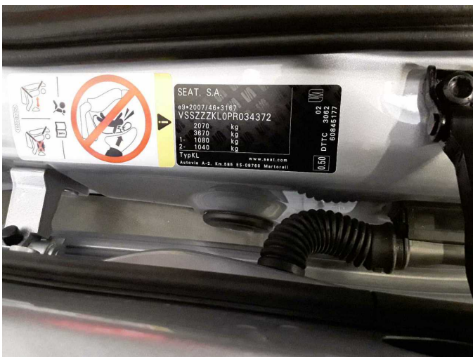
Figure 11: VIN