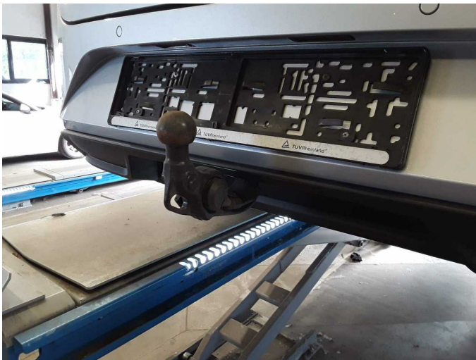
Figure 21: Misc.