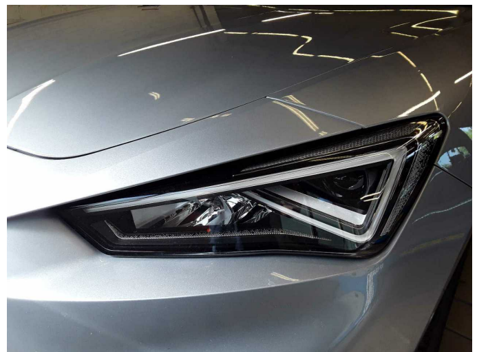
Figure 18: Misc.