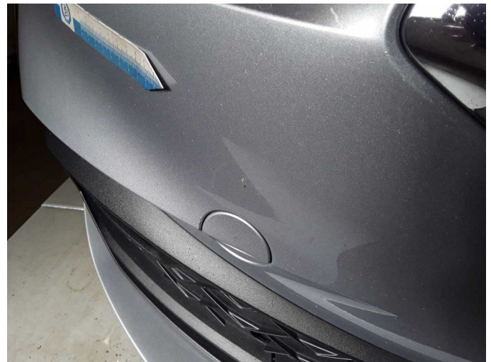
Wear and tear 2: Front bumper: Front bumper - Stone chips - No deduction