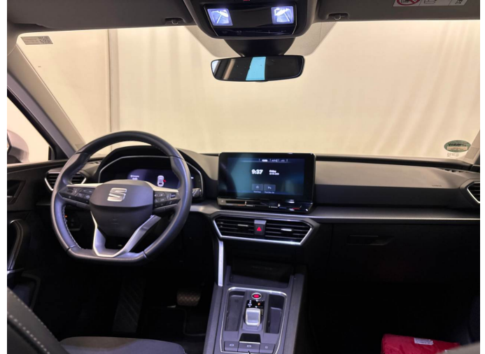
Figure 8: Instrument panel