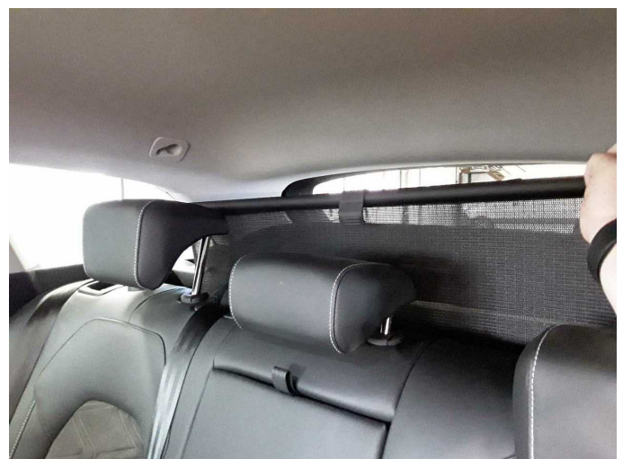
Figure 30: Misc.