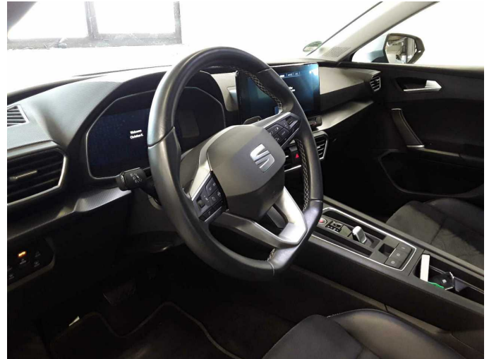
Figure 26: Misc.