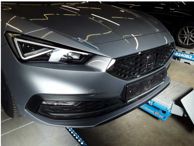
Wear and tear 2: Front bumper: Front bumper - Stone chips - No deduction