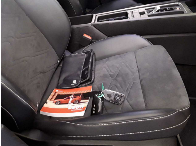
Figure 13: Documents