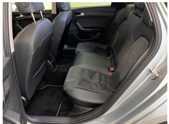
Figure 6: Interior - rear