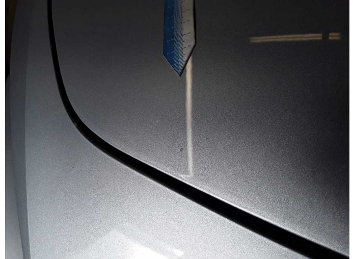
Wear and tear 1: Bonnet: Bonnet - Stone chips - No deduction