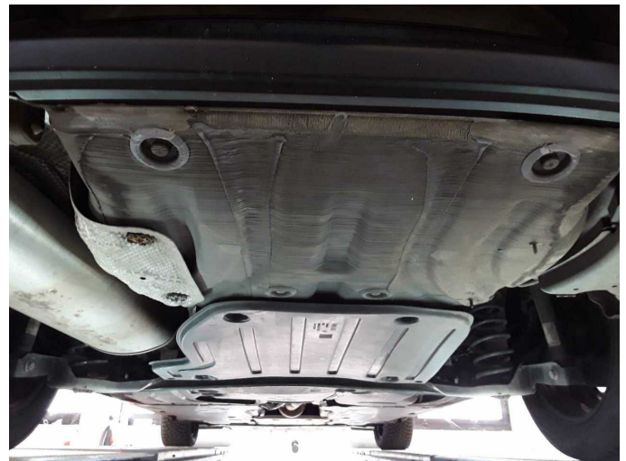
Figure 22: Misc.