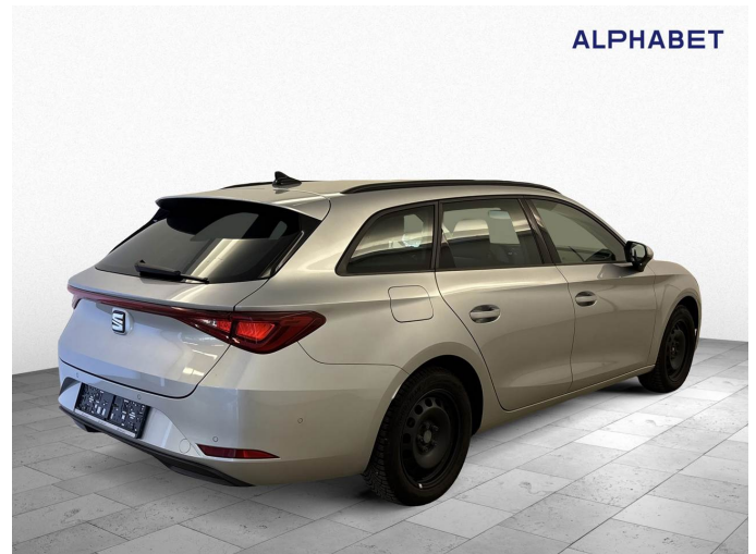
Figure 4: Diagonal rear (right)