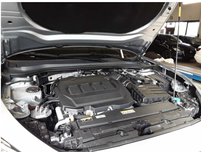
Figure 17: Misc.