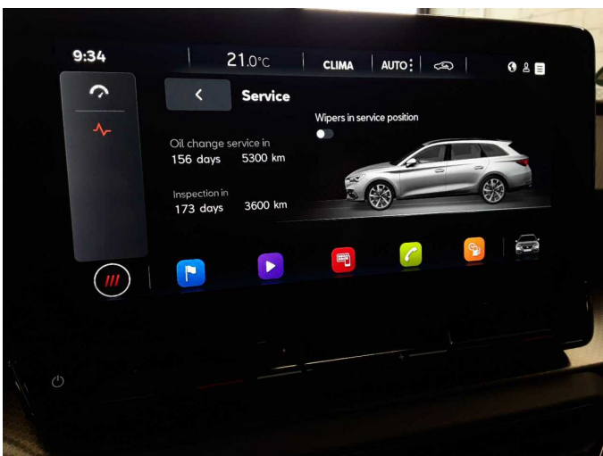
Figure 29: Misc.