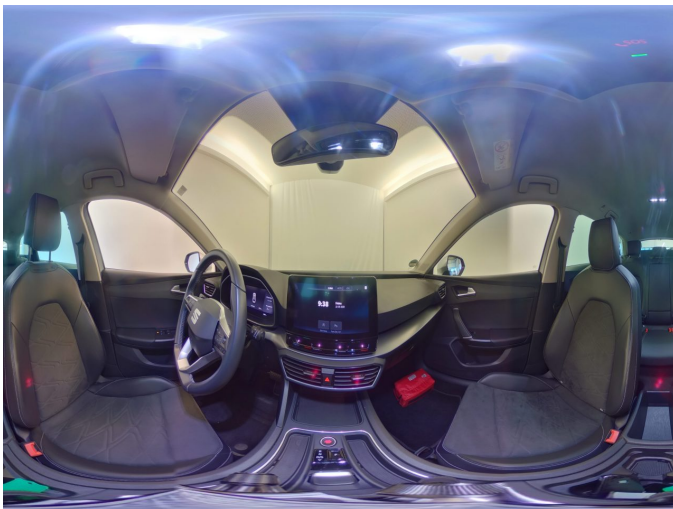
Figure 9: Interior 360° view