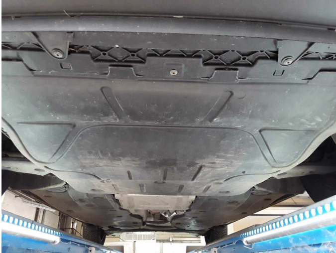
Figure 19: Misc.