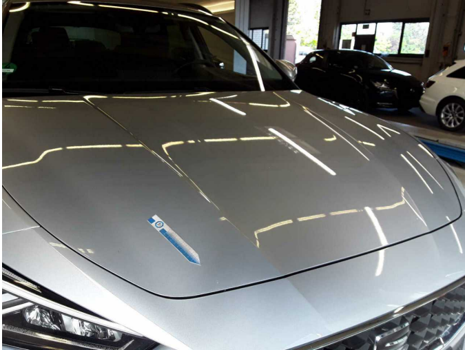
Wear and tear 1: Bonnet: Bonnet - Stone chips - No deduction