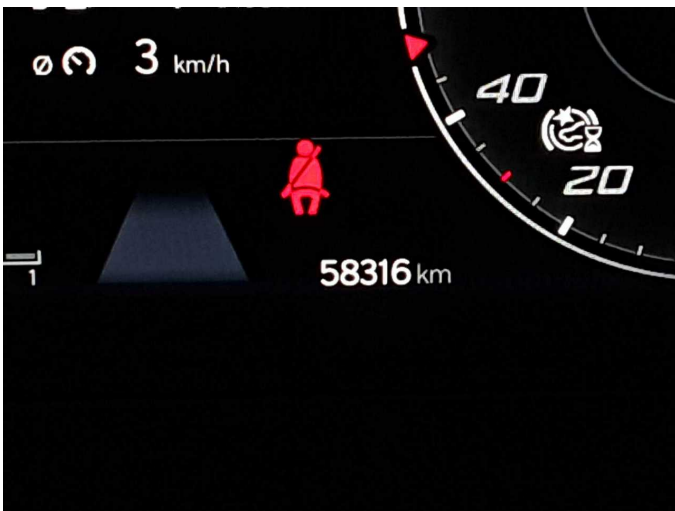
Figure 27: Misc.