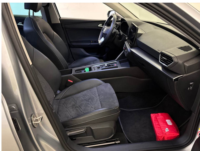
Figure 5: Interior - front