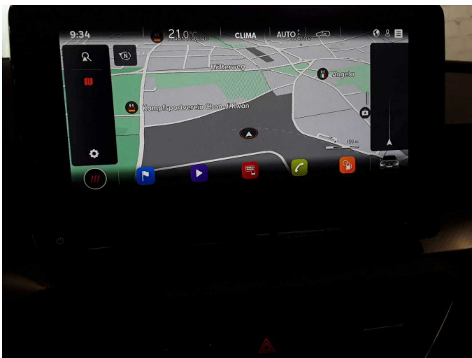
Figure 15: Navigation