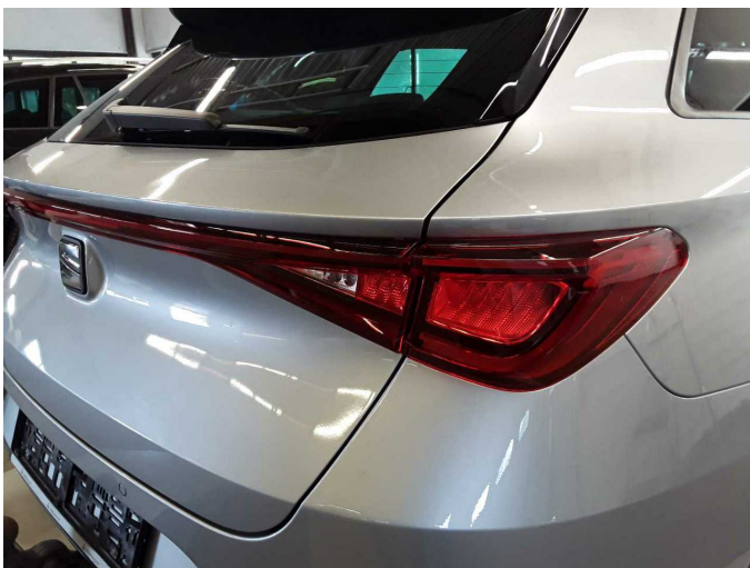
Figure 23: Misc.