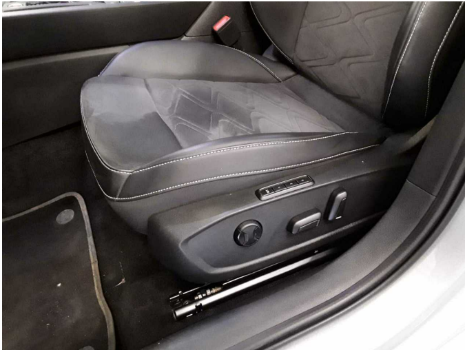
Figure 25: Misc.