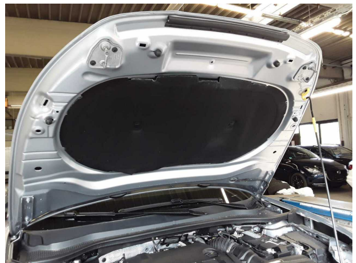
Figure 16: Misc.