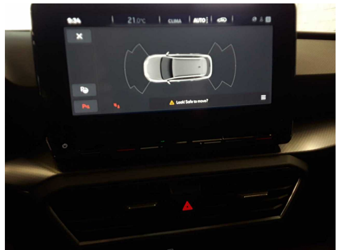
Figure 28: Misc.