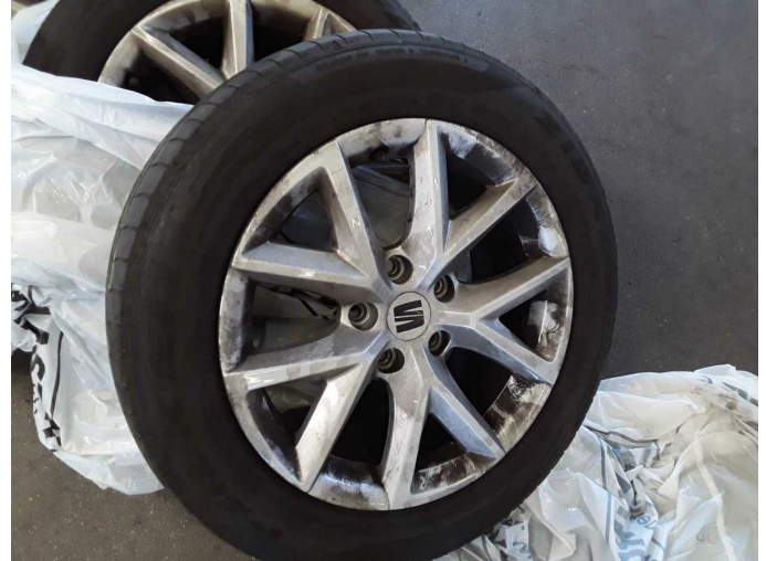
Figure 20: Misc.