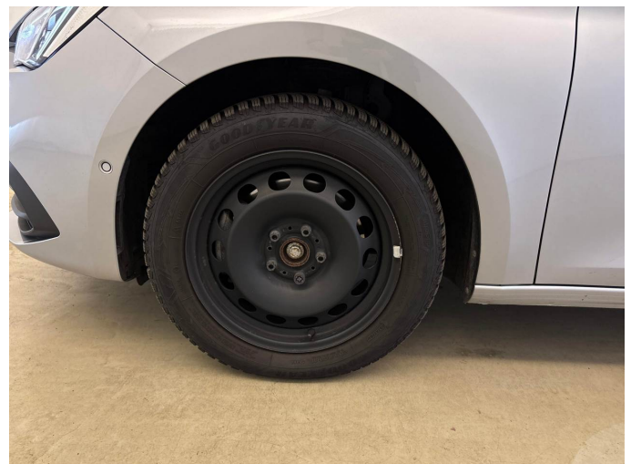
Figure 12: Mounted tyres