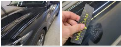
Door FL, Scratch(es), Repair and paint (complete)