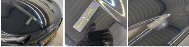
Bumper F, Scratch(es), Repair and paint (complete)