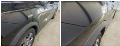
Door FR, Dent(s) and scratch(es), Repair and paint (complete)