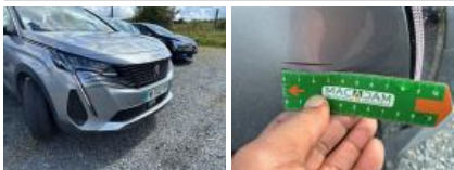
Wing trim RR, Deformed / Strained, Replace