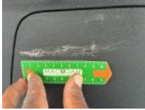
Internal boot lining L, Scratch(es), Replace