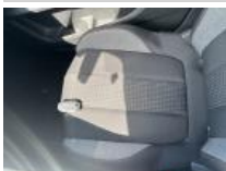
Interior, Stain, Cleaning

Remote ignition key (no insert), Missing, Repair/replace (lump sum)