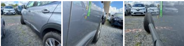
Wing RL, Dent(s) and scratch(es), Repair and paint (complete)