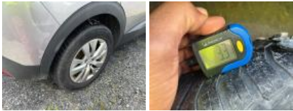
Tyre RL, Out of tolerance, Replace