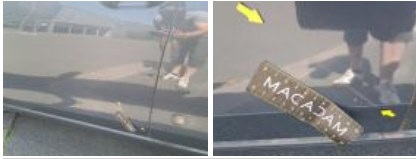
Wing FL, Dent(s) and scratch(es), Repair and paint (complete)