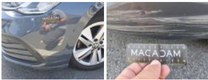
Bonnet, Dent(s) and scratch(es), Repair and paint (complete)