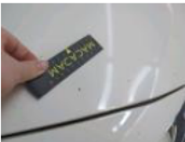
Windscreen, Stone chip(s), Windscreen repair