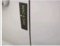
Wing trim RL, Missing, Replace and paint