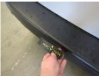
Boot door panel RR, Scratch(es), Repair and paint (complete)