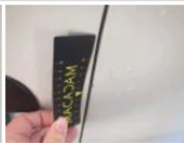
Bumper corner RL, Scratch(es), Repair and paint (complete)