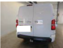
Roof, Hail damage, Paintless dent repair (hail)