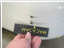
Bodywork, Chemical polution, Polish