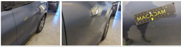
Bonnet, Stone chip(s), Repair and paint (complete)