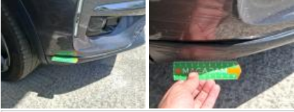
Bumper moulding F, Scratch(es), Replace