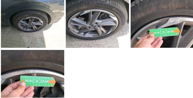
Tyre RR, Out of tolerance, Replace