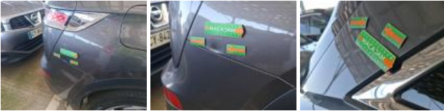
Wing trim RR, Scratch(es), Replace