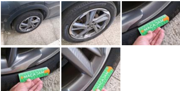
Tyre RL, Out of tolerance, Replace