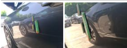
Wing RL, Dent(s), Repair and paint (complete)