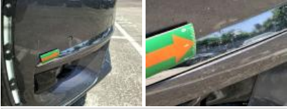
Bumper moulding FR, Scratch(es), Replace