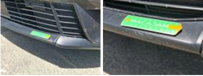
Bumper moulding FR, Scratch(es), Replace