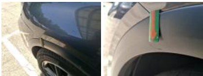
Door FL, Dent(s), Repair and paint (complete)