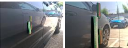
Door FR, Dent(s), Repair and paint (complete)