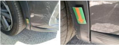
Wing RR, Dent(s), Repair and paint (complete)