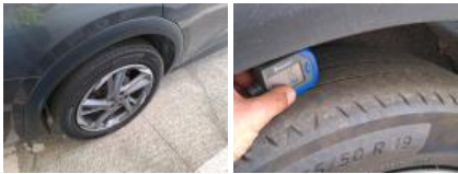
Alloy rim RR bitone/polychrome, Scratch(es), Repair/replace (lump sum)