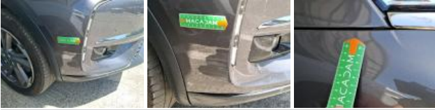
Bumper moulding FR, Scratch(es), Replace