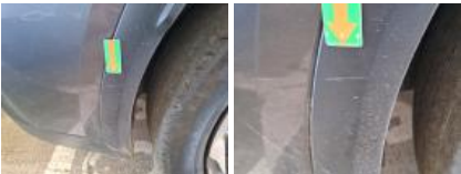
Door RR, Dent(s), Repair and paint (complete)