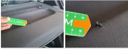
Boot lid covering R, Scratch(es), Replace