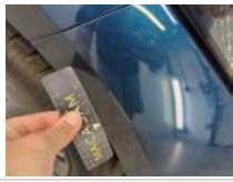
Bumper R, Scratch(es), Repair and paint (complete)