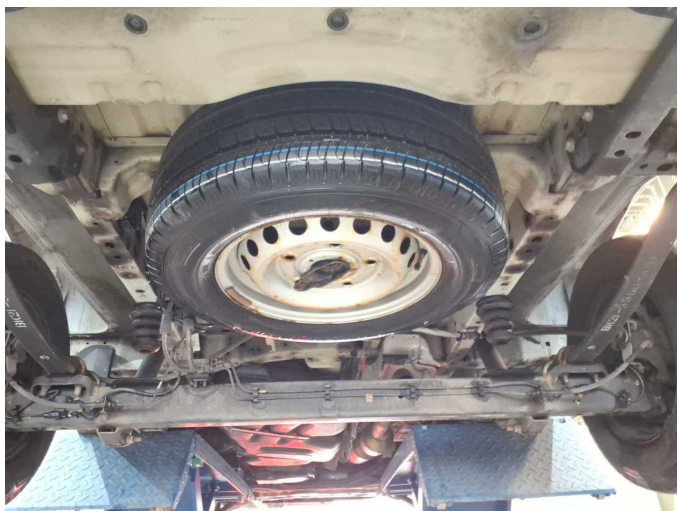
Figure 29: Misc.