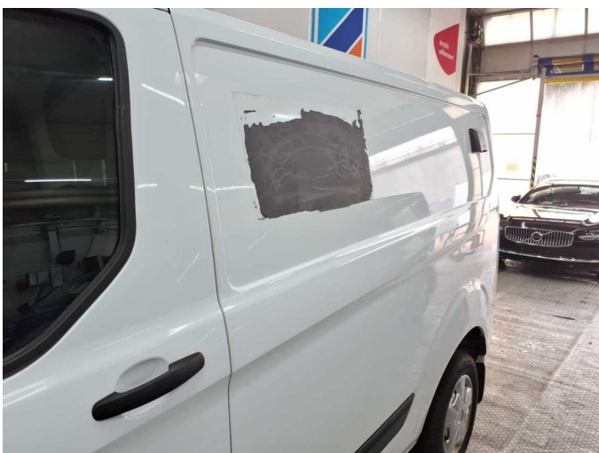
Damage 3: Side panel - rear left side: Side panel - Glued / labelled - De-glove / neutralise