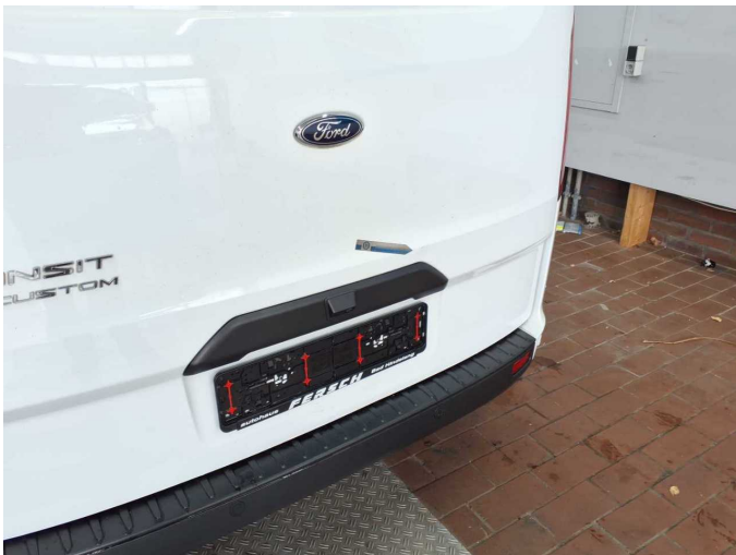
Damage 5: Boot lid / rear door: Boot lid - Dent / paintcoat damage - Smart repair