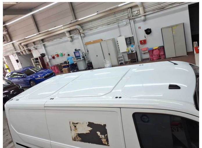
Figure 30: Misc.