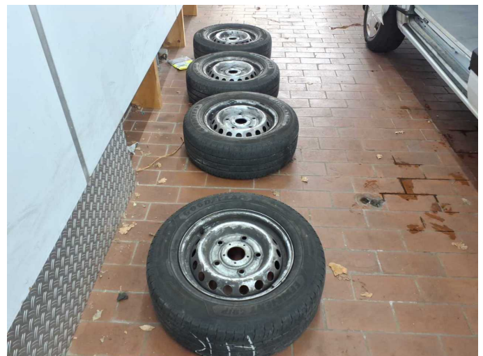
Figure 16: Additional tyres