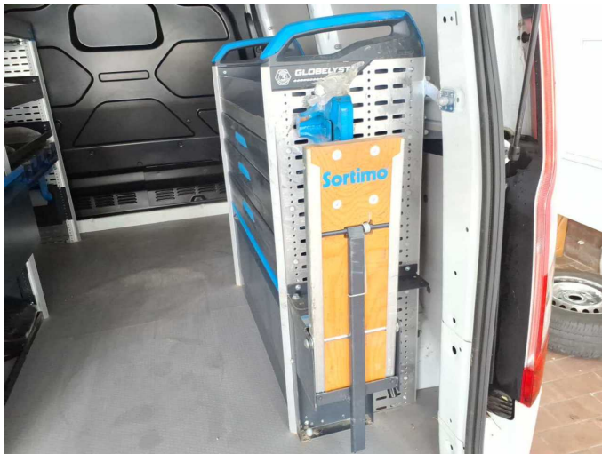
Figure 27: Misc.