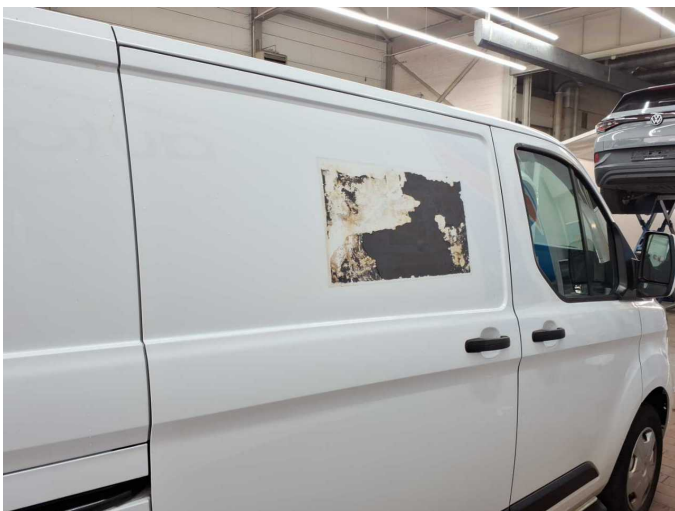
Damage 2: Sliding door, right: Sliding door - Glued / labelled - De-glove / neutralise