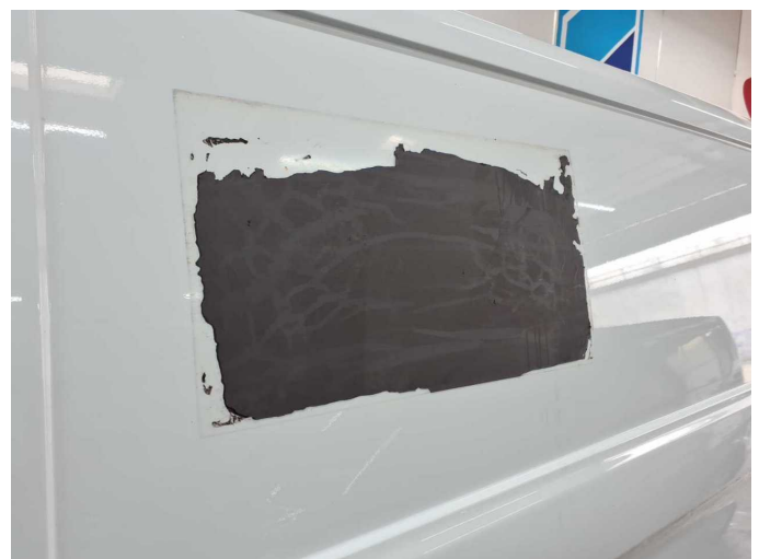
Damage 3: Side panel - rear left side: Side panel - Glued / labelled - De-glove / neutralise