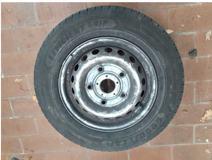
Figure 17: Additional tyres