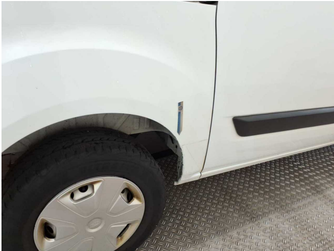
Damage 1: Side panel - rear right side: Side panel - Paint defect - Paint