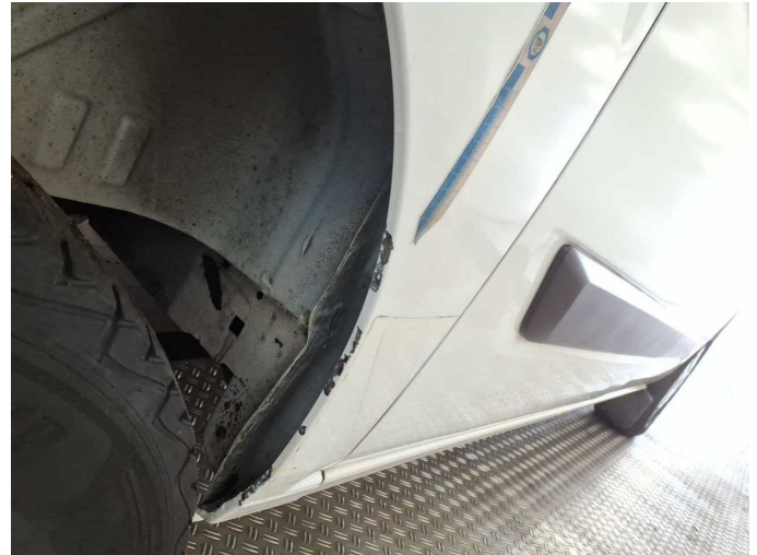
Damage 1: Side panel - rear right side: Side panel - Paint defect - Paint