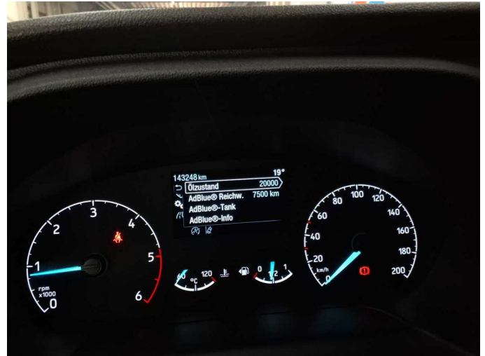
Figure 14: Documents