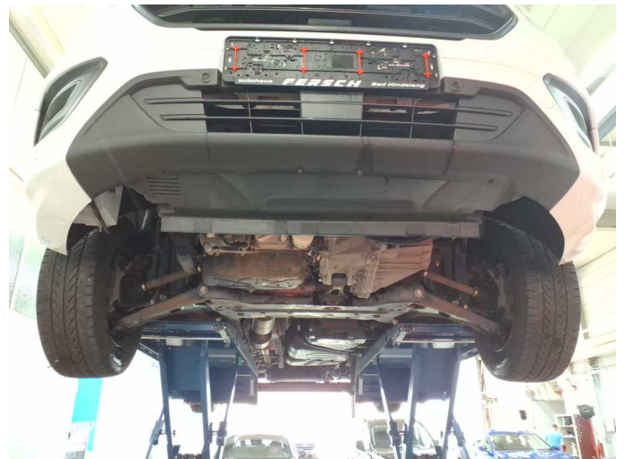
Figure 28: Misc.