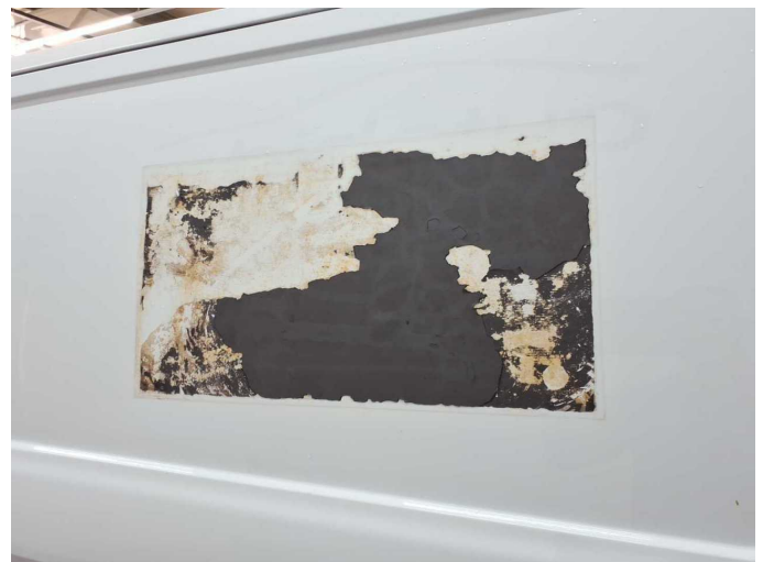
Damage 2: Sliding door, right: Sliding door - Glued / labelled - De-glove / neutralise