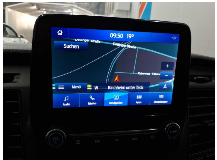
Figure 18: Navigation