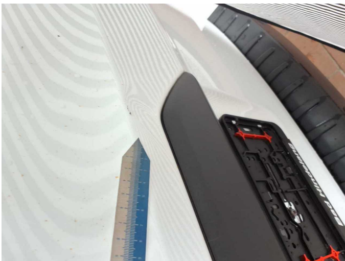
Damage 5: Boot lid / rear door: Boot lid - Dent / paintcoat damage - Smart repair