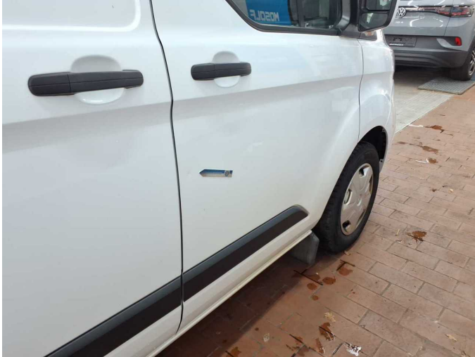
Damage 4: Door - front right side: Door - dent(s) - Smooth repair work