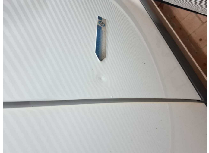
Damage 4: Door - front right side: Door - dent(s) - Smooth repair work