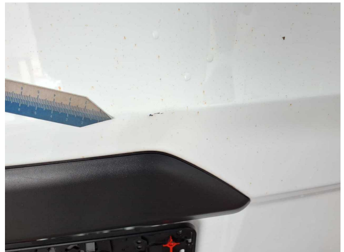
Damage 5: Boot lid / rear door: Boot lid - Dent / paintcoat damage - Smart repair