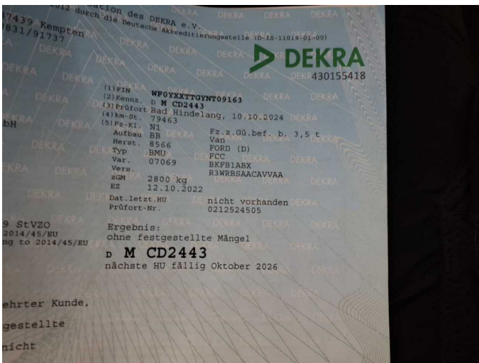
Figure 15: Documents