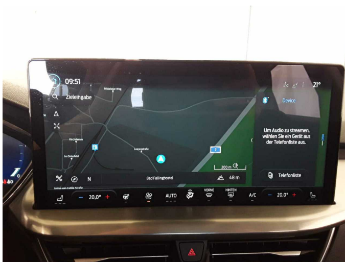
Figure 17: Navigation