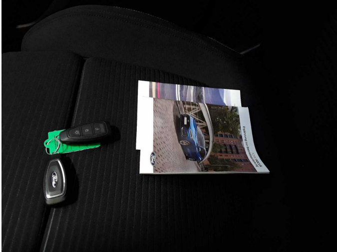
Figure 13: Documents