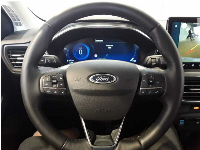
Figure 21: Misc.