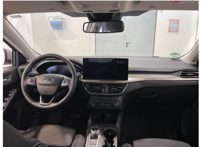
Figure 8: Instrument panel