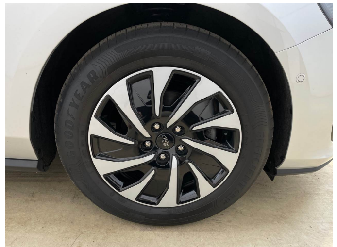
Figure 12: Mounted tyres