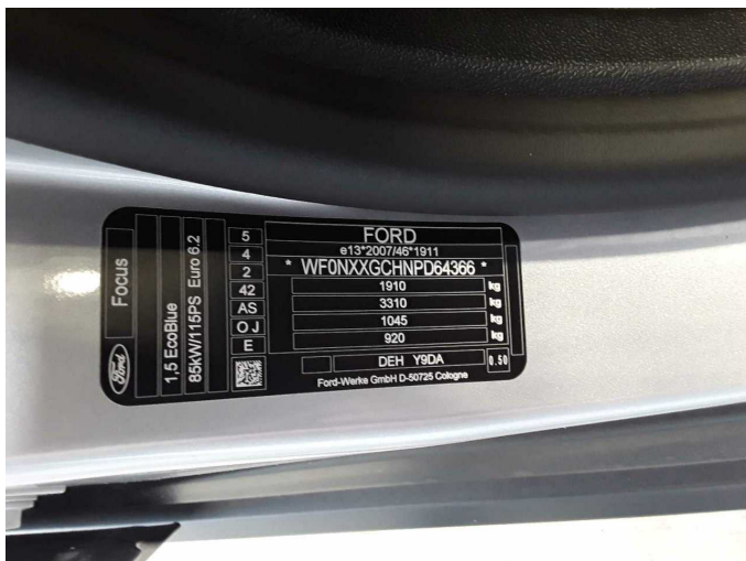
Figure 11: VIN