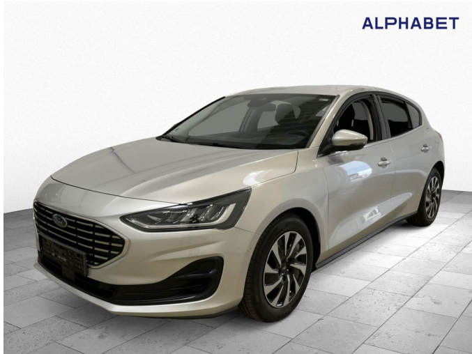
Figure 1: Diagonal front (left)