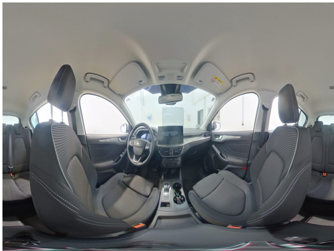
Figure 9: Interior 360° view