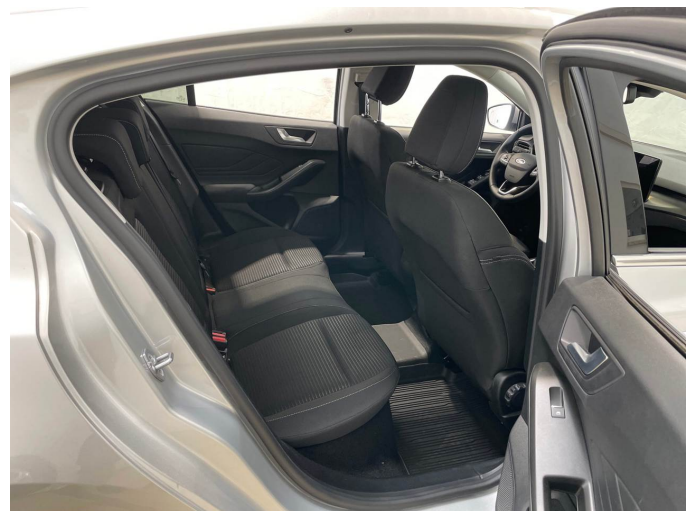
Figure 6: Interior - rear