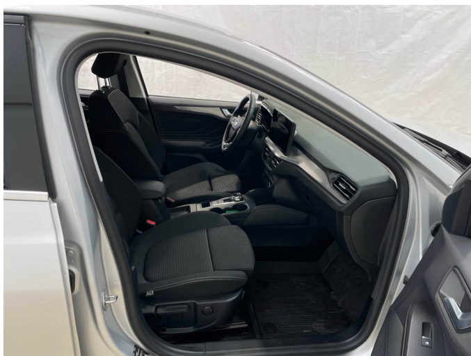
Figure 5: Interior - front