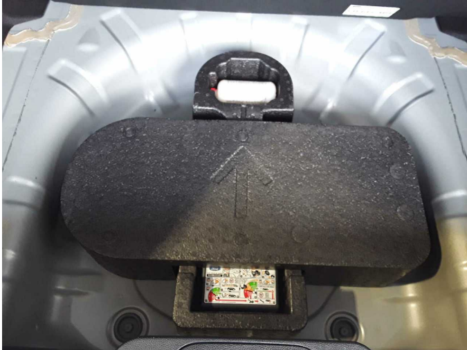
Figure 19: Misc.