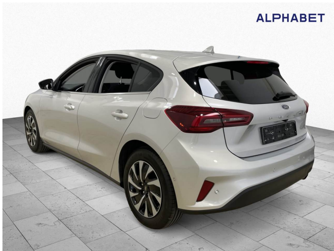
Figure 3: Diagonal rear (left)