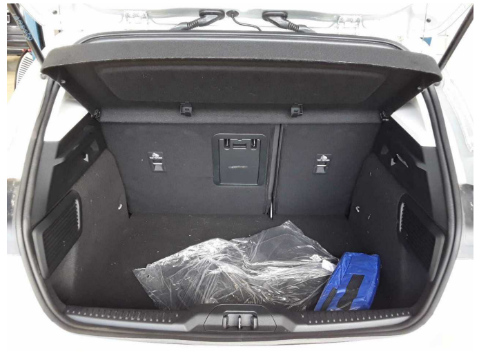
Figure 10: Cargo area