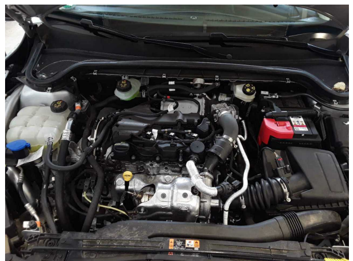
Figure 18: Misc.