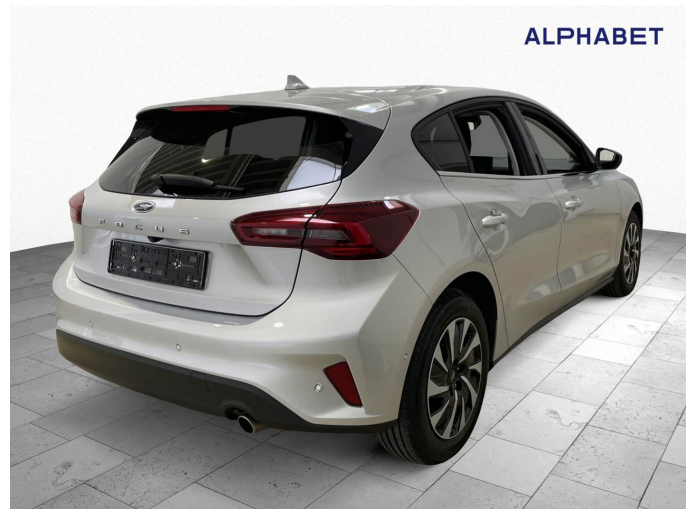
Figure 4: Diagonal rear (right)