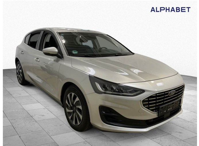
Figure 2: Diagonal front (right)