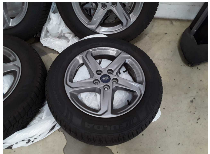
Figure 24: Misc.