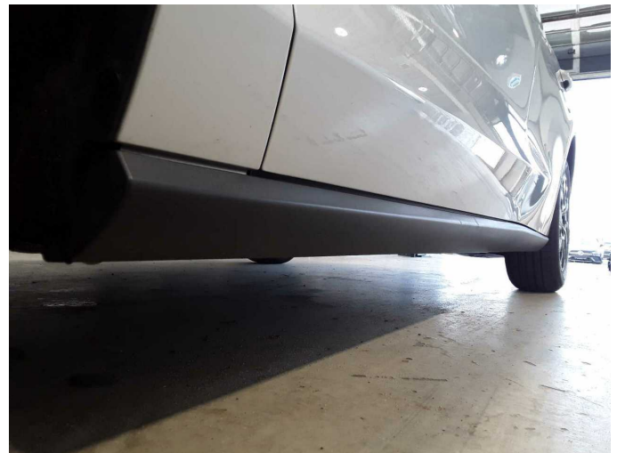
Figure 22: Misc.