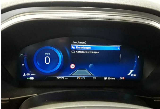
Figure 7: Instrument cluster