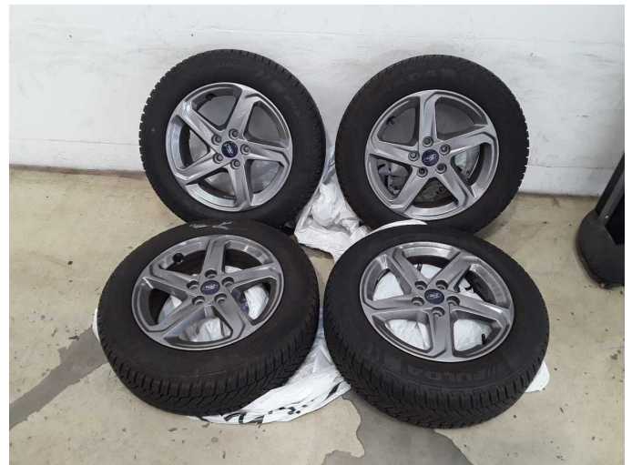
Figure 16: Additional tyres