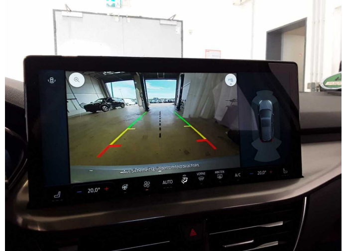
Figure 20: Misc.