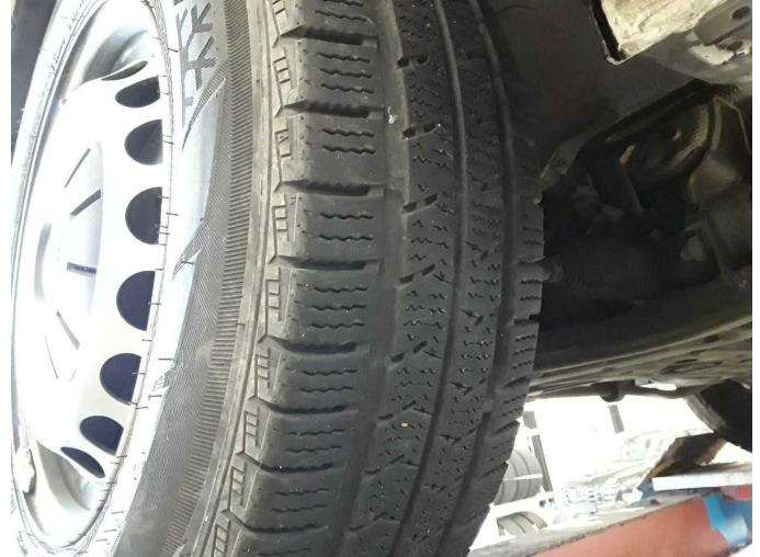
Damage 2: Wheel / tyres: Tyre - front (Winterreifen statt Ganzjahresreifen montiert, Mischbereifung) - Differs from the original configuration - Replace