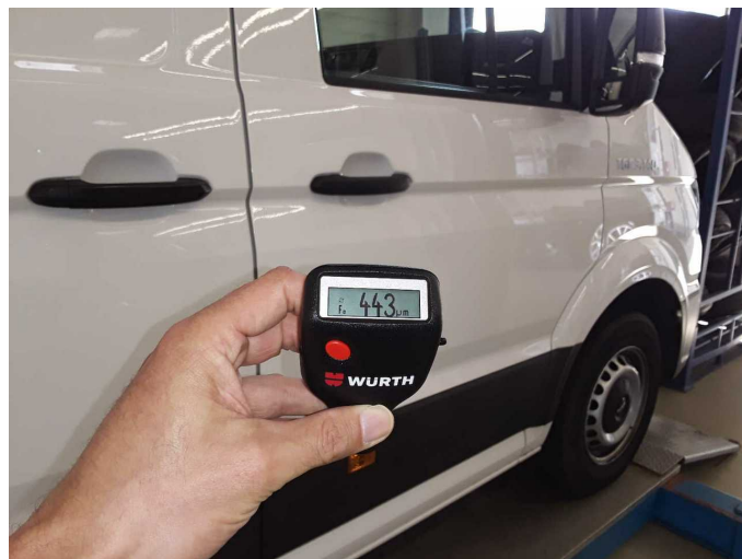
Door - front right side: 443 \mu\text{m}