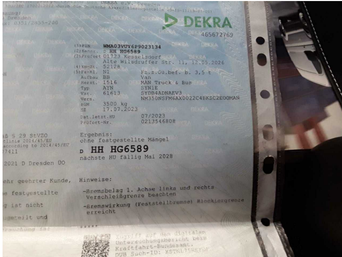
Figure 13: Documents