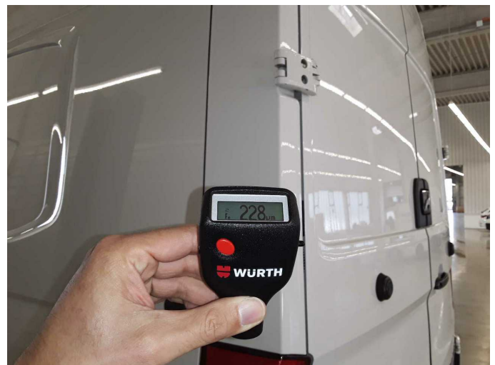
Side panel - rear left side: 228 µm