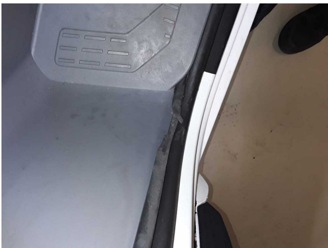
Damage 3: Door - front left side: Door seal - Broken / torn - Replace