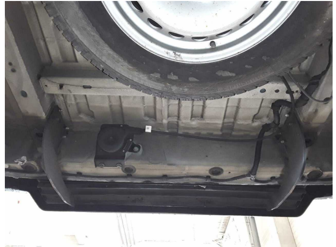
Figure 26: Misc.