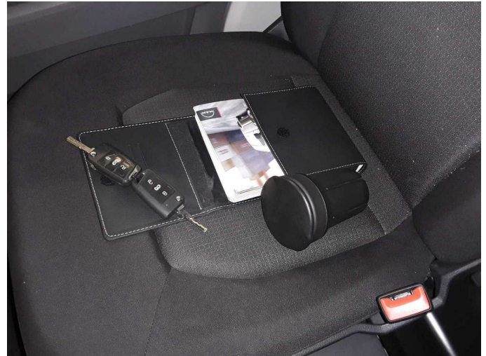
Figure 14: Documents