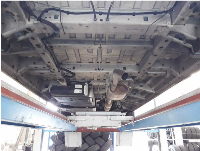
Figure 25: Misc.