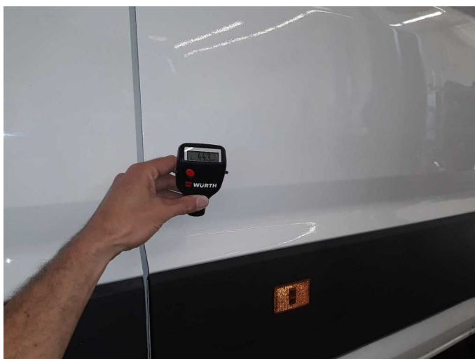
Door - front right side: 443 \mu\text{m}