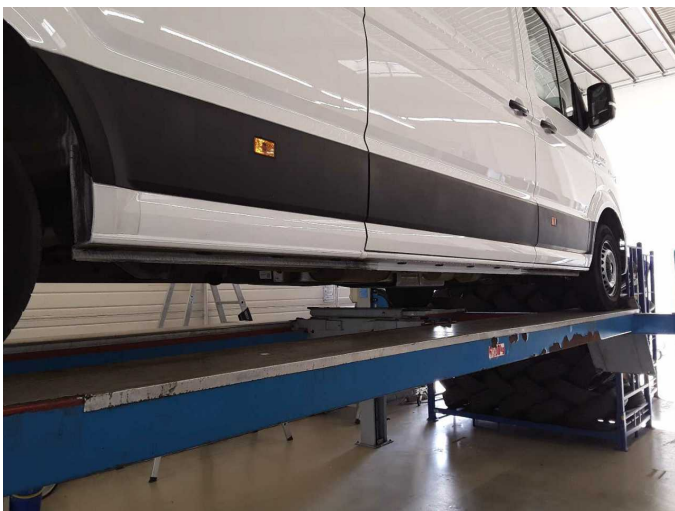
Figure 23: Misc.