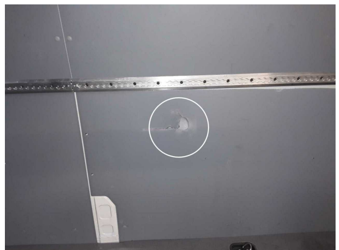
Damage 1: Side panel - rear left side: Interior trim - Broken / torn - Replace