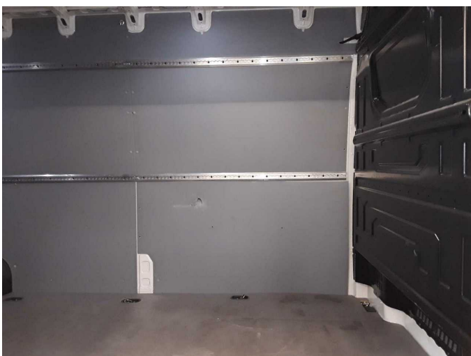
Damage 1: Side panel - rear left side: Interior trim - Broken / torn - Replace