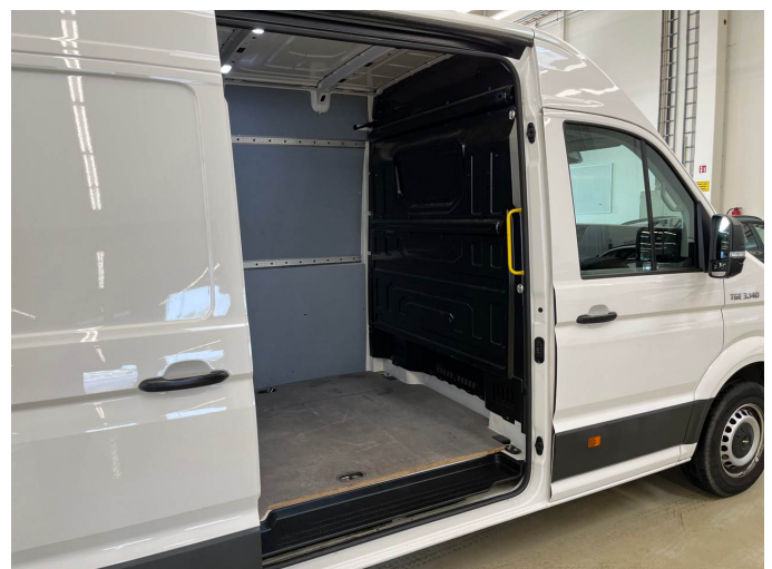
Figure 6: Interior - rear