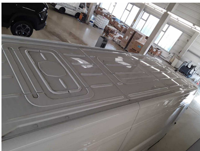
Figure 17: Misc.