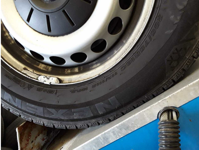
Damage 2: Wheel / tyres: Tyre - front (Winterreifen statt Ganzjahresreifen montiert, Mischbereifung) - Differs from the original configuration - Replace