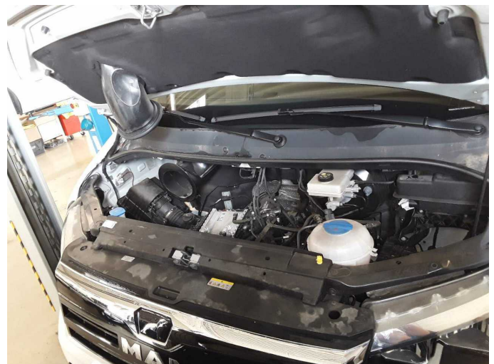
Figure 16: Misc.