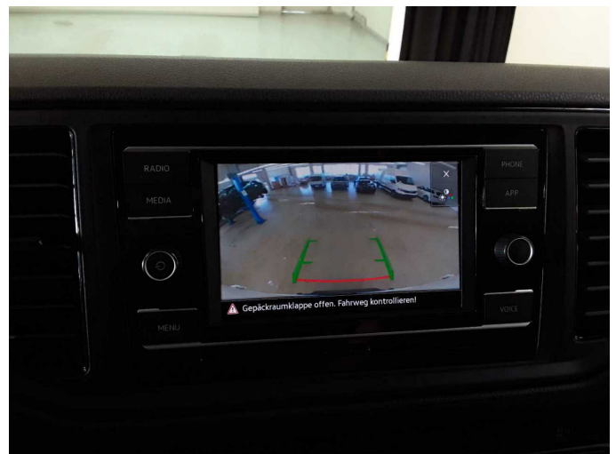
Figure 28: Misc.