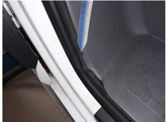
Damage 3: Door - front left side: Door seal - Broken / torn - Replace