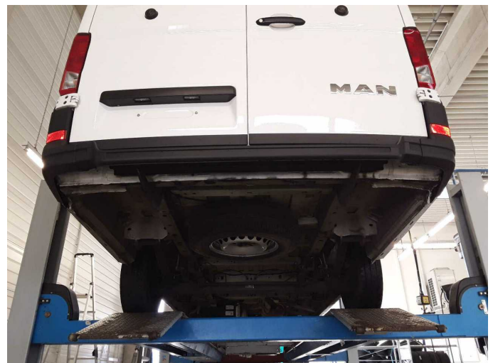
Figure 24: Misc.