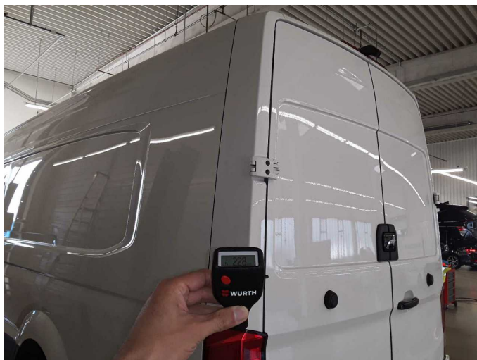
Side panel - rear left side: 228 \mu\text{m}