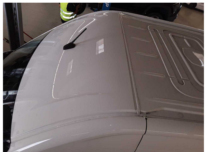
Figure 18: Misc.