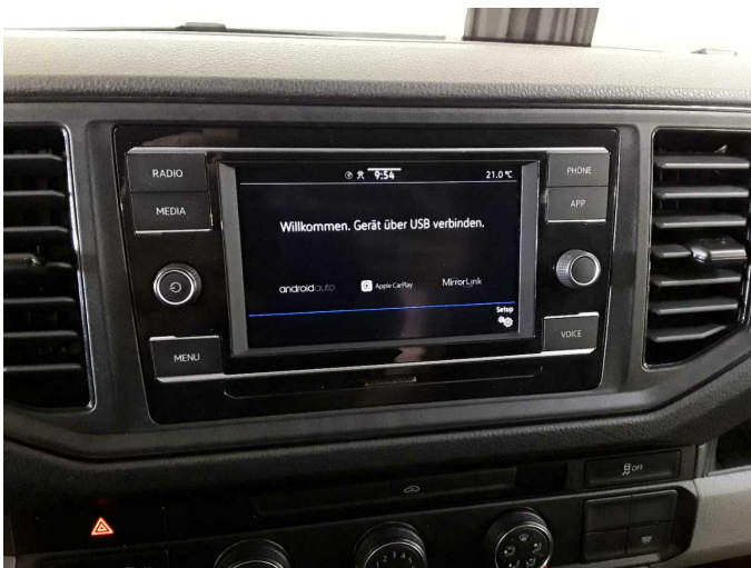
Figure 27: Misc.