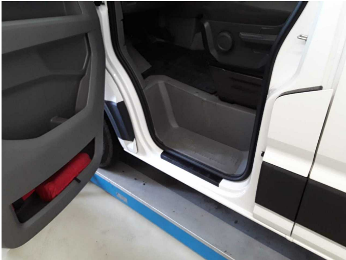
Damage 3: Door - front left side: Door seal - Broken / torn - Replace