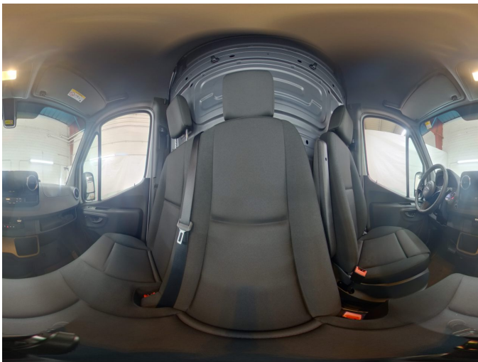
Figure 9: Interior 360° view