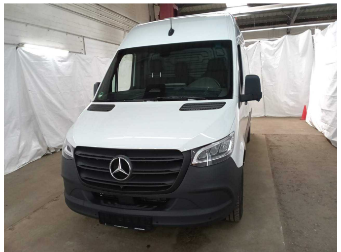
Figure 24: Misc.