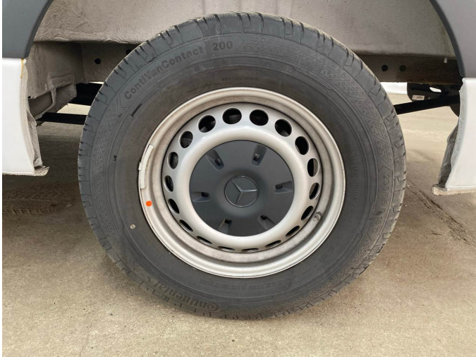
Figure 13: Mounted tyres