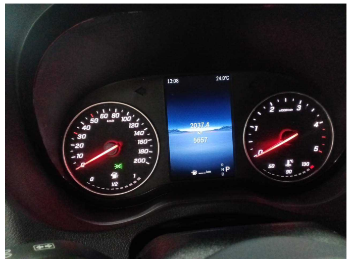
Figure 16: Misc.