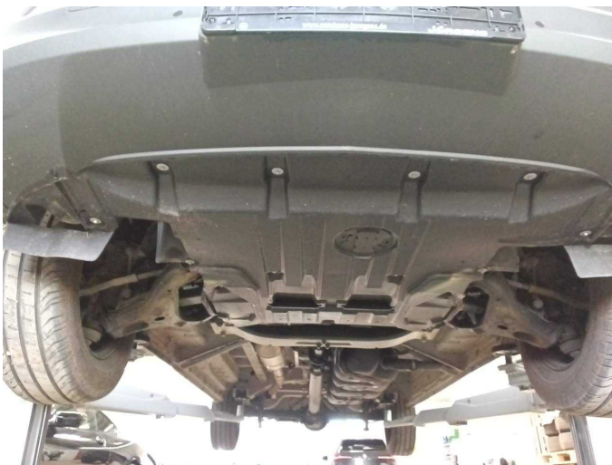
Figure 15: Misc.