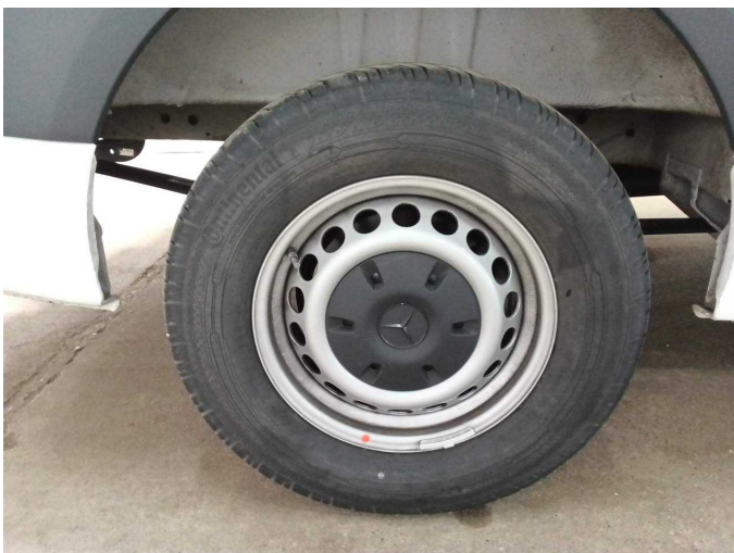
Figure 29: Misc.