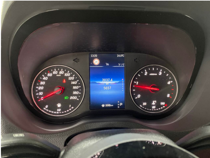
Figure 7: Instrument cluster