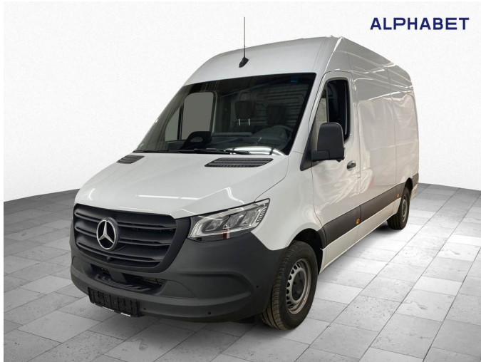
Figure 1: Diagonal front (left)