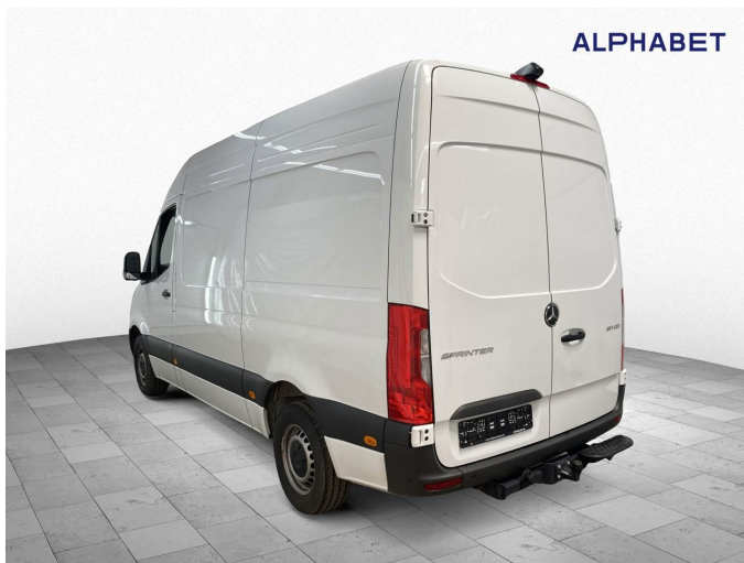
Figure 3: Diagonal rear (left)