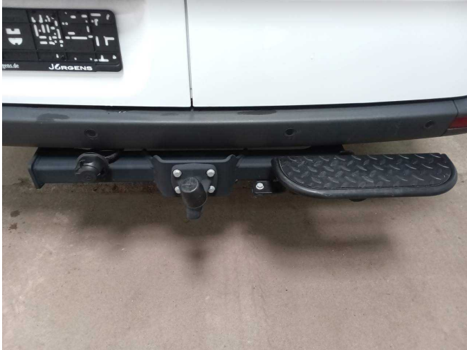
Figure 31: Misc.