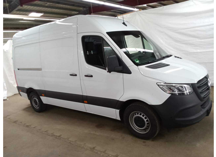
Figure 26: Misc.