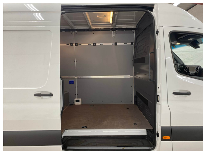
Figure 6: Interior - rear