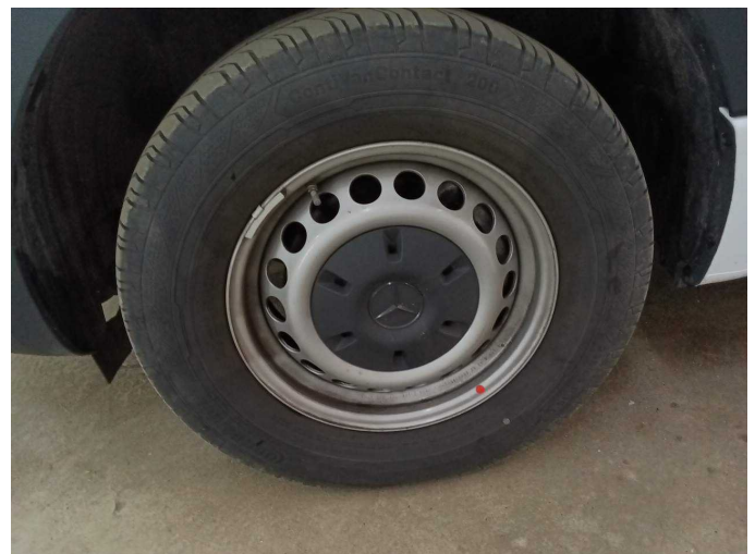
Figure 12: Mounted tyres