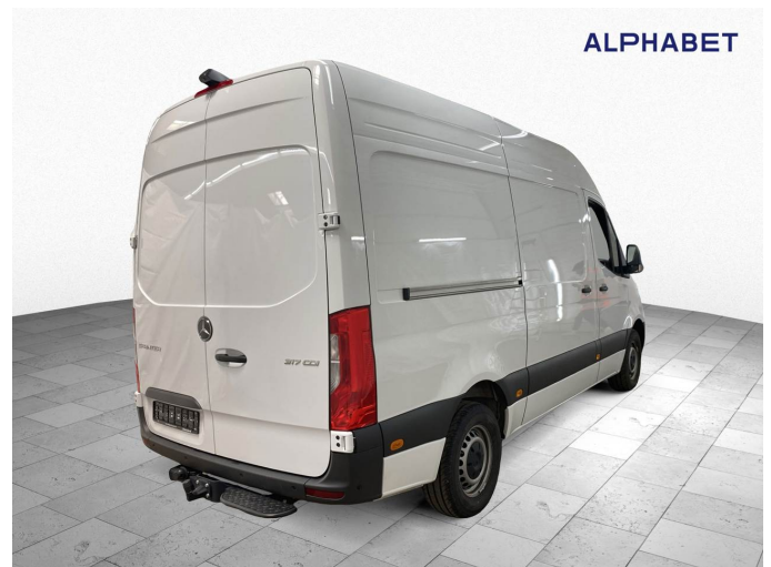
Figure 4: Diagonal rear (right)