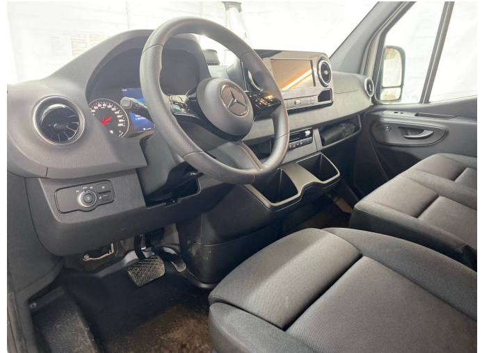
Figure 8: Instrument panel