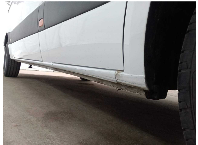
Figure 28: Misc.