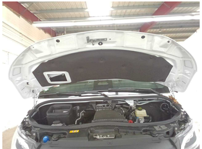
Figure 22: Misc.