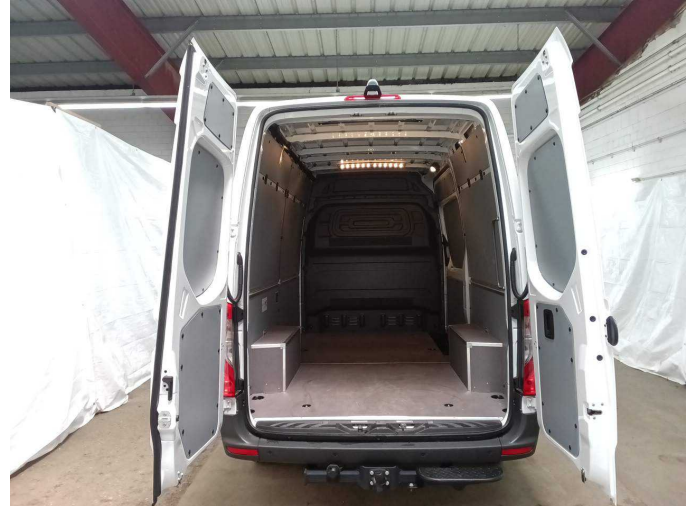
Figure 32: Misc.