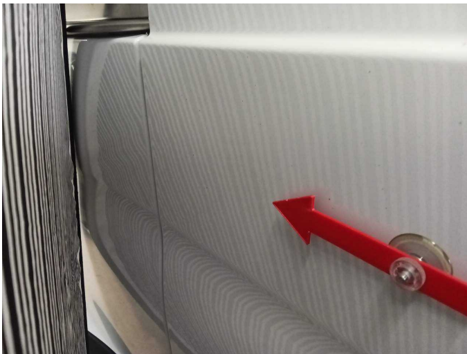
Damage 1: Sliding door, right: Sliding door - dent(s) - Smooth repair work