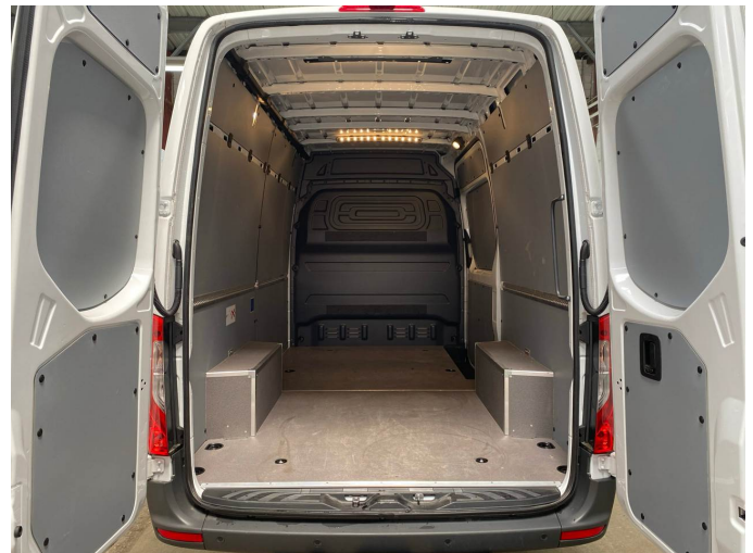
Figure 10: Cargo area