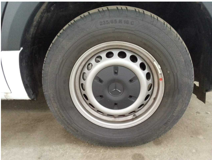
Figure 27: Misc.