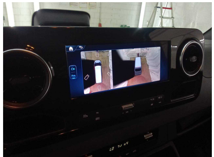
Figure 18: Misc.