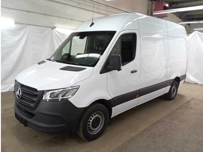
Figure 25: Misc.