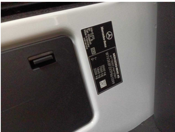
Figure 11: VIN