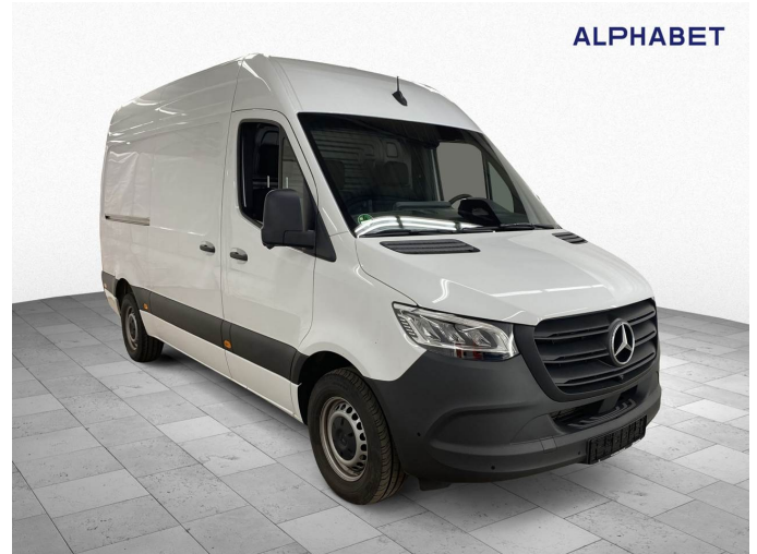
Figure 2: Diagonal front (right)