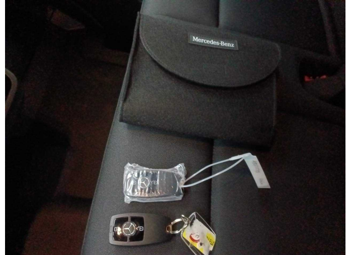
Figure 14: Documents