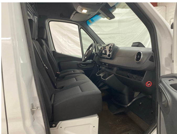
Figure 5: Interior - front