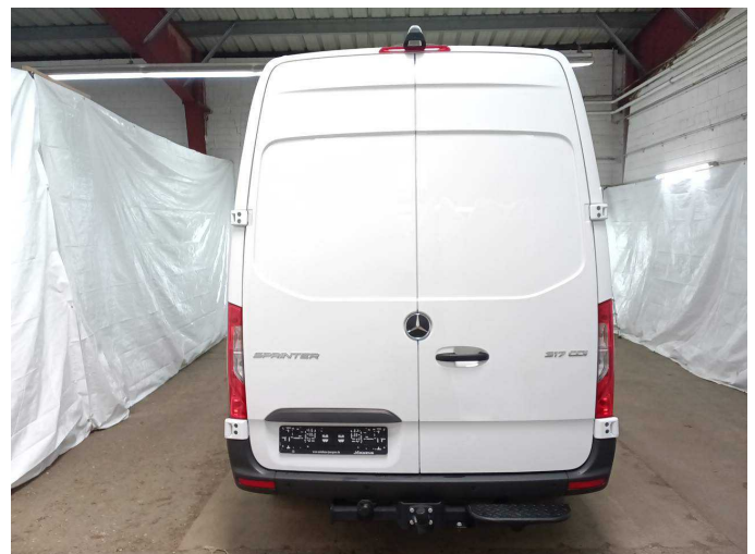
Figure 30: Misc.