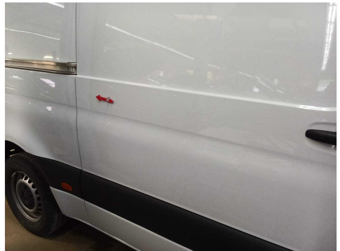
Damage 1: Sliding door, right: Sliding door - dent(s) - Smooth repair work