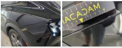
Wing FL, Scratch(es), Repair and paint (complete)