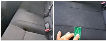
Interior, Not original part, Acceptable