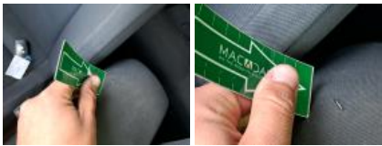
MOT certificate, Missing, Repair/replace (lump sum)