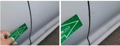
Door FR, Dent(s) and scratch(es), Repair and paint (complete)