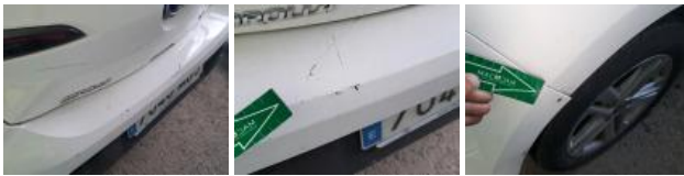
Bumper spoiler Rear, Scratch(es), Repair and paint (complete)