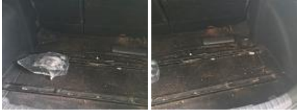
Tailgate / Boot, Scratch(es), Repair and paint (complete)