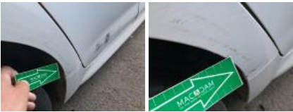
Door RR, Scratch(es), Repair and paint (complete)