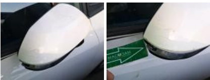
Outside rear-view mirror housing R, Scratch(es), Repair and paint (complete)