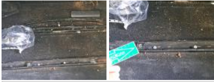
Boot lid covering R, Scratch(es), Replace