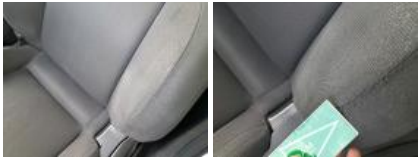
Armrest F M, Tear, Replace