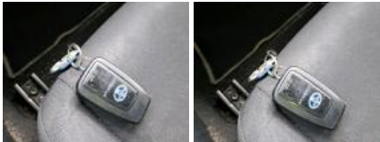
Ignition key, Missing, Repair/replace (lump sum)