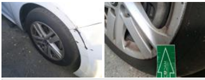
Outer sill R, Scratch(es), Repair and paint (complete)