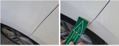
Bumper F, Broken, Replace and paint