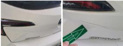
Bumper R, Dent(s) and scratch(es), Repair and paint (complete)