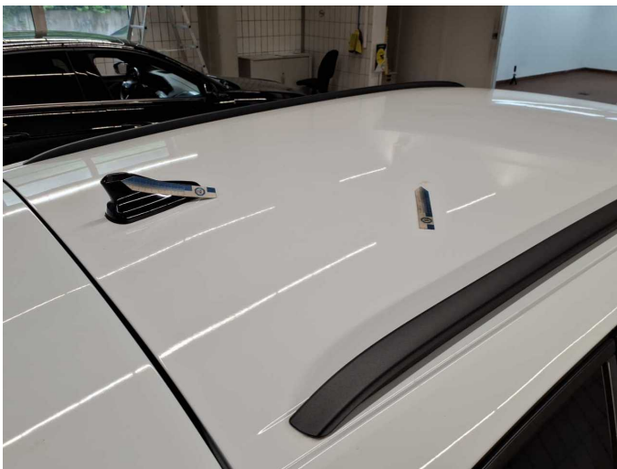
Damage 1: Roof: Roof (Folgekosten möglich) - Soiled - Conditioning