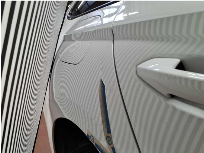
Damage 6: Side panel - rear right side: Side panel - Scratch(es) - Repair and paint