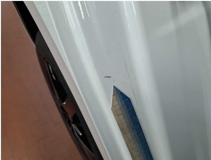
Damage 3: Side panel - rear right side: Sill - Scratch(es) - Smart repair