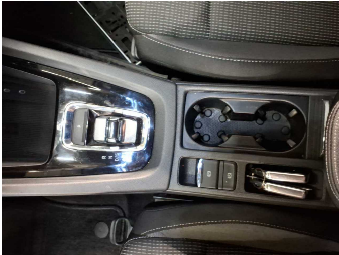
Figure 31: Misc.