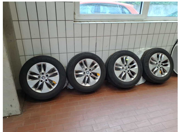
Figure 16: Additional tyres