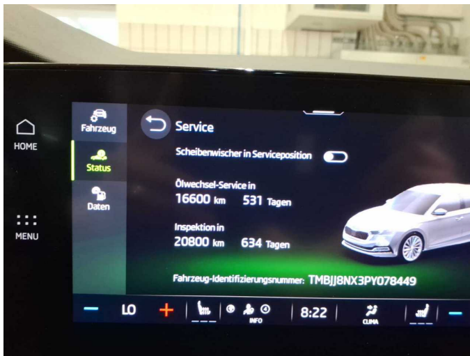
Figure 15: Documents