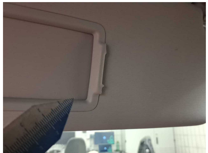
Damage 2: Interior: Sun visor - left side - Broken / torn - Replace