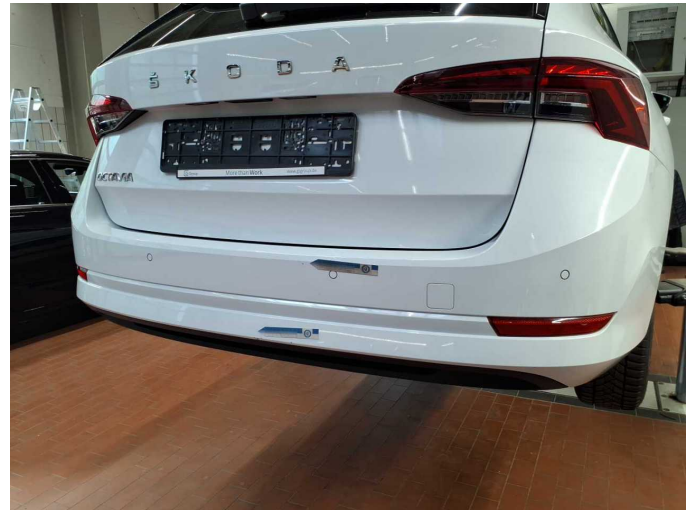
Damage 4: Rear bumper: Rear bumper - Scratch(es) - Paint