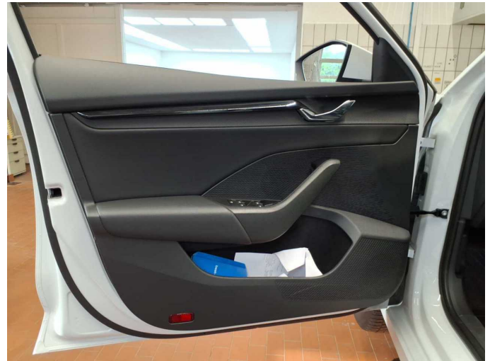
Figure 28: Misc.