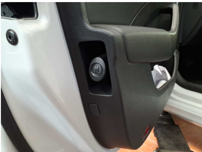
Figure 29: Misc.