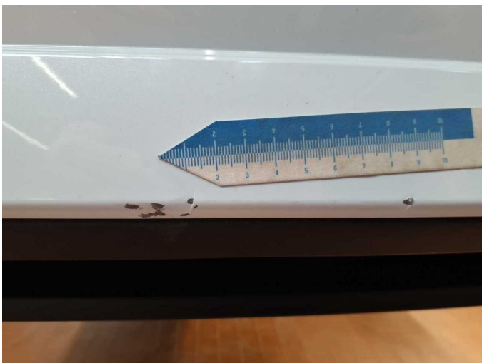
Damage 4: Rear bumper: Rear bumper - Scratch(es) - Paint