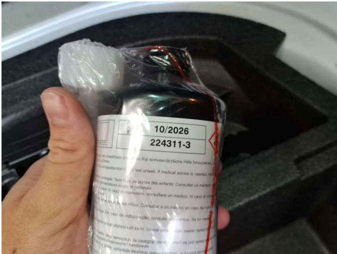
Figure 27: Misc.