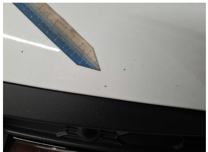
Wear and tear 1: Front bumper: Front bumper - Stone chips - No deduction