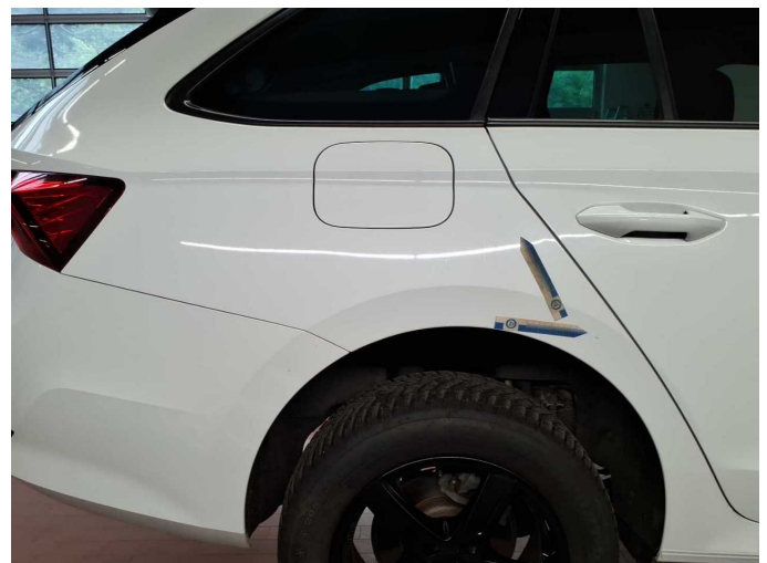
Damage 6: Side panel - rear right side: Side panel - Scratch(es) - Repair and paint