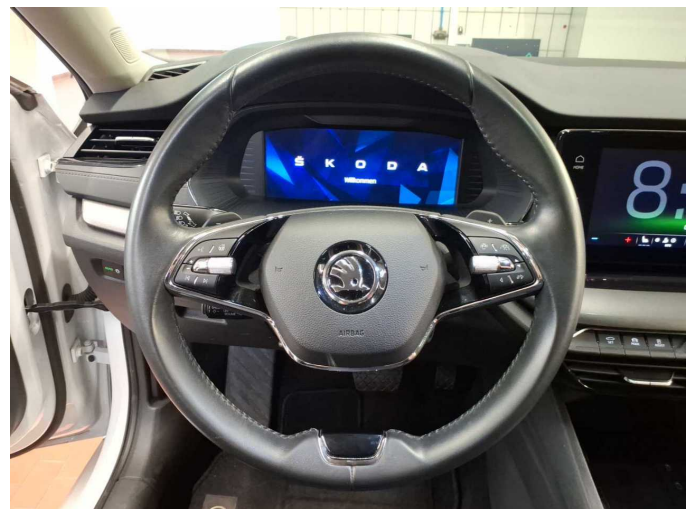
Figure 30: Misc.