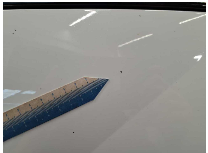
Wear and tear 1: Front bumper: Front bumper - Stone chips - No deduction