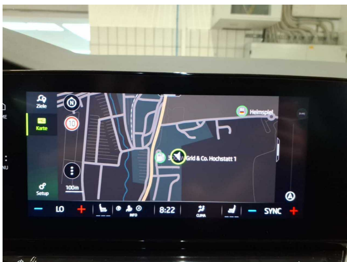
Figure 17: Navigation