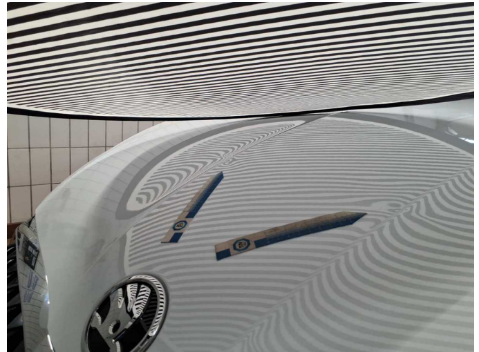
Damage 5: Bonnet: Bonnet - dent(s) - Repair and paint