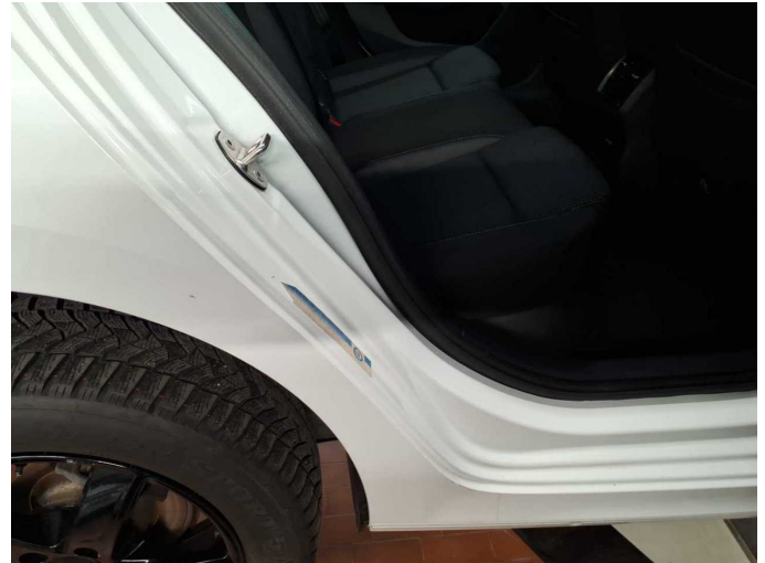
Damage 3: Side panel - rear right side: Sill - Scratch(es) - Smart repair