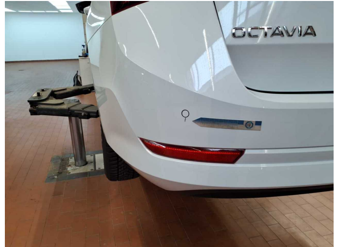
Damage 4: Rear bumper: Rear bumper - Scratch(es) - Paint