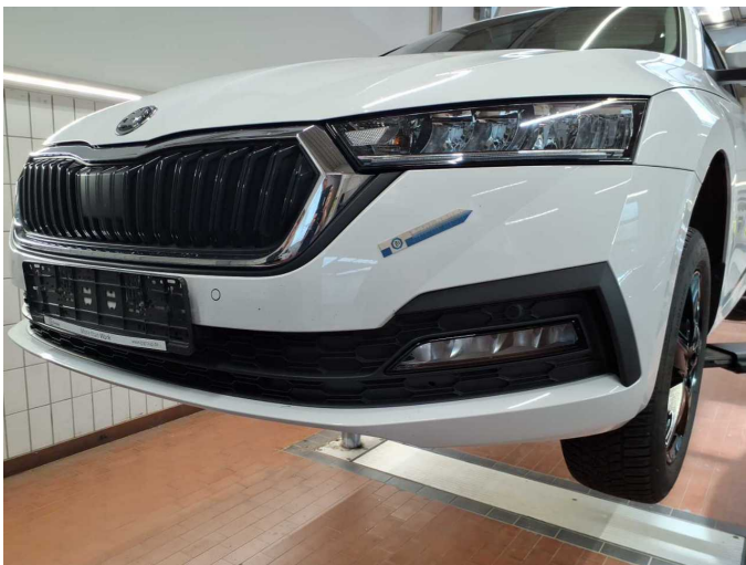
Wear and tear 1: Front bumper: Front bumper - Stone chips - No deduction