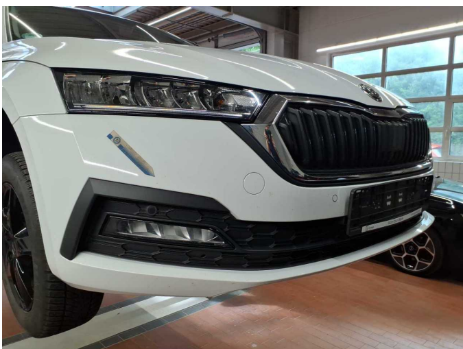
Wear and tear 1: Front bumper: Front bumper - Stone chips - No deduction