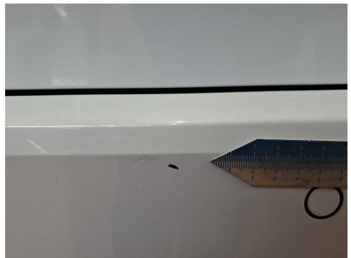
Damage 4: Rear bumper: Rear bumper - Scratch(es) - Paint