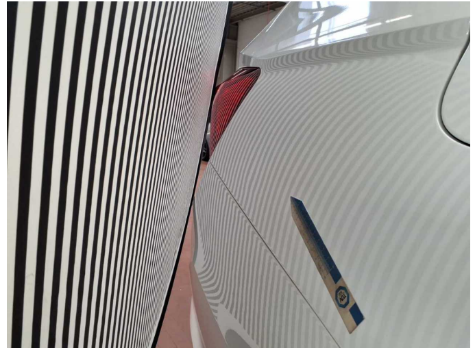
Damage 6: Side panel - rear right side: Side panel - Scratch(es) - Repair and paint