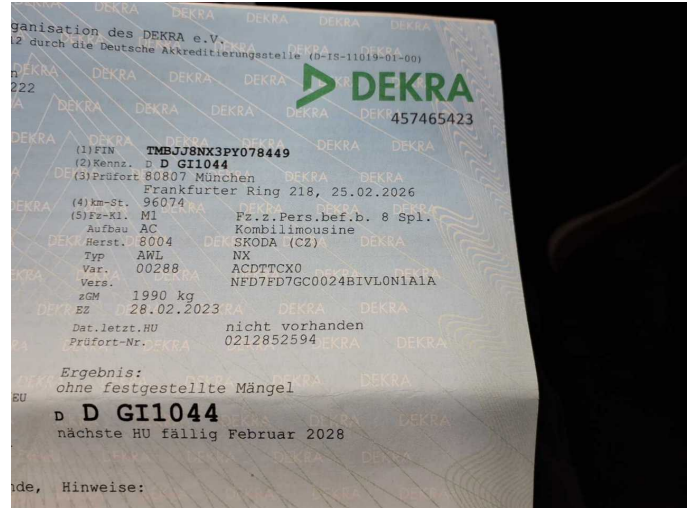
Figure 14: Documents