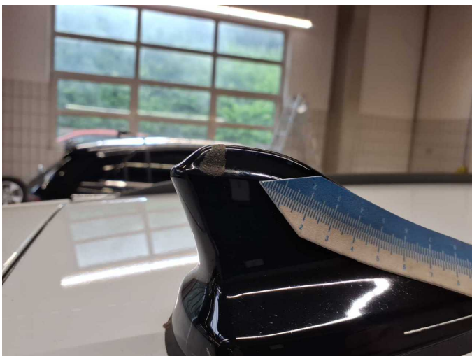
Damage 1: Roof: Roof (Folgekosten möglich) - Soiled - Conditioning