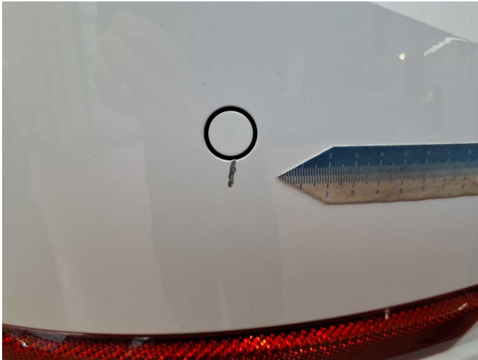
Damage 4: Rear bumper: Rear bumper - Scratch(es) - Paint