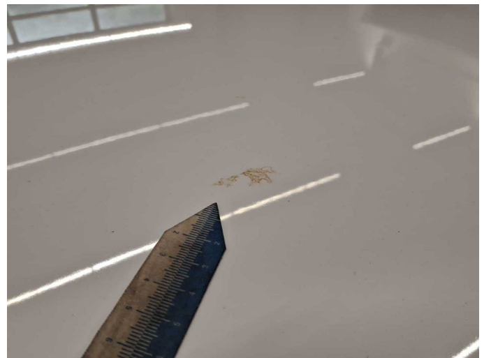
Damage 1: Roof: Roof (Folgekosten möglich) - Soiled - Conditioning