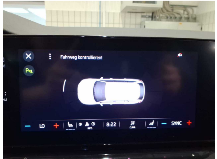
Figure 32: Misc.