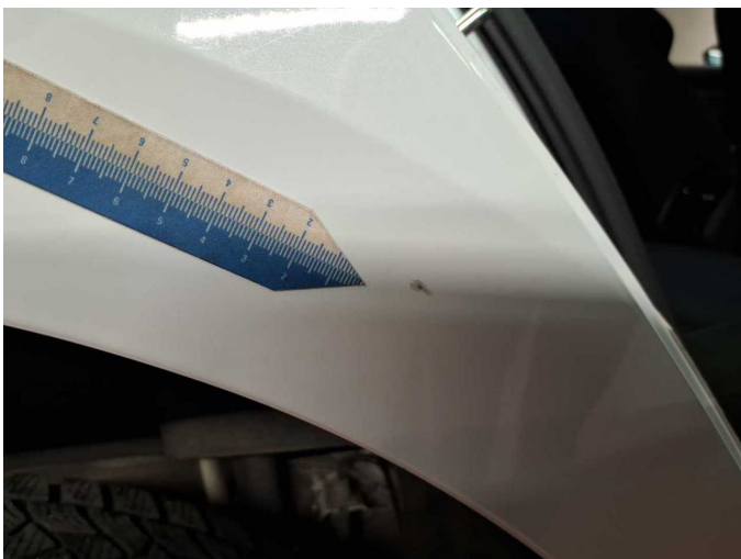
Damage 6: Side panel - rear right side: Side panel - Scratch(es) - Repair and paint