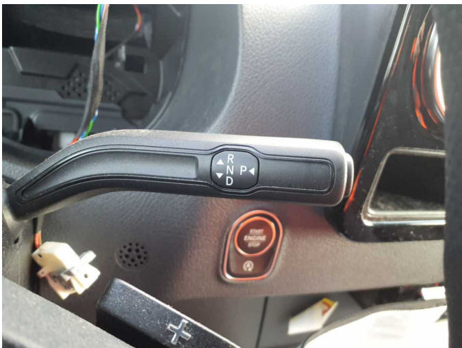
Figure 17: Misc.