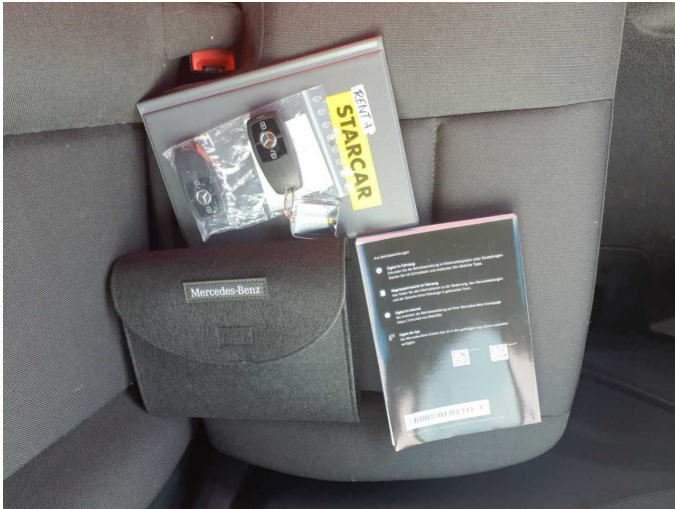
Figure 13: Documents