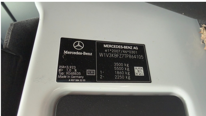
Figure 11: VIN