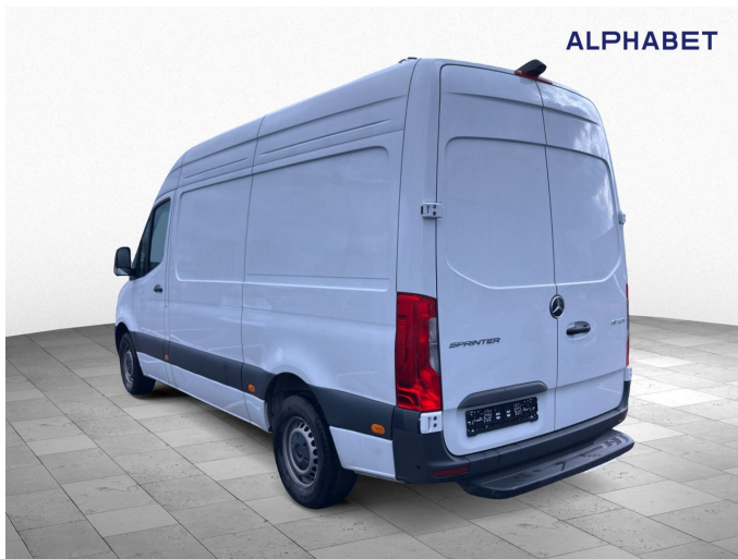
Figure 3: Diagonal rear (left)