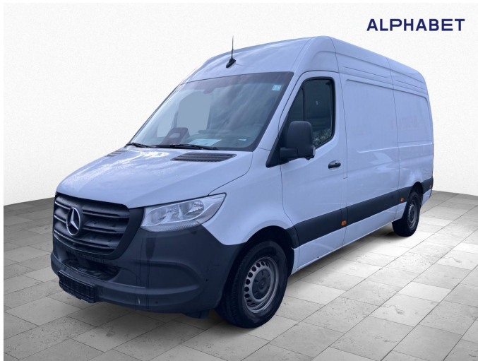
Figure 1: Diagonal front (left)