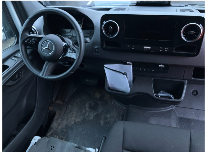
Figure 8: Instrument panel