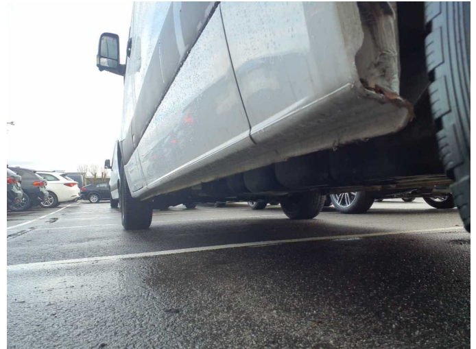
Figure 20: Misc.