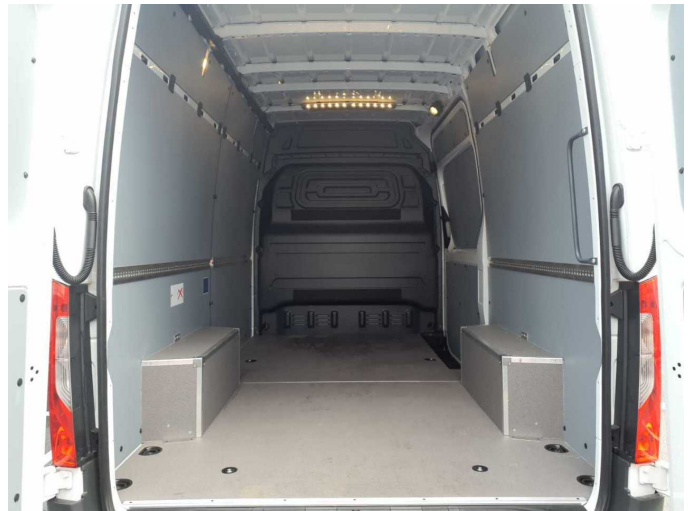
Figure 10: Cargo area