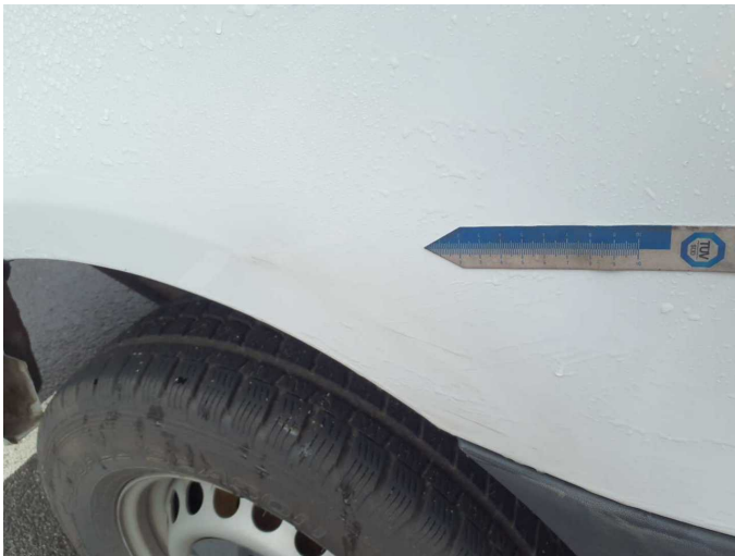
Damage 2: Side panel - rear right side: Side panel - Dent / paintcoat damage - Repair and paint