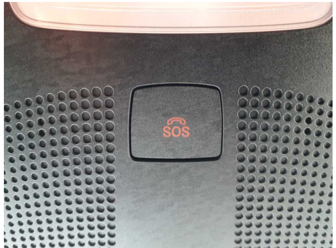
Figure 16: Misc.