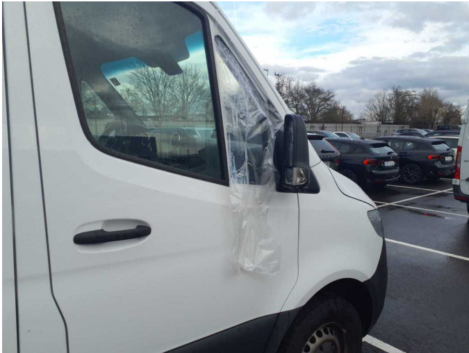
Damage 1: Vehicle glazing: Triangular window - right side - Damaged - Replace