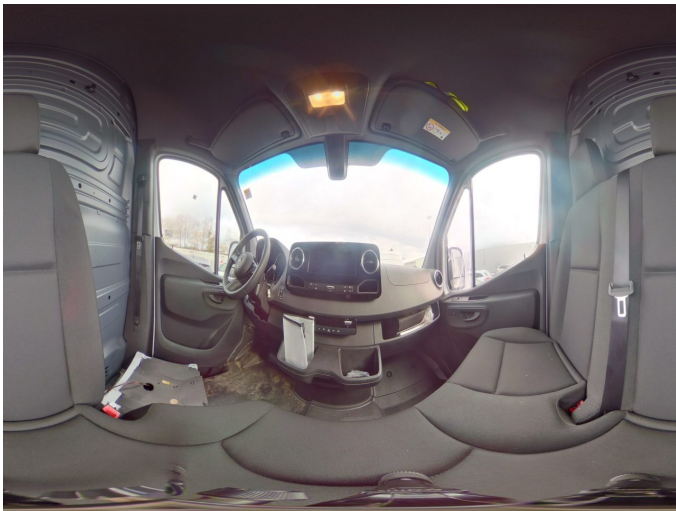
Figure 9: Interior 360° view