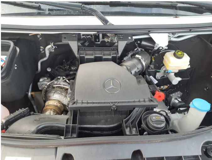
Figure 21: Misc.