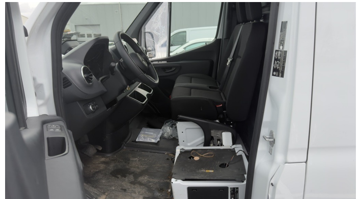
Damage 4: Seat - front: Seat - left side - Missing - Replace