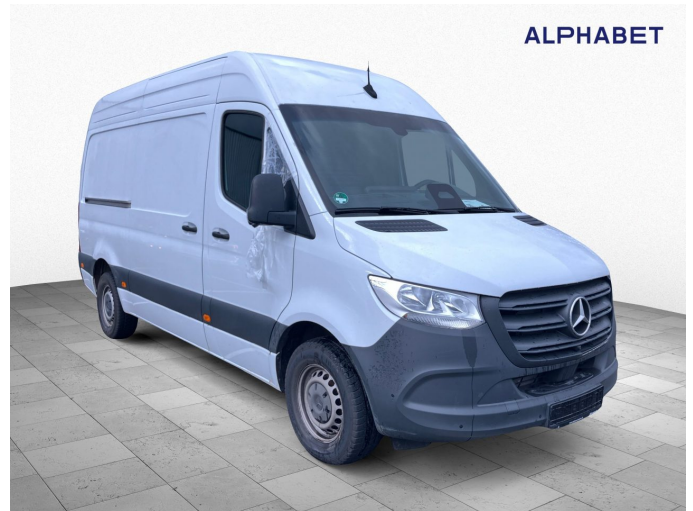
Figure 2: Diagonal front (right)