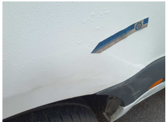
Damage 2: Side panel - rear right side: Side panel - Dent / paintcoat damage - Repair and paint