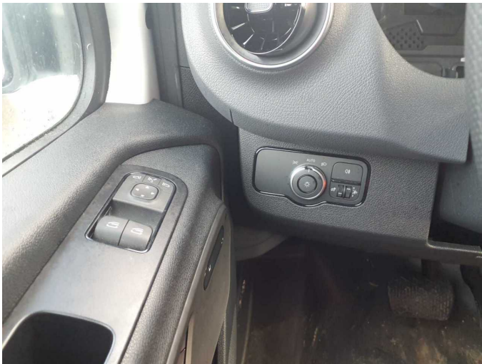
Figure 15: Misc.