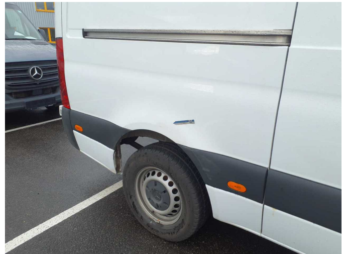
Damage 2: Side panel - rear right side: Side panel - Dent / paintcoat damage - Repair and paint