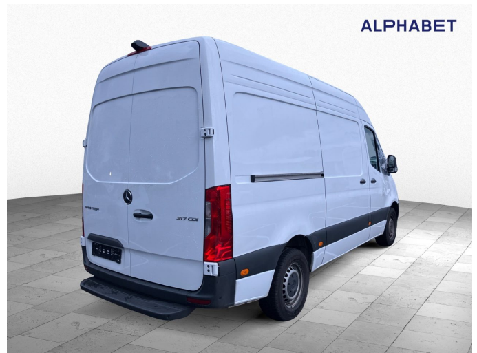
Figure 4: Diagonal rear (right)