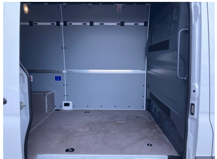
Figure 6: Interior - rear