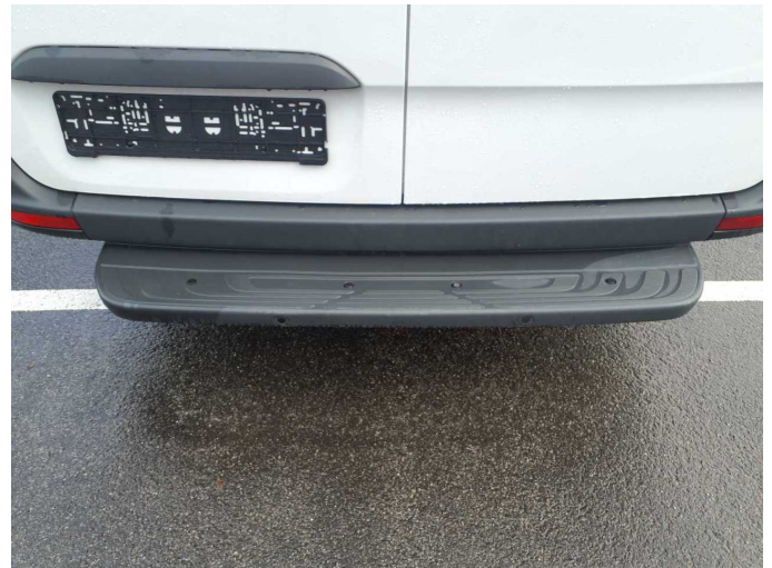
Figure 22: Misc.