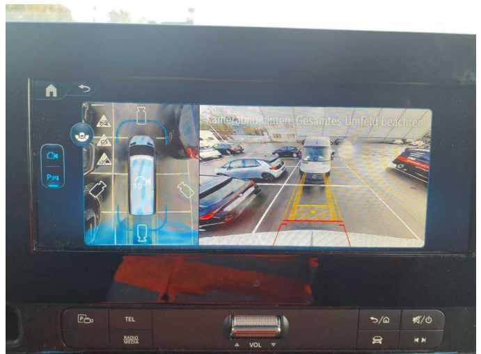
Figure 18: Misc.