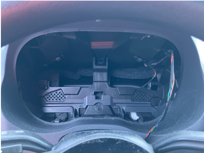
Figure 7: Instrument cluster