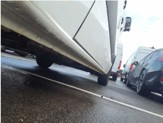
Figure 19: Misc.