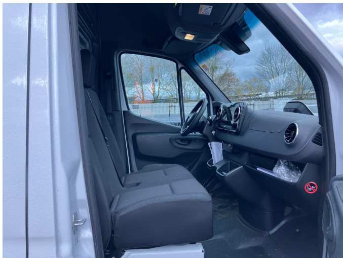
Figure 5: Interior - front