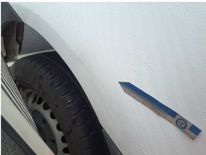
Damage 2: Side panel - rear right side: Side panel - Dent / paintcoat damage - Repair and paint