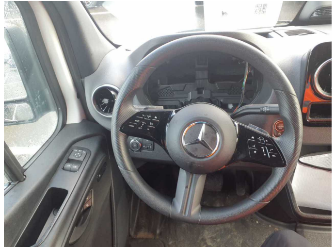
Figure 14: Misc.