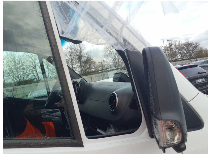
Damage 1: Vehicle glazing: Triangular window - right side - Damaged - Replace