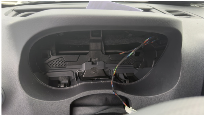
Damage 3: Instrument panel: Instrument cluster (Steckverbindung Kabelbaum intakt) - Missing - Replace