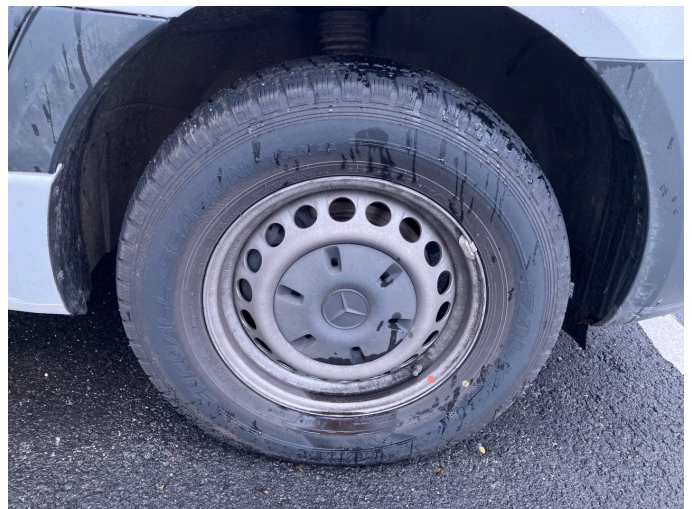
Figure 12: Mounted tyres