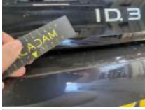
Tailgate / Boot, Scratch(es), Repair and paint (complete)