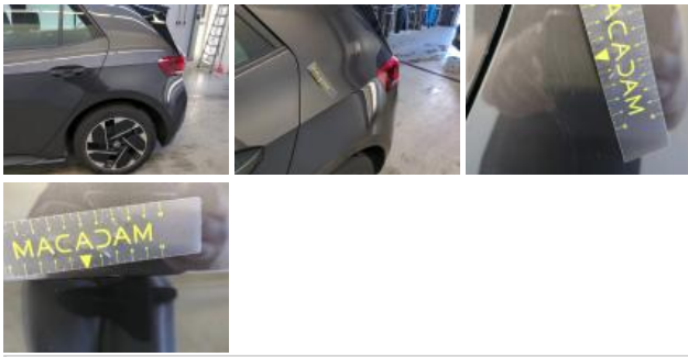
Door RL, Scratch(es), Repair and paint (complete)