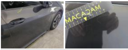
Bumper R, Scratch(es), Repair and paint (complete)