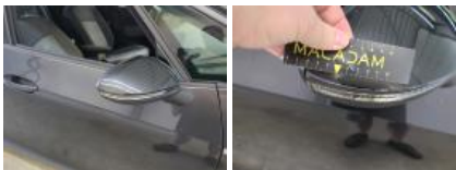
Door FR, Scratch(es), Repair and paint (complete)