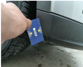
Bumper Front / Trim Right / Replace-scratch