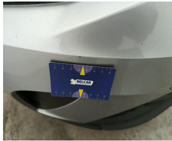
Bumper Front // Smart Repair Large-scratch