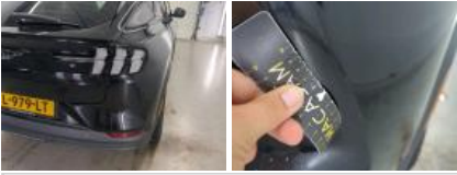
Tailgate / Boot, Scratch(es), Repair and paint (complete)