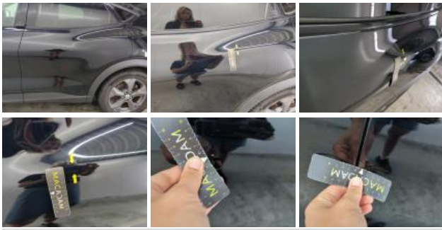
Wing FL, Dent(s), Repair and paint (complete)