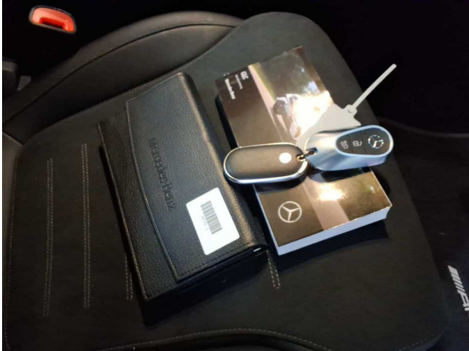
Figure 13: Documents