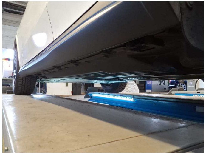
Figure 22: Misc.