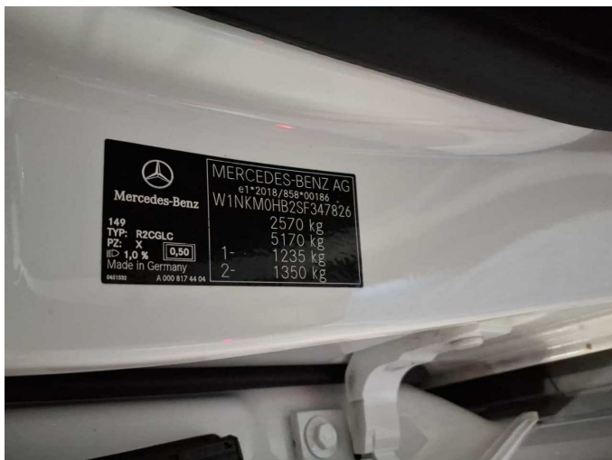
Figure 11: VIN