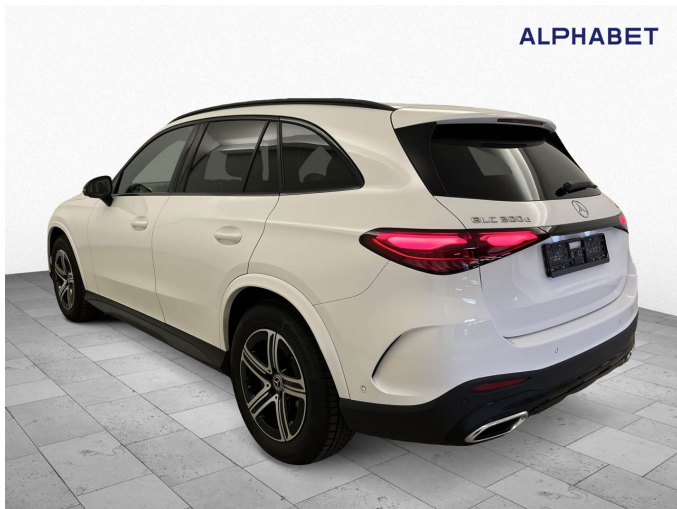
Figure 3: Diagonal rear (left)