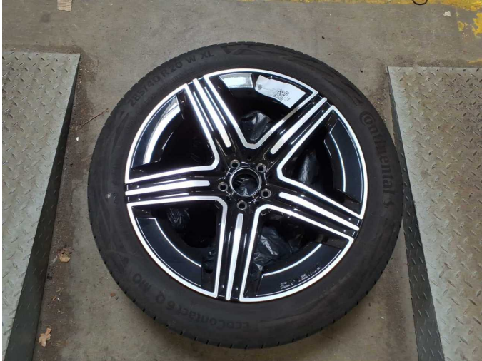
Figure 25: Misc.