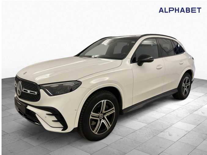
Figure 1: Diagonal front (left)