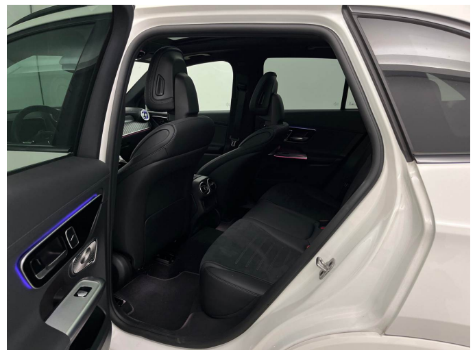
Figure 6: Interior - rear