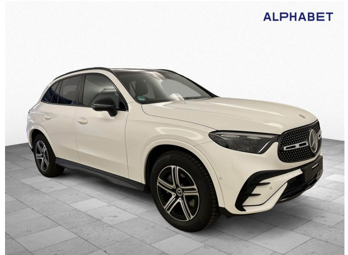
Figure 2: Diagonal front (right)