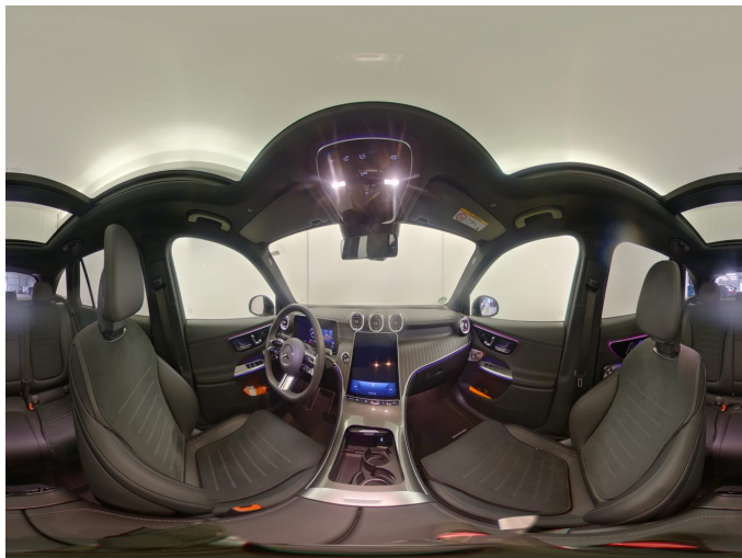
Figure 9: Interior 360° view