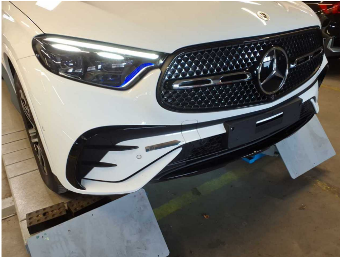
Damage 1: Front bumper: Front bumper - Stone chips - Smart repair