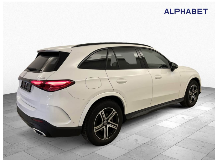
Figure 4: Diagonal rear (right)