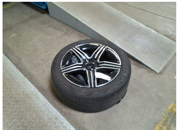
Missing part 1: 2nd wheel set: 2nd wheel set (3 Räder fehlen) - Missing - Replace