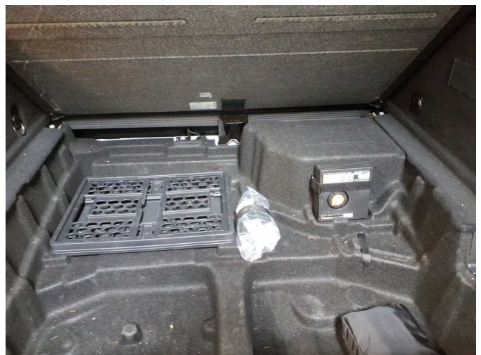
Figure 24: Misc.