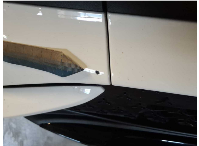
Damage 1: Front bumper: Front bumper - Stone chips - Smart repair