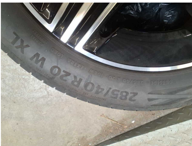
Missing part 1: 2nd wheel set: 2nd wheel set (3 Räder fehlen) - Missing - Replace