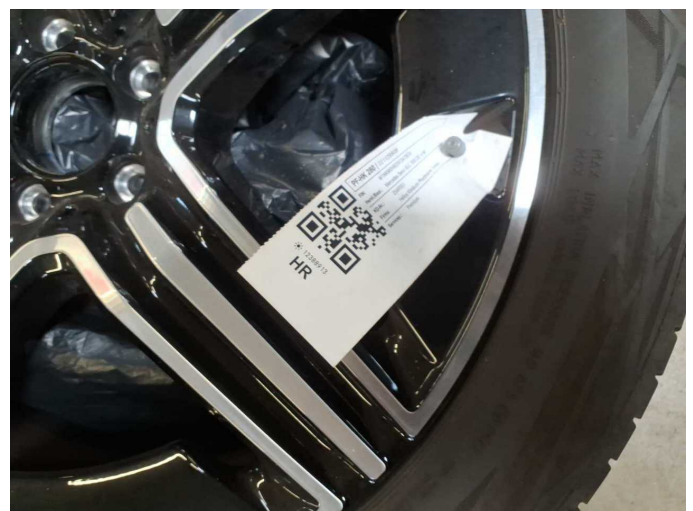
Missing part 1: 2nd wheel set: 2nd wheel set (3 Räder fehlen) - Missing - Replace