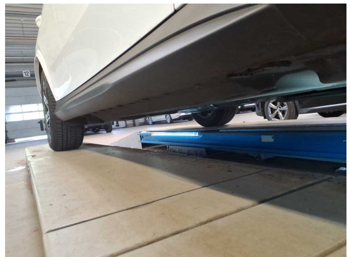
Figure 30: Misc.