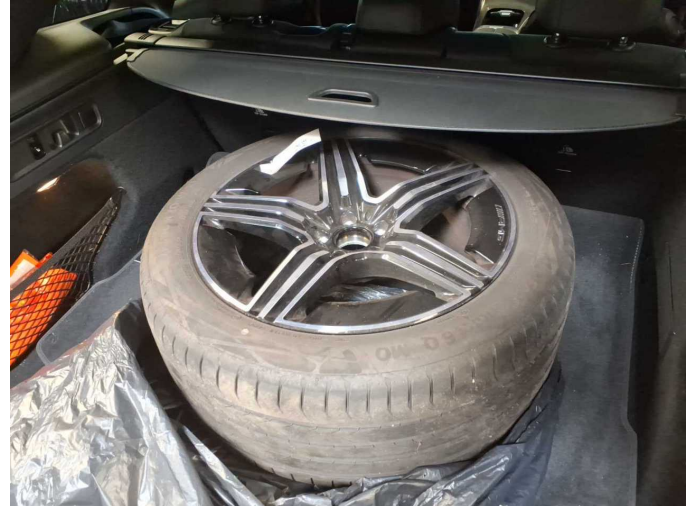
Figure 14: Additional tyres