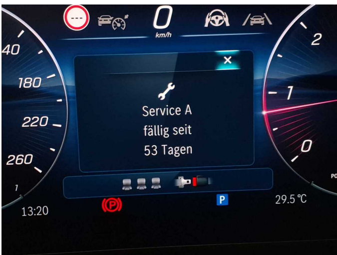
Figure 17: Misc.