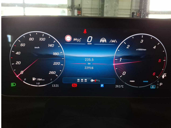
Figure 7: Instrument cluster