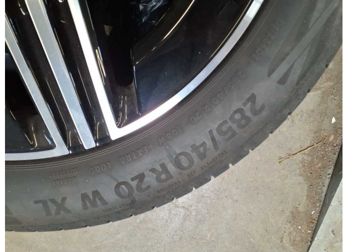
Figure 26: Misc.