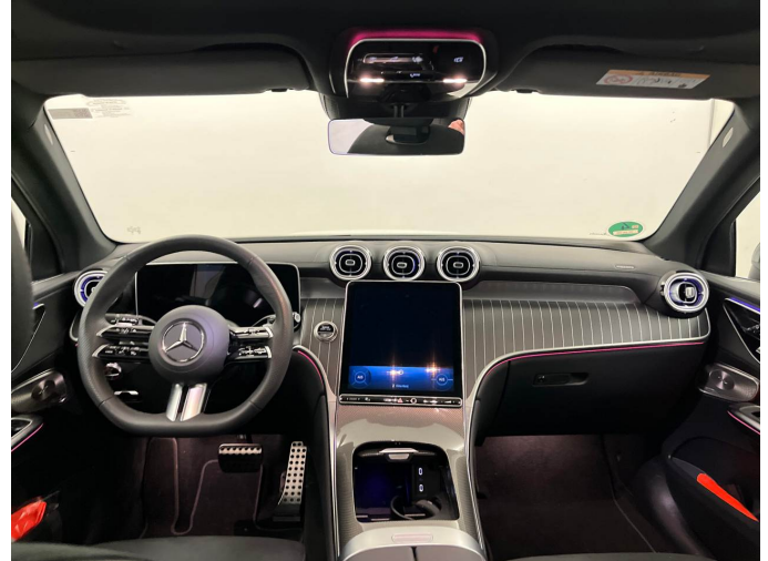
Figure 8: Instrument panel