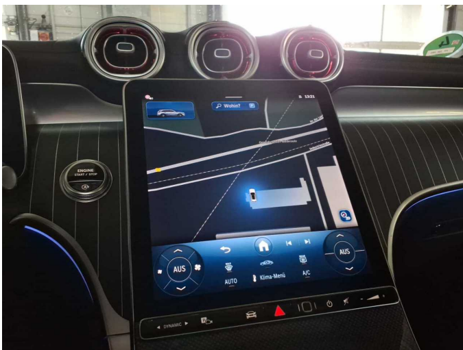
Figure 15: Navigation