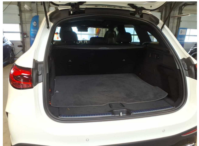
Figure 10: Cargo area