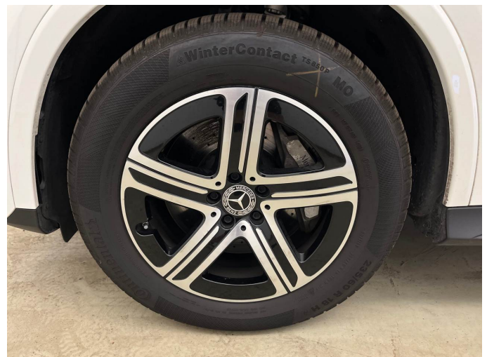
Figure 12: Mounted tyres