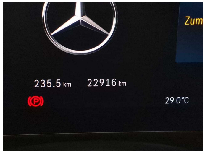
Figure 16: Misc.