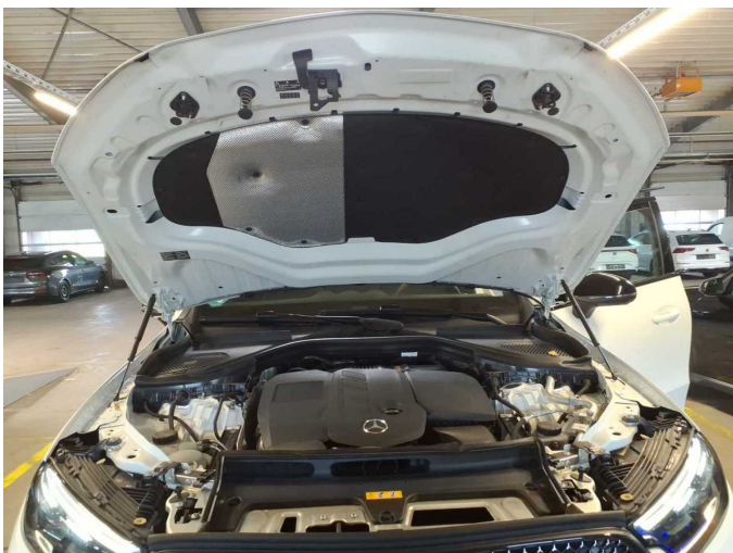
Figure 29: Misc.