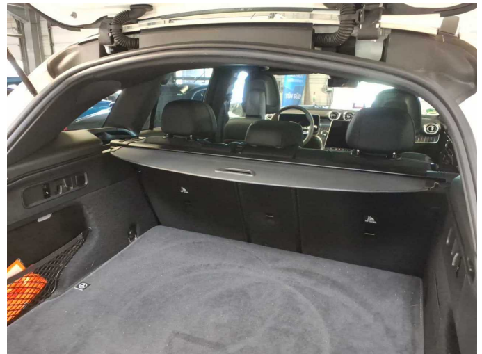
Figure 28: Misc.