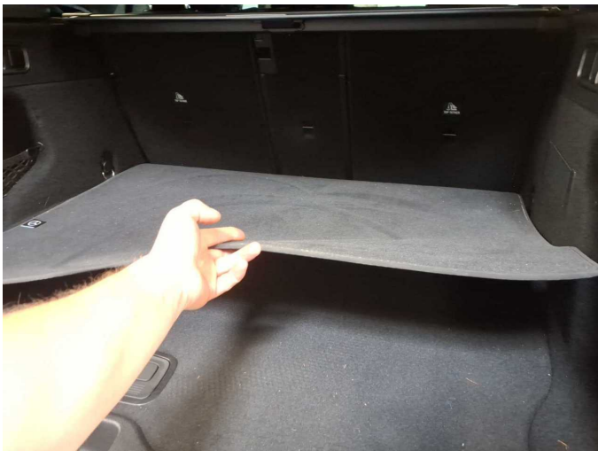
Figure 27: Misc.