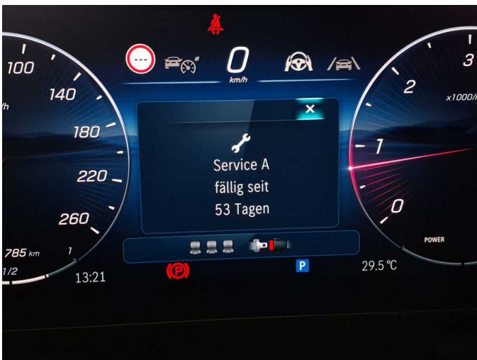
Damage 2: Misc.: Inspection / maintenance - Due - Perform