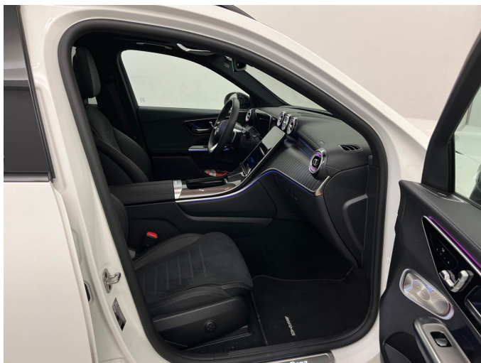
Figure 5: Interior - front