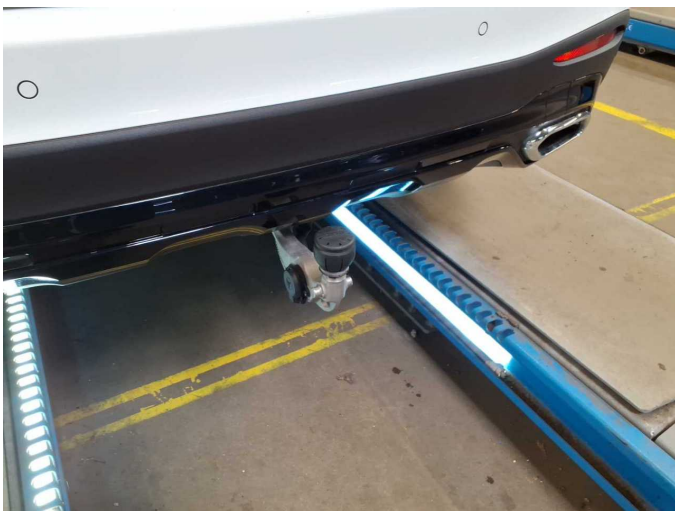
Figure 23: Misc.