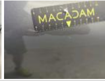
Door FR, Dent(s) and scratch(es), Repair and paint (complete)