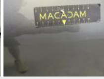
Bumper R, Scratch(es), Repair and paint (complete)