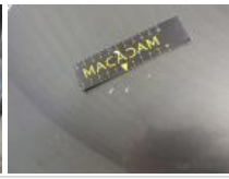
Door RR, Dent(s) and scratch(es), Repair and paint (complete)