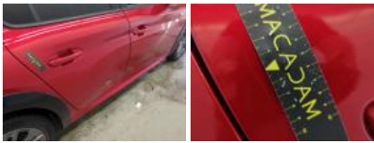
Bumper R, Scratch(es), Repair and paint (complete)