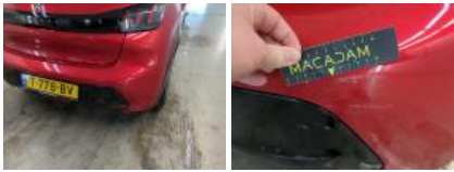
Bumper RM, Scratch(es), Repair and paint (complete)