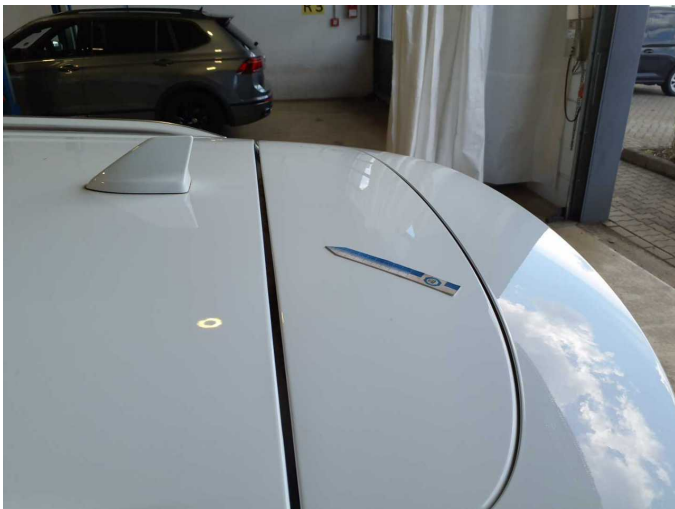
Damage 1: Boot lid / rear door: Boot lid - dent(s) - Smooth repair work