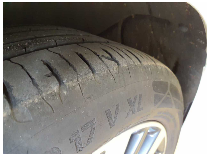
Damage 2: Wheel / tyres: Tyre - front (einseitig abgefahren) - Does not meet the leasing specifications - Replace