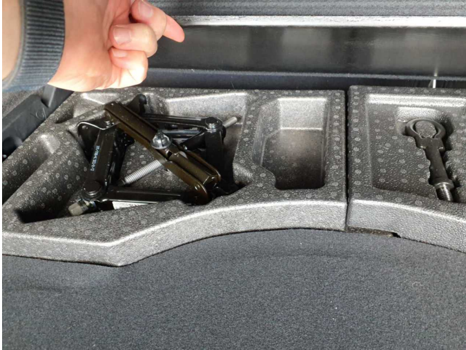
Figure 31: Misc.