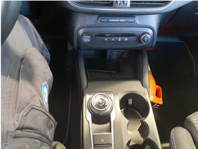
Figure 19: Misc.