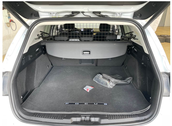
Figure 10: Cargo area