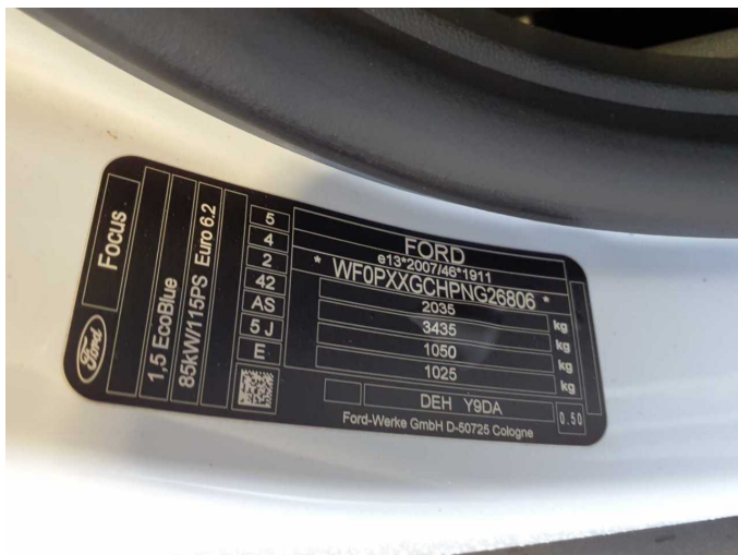
Figure 11: VIN