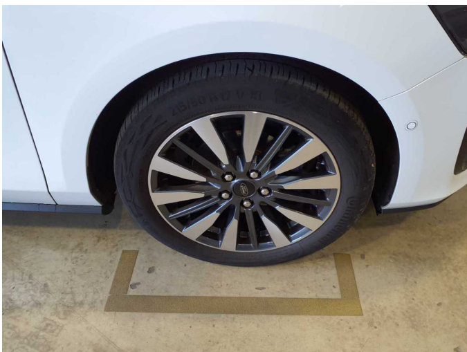
Damage 2: Wheel / tyres: Tyre - front (einseitig abgefahren) - Does not meet the leasing specifications - Replace