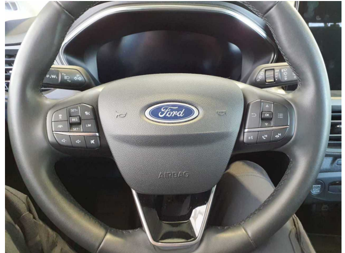
Figure 20: Misc.