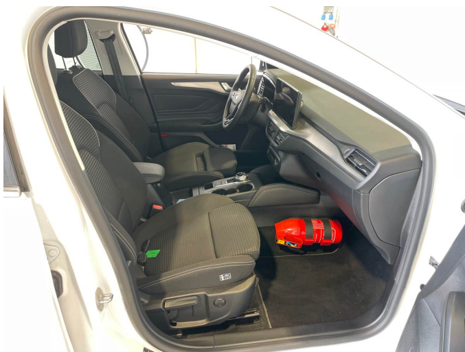
Figure 5: Interior - front