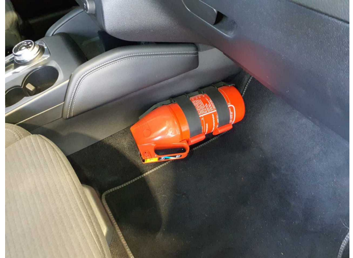
Figure 26: Misc.