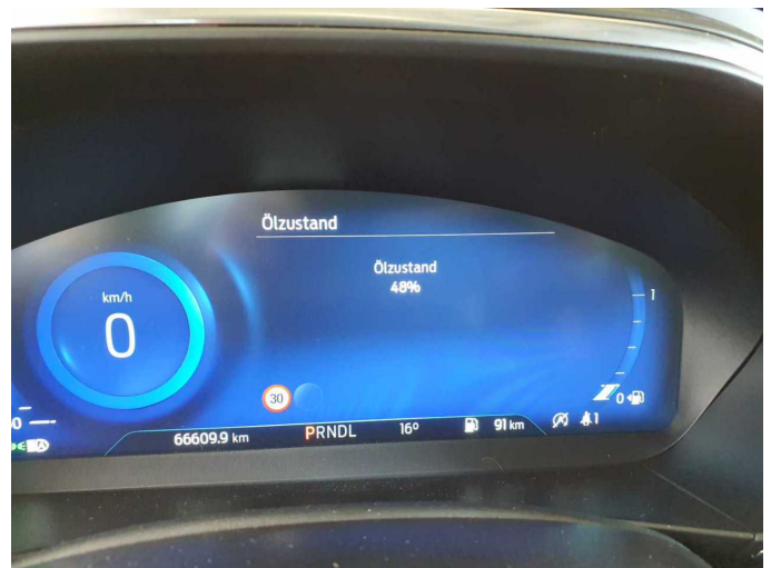
Figure 22: Misc.