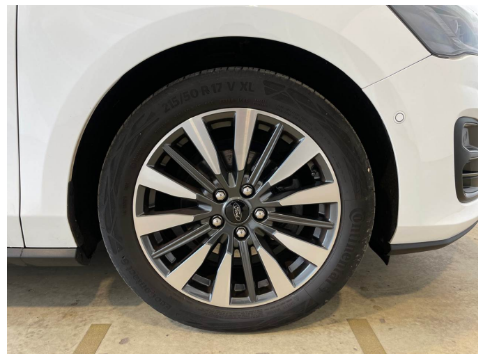
Figure 12: Mounted tyres