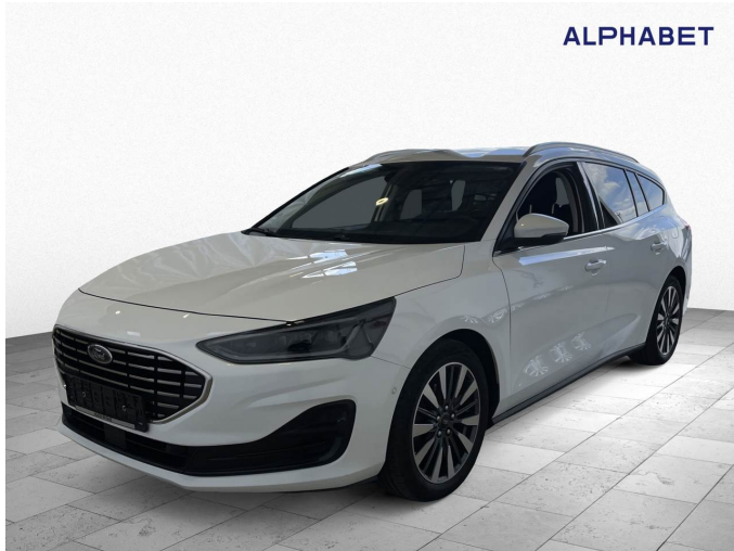
Figure 1: Diagonal front (left)