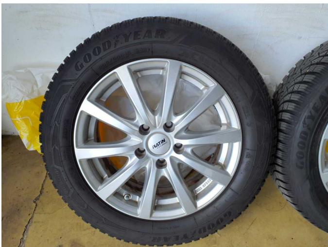
Figure 29: Misc.