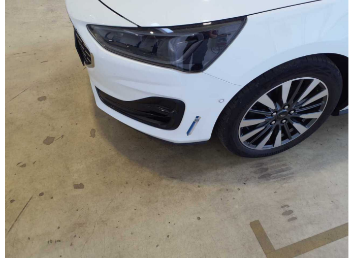
Damage 3: Front bumper: Front bumper - Scratch(es) - Paint