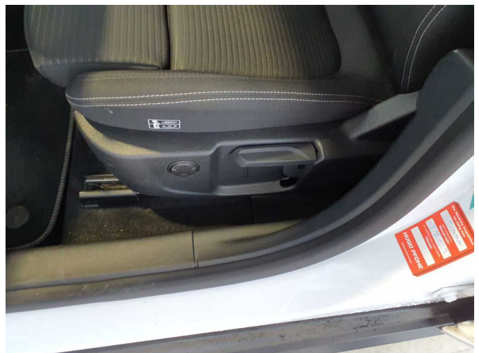
Figure 18: Misc.