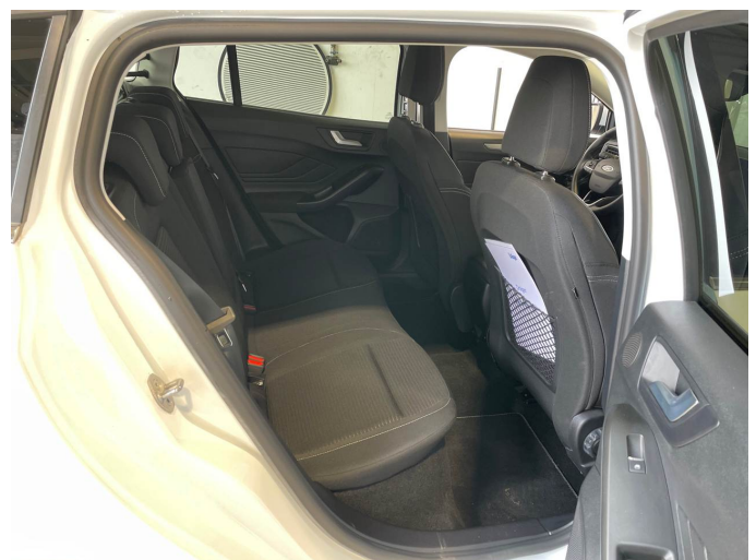
Figure 6: Interior - rear