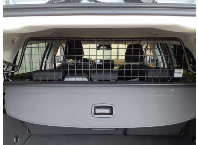
Figure 32: Misc.