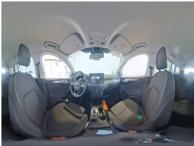
Figure 9: Interior 360° view