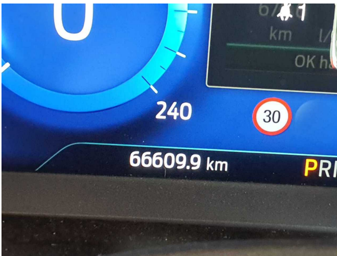
Figure 21: Misc.