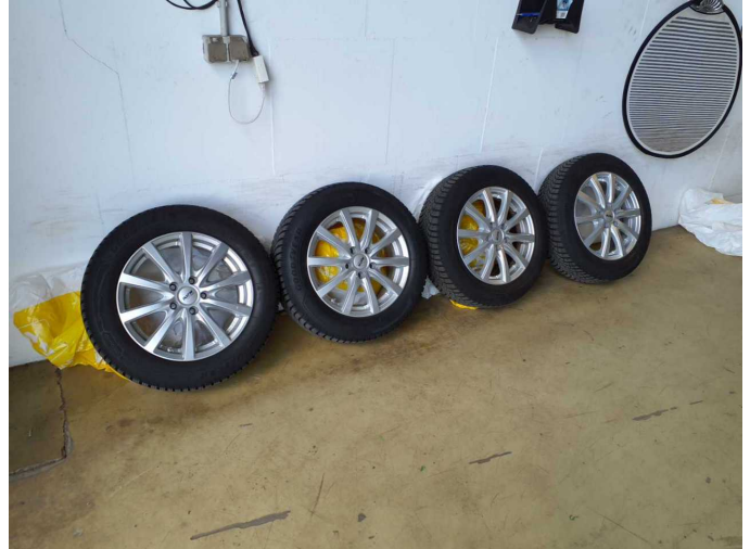
Figure 14: Additional tyres