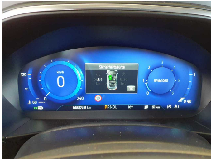
Figure 7: Instrument cluster