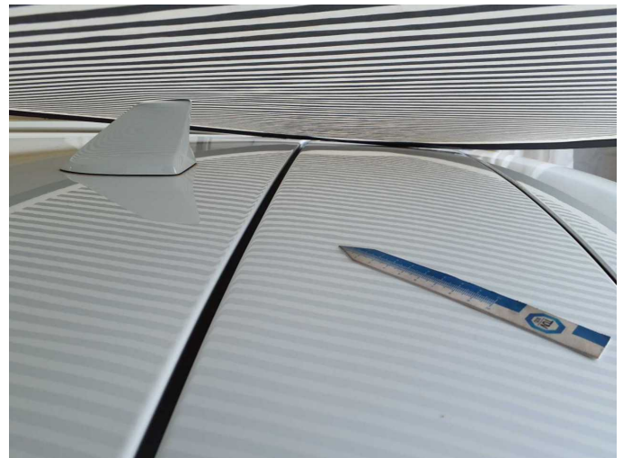
Damage 1: Boot lid / rear door: Boot lid - dent(s) - Smooth repair work