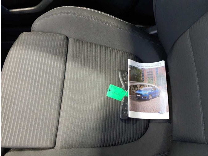
Figure 13: Documents