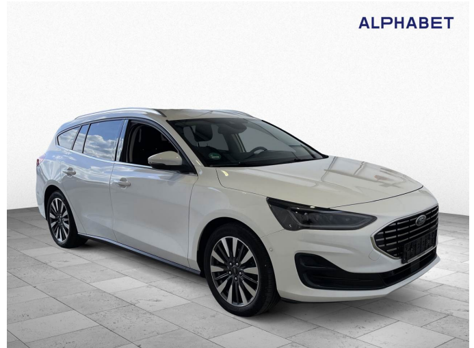
Figure 2: Diagonal front (right)