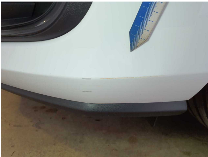
Damage 3: Front bumper: Front bumper - Scratch(es) - Paint