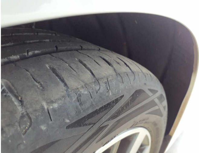
Damage 2: Wheel / tyres: Tyre - front (einseitig abgefahren) - Does not meet the leasing specifications - Replace