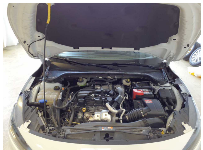
Figure 24: Misc.