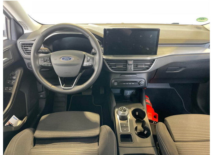
Figure 8: Instrument panel