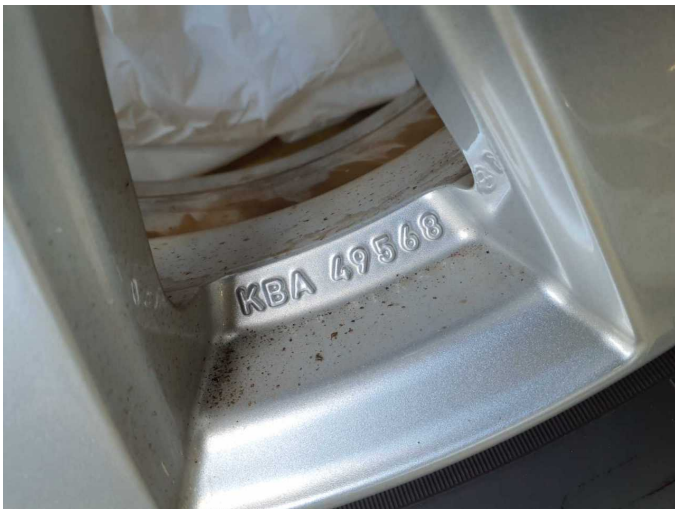
Figure 15: Additional tyres