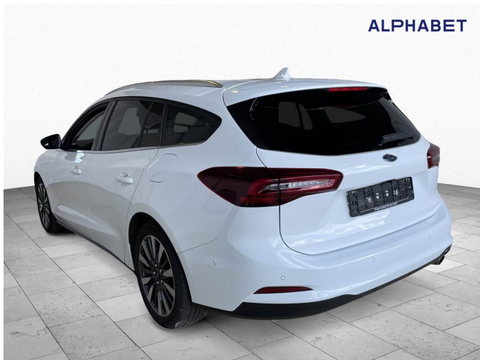
Figure 3: Diagonal rear (left)