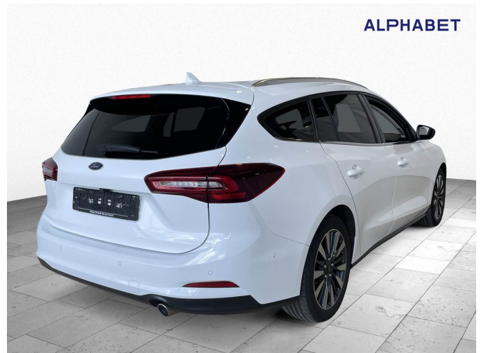
Figure 4: Diagonal rear (right)