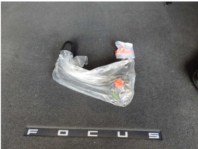
Figure 27: Misc.