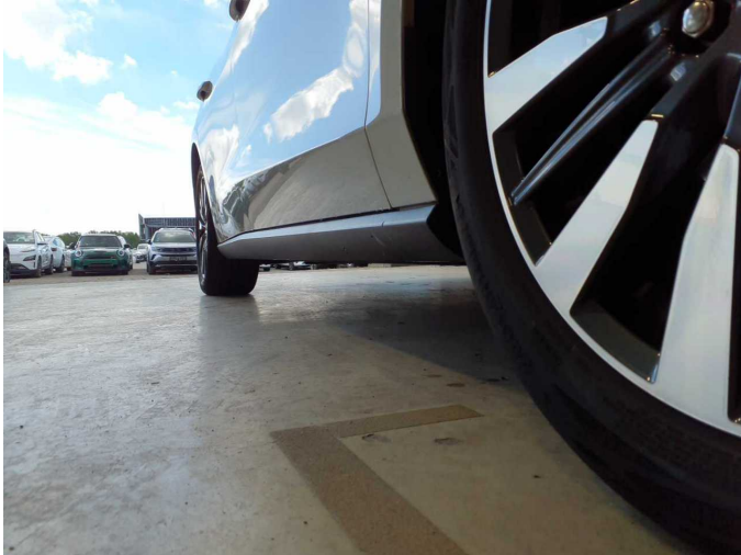
Figure 25: Misc.