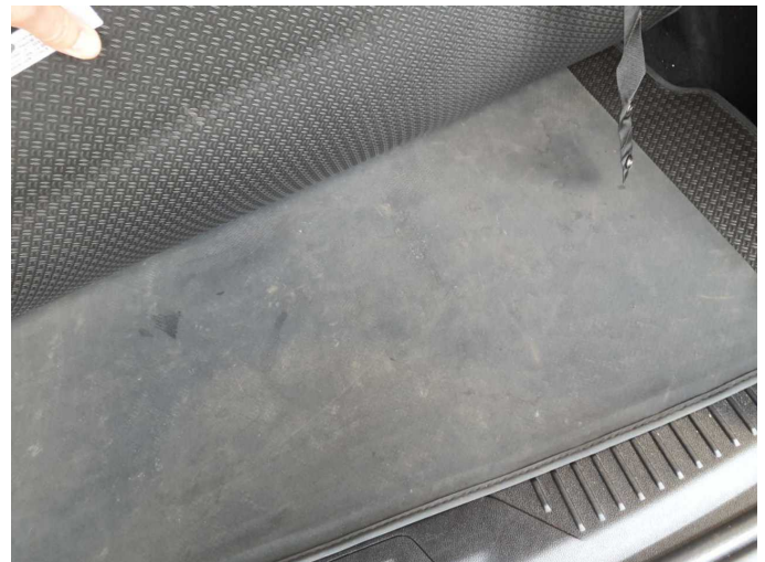
Figure 28: Misc.