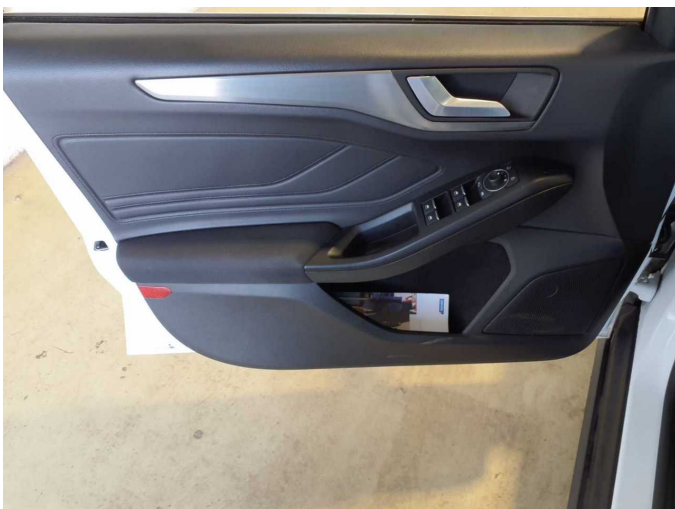
Figure 17: Misc.