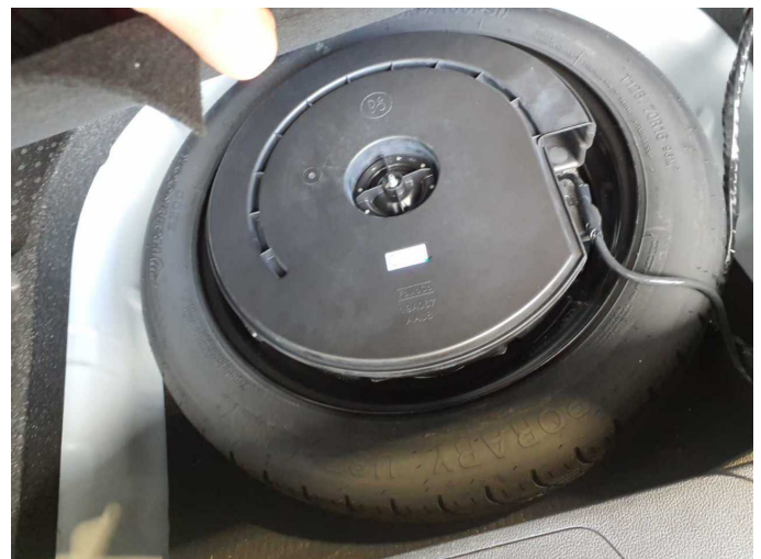
Figure 30: Misc.