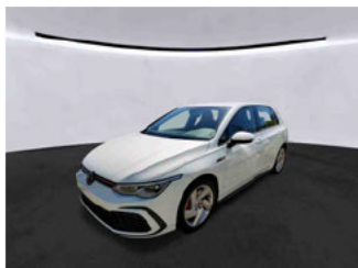
Front Left 3/4