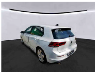
Rear Left 3/4