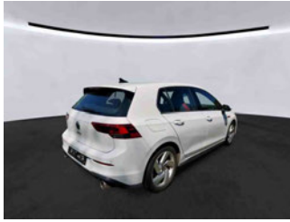
Rear Right 3/4