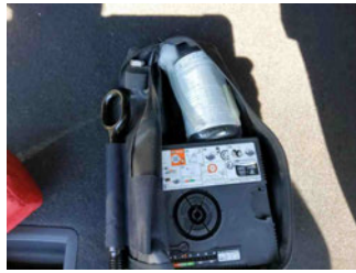
Tirefit expiration date