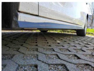
Sill outer L