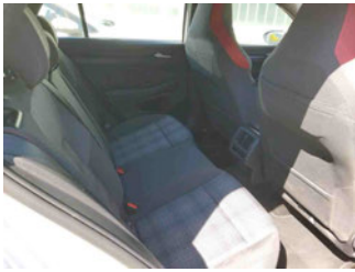
Interior - rear