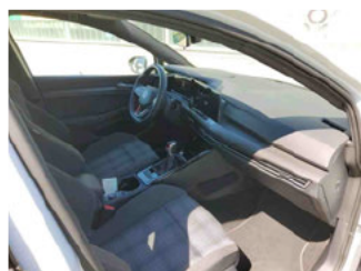
Interior - front