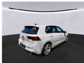
Rear Right 3/4