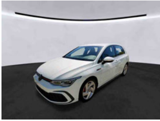
Front Left 3/4

Order number: 1002407471 Order completed: 17.04.2026 13:06 Report number: 10445740 VIN: WVVZZZCD0RW177366