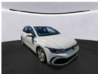
Front Right 3/4