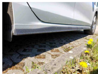
Sill outer R