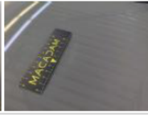
Wheel arch cover RR, Scratch(es), Replace