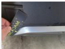
Bumper corner RR, Scratch(es), Repair and paint (complete)