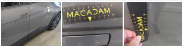
Wing RL, Scratch(es), Repair and paint (complete)