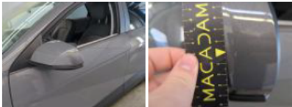
Door FL, Scratch(es), Repair and paint (complete)