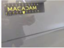
Bumper moulding RL, Scratch(es), Replace and paint