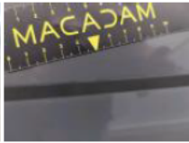
Windscreen, Stone chip(s), Windscreen repair