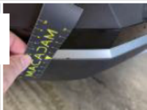
Bumper moulding R, Scratch(es), Replace and paint