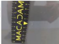
Outside rear-view mirror housing R, Scratch(es), Replace and paint