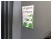
Outside rear-view mirror housing L, Scratch(es), Replace and paint