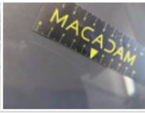
Door RL, Scratch(es), Repair and paint (complete)