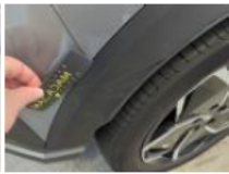
Door RR, Scratch(es), Repair and paint (complete)