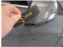
Door FR, Scratch(es), Repair and paint (complete)