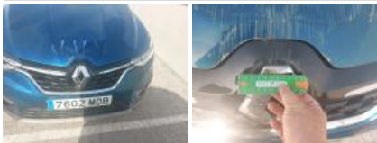
Bumper trim F, Scratch(es), Replace