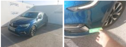
Bonnet, Dent(s), Repair and paint (complete)