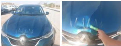
Bumper moulding FM, Scratch(es), Repair and paint (complete)