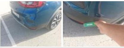
Spoiler R, Scratch(es), Paint