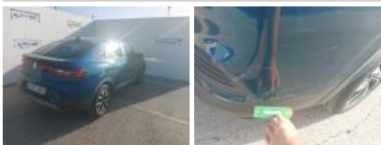
Bumper moulding RM, Scratch(es), Repair and paint (complete)