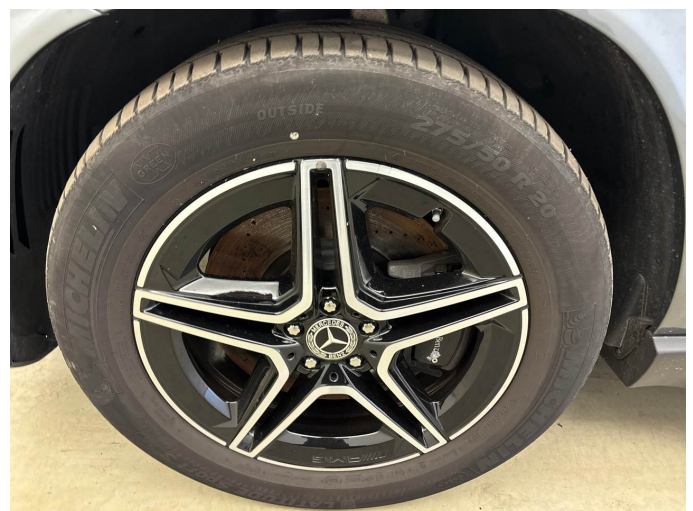
Figure 12: Mounted tyres