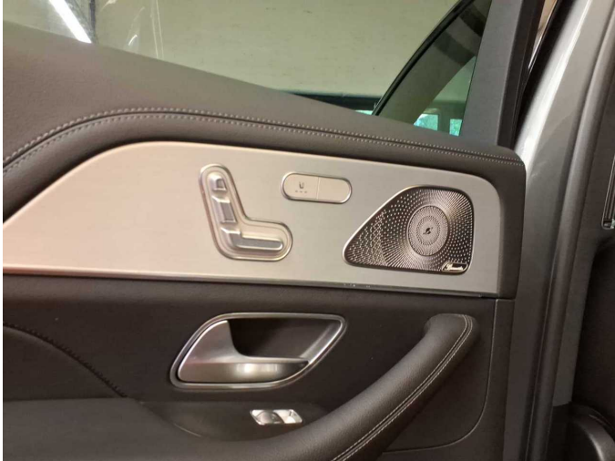
Figure 25: Misc.