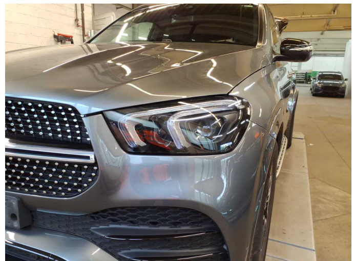
Figure 18: Misc.