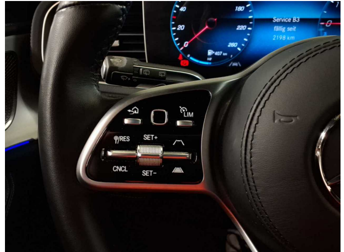
Figure 32: Misc.