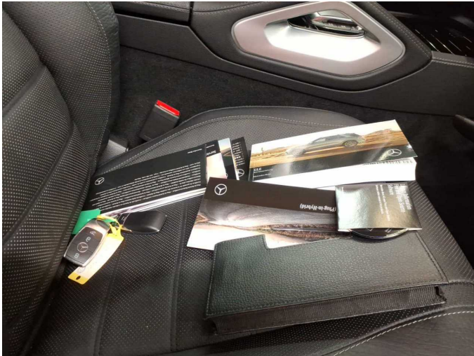
Figure 13: Documents