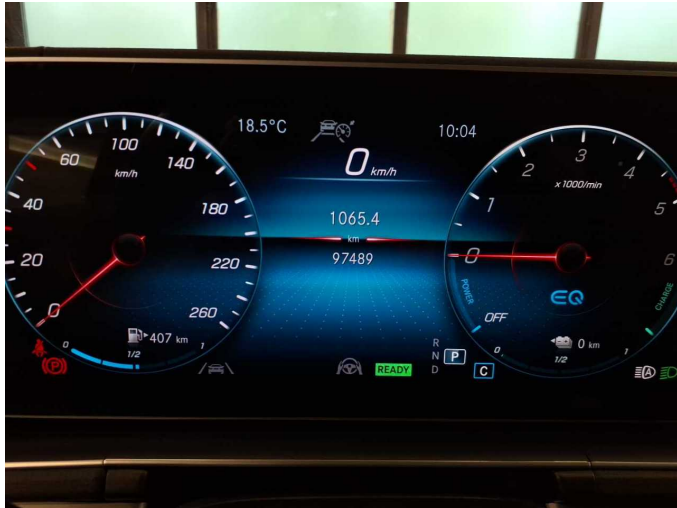
Figure 7: Instrument cluster