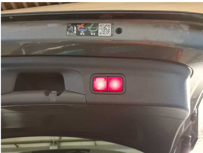
Figure 23: Misc.