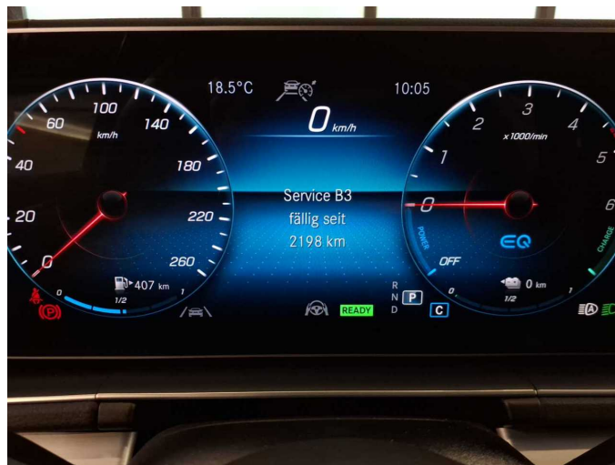
Damage 2: Misc.: Inspection / maintenance - Due - Perform