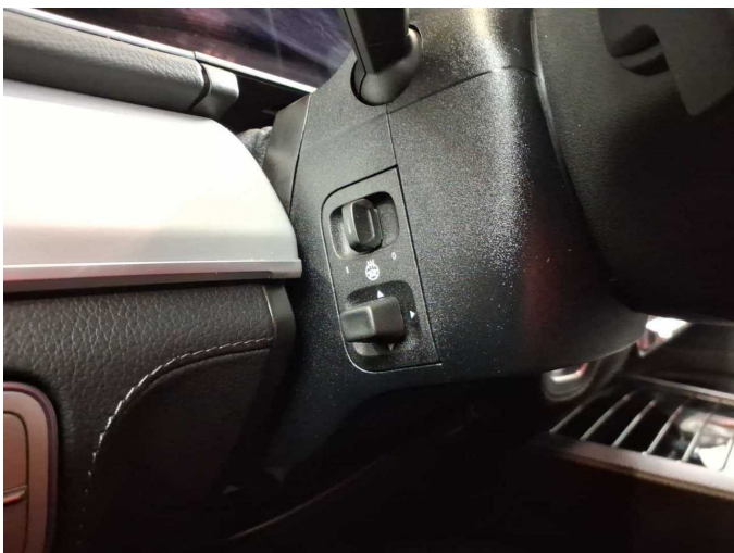
Figure 29: Misc.