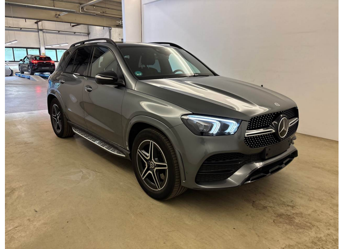
Figure 2: Diagonal front (right)