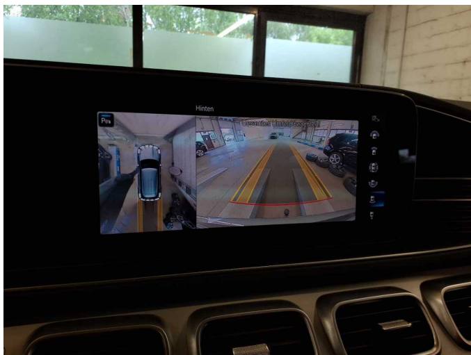
Figure 33: Misc.