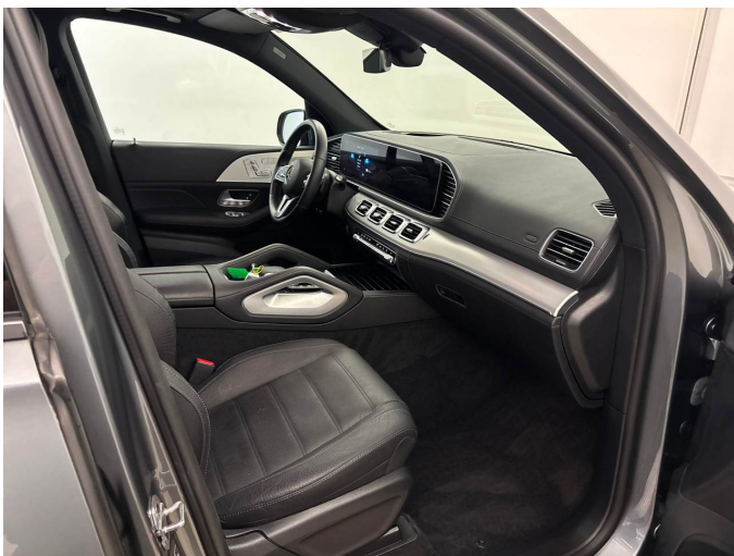
Figure 5: Interior - front