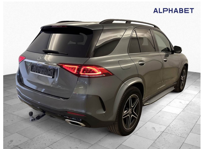
Figure 4: Diagonal rear (right)