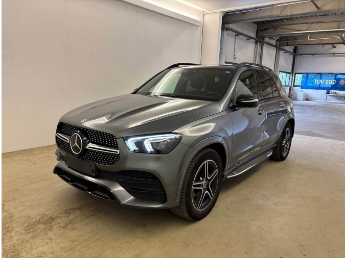
Figure 1: Diagonal front (left)