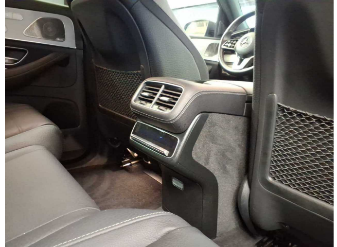
Figure 20: Misc.