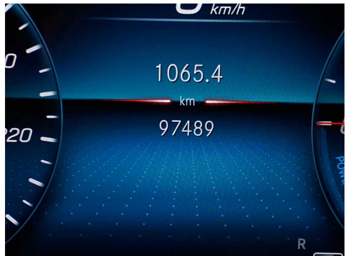
Figure 30: Misc.