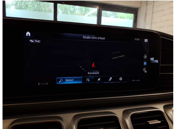
Figure 14: Navigation