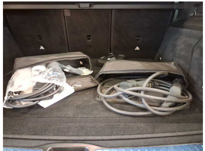
Figure 22: Misc.