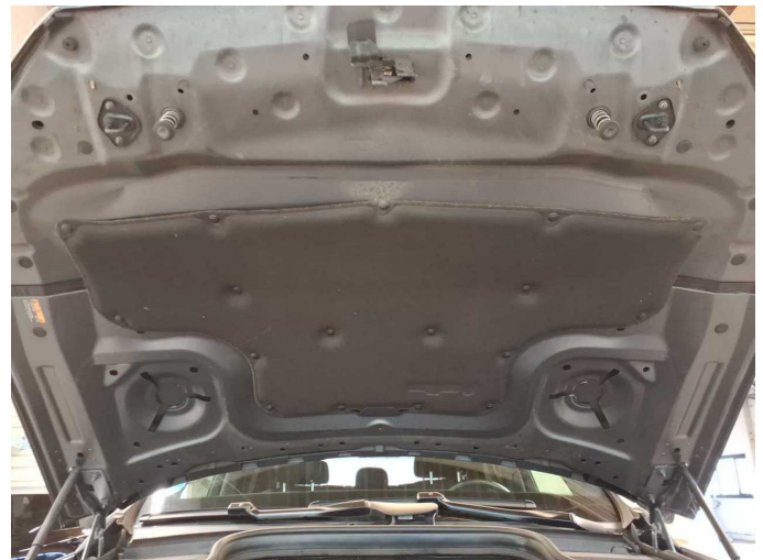
Figure 16: Misc.