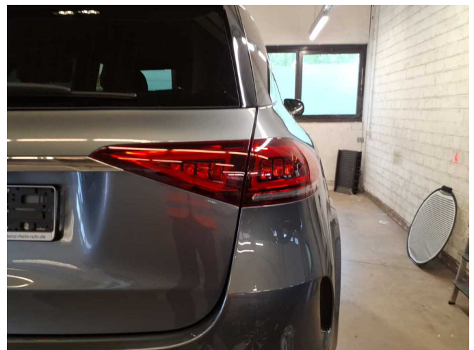
Figure 24: Misc.