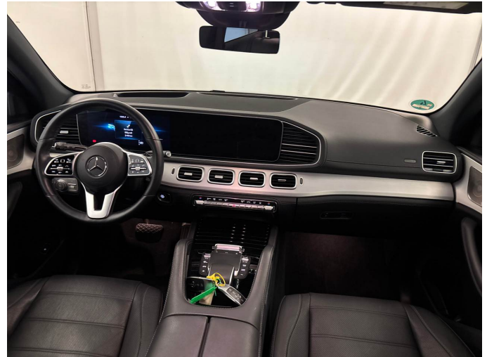
Figure 8: Instrument panel