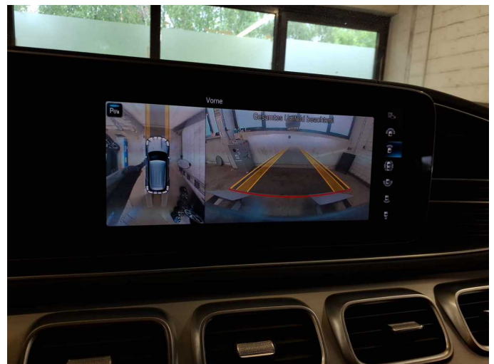
Figure 34: Misc.