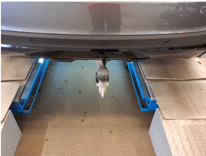
Figure 21: Misc.