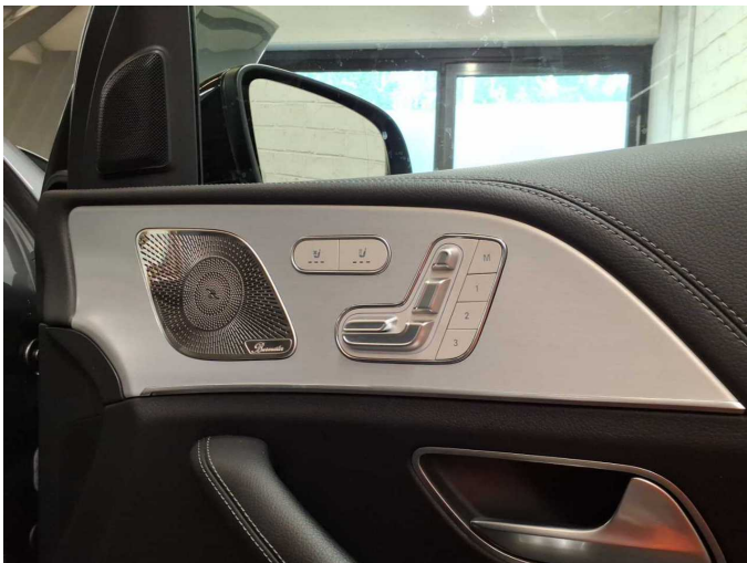
Figure 15: Misc.