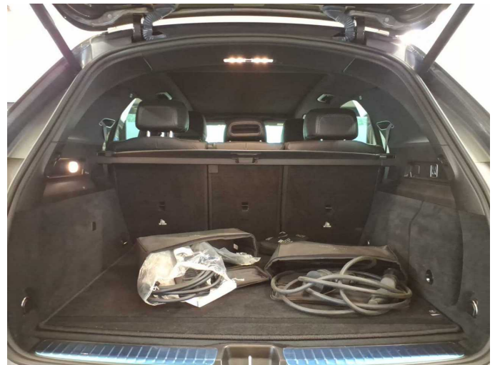
Figure 10: Cargo area