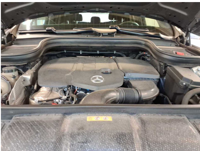
Figure 17: Misc.