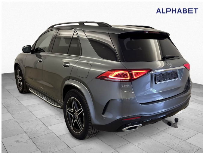
Figure 3: Diagonal rear (left)