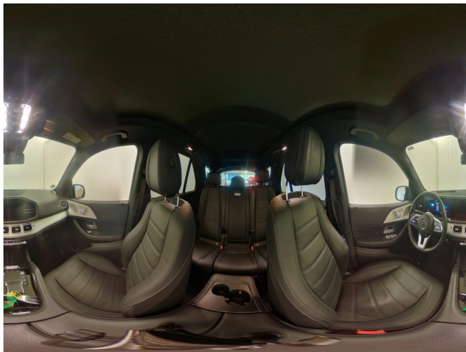
Figure 9: Interior 360° view