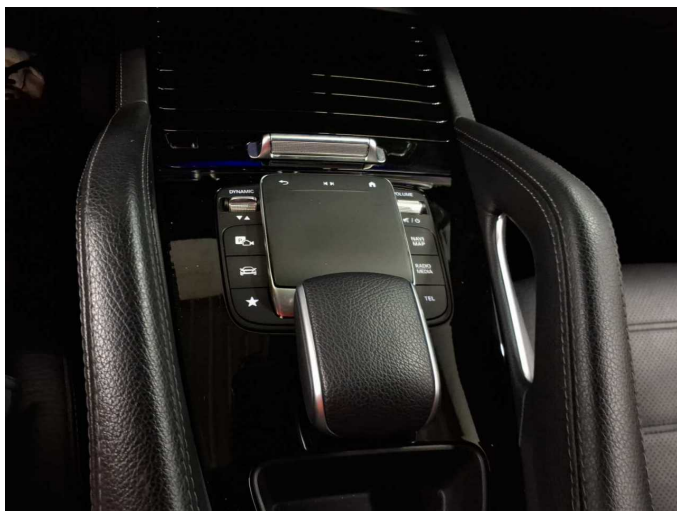
Figure 35: Misc.