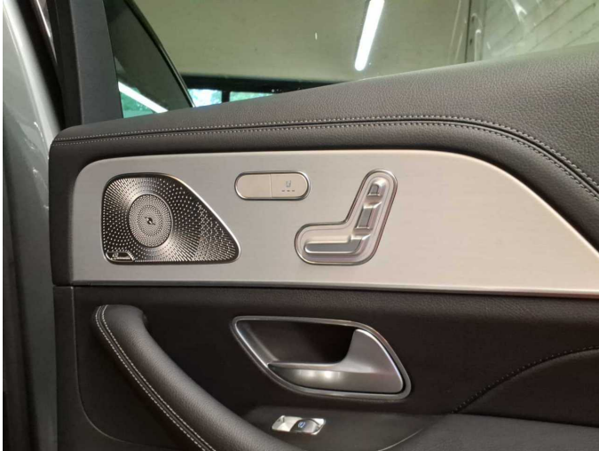
Figure 19: Misc.