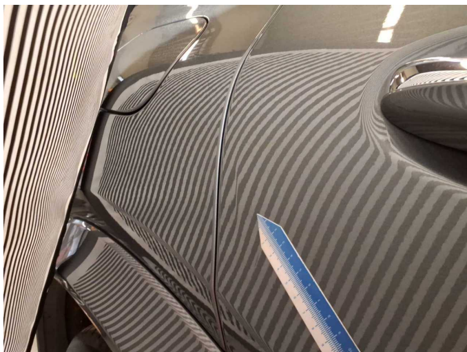
Damage 1: Door - rear right side: Door - dent(s) - Smooth repair work