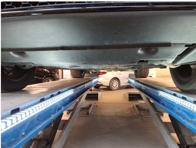
Figure 27: Misc.