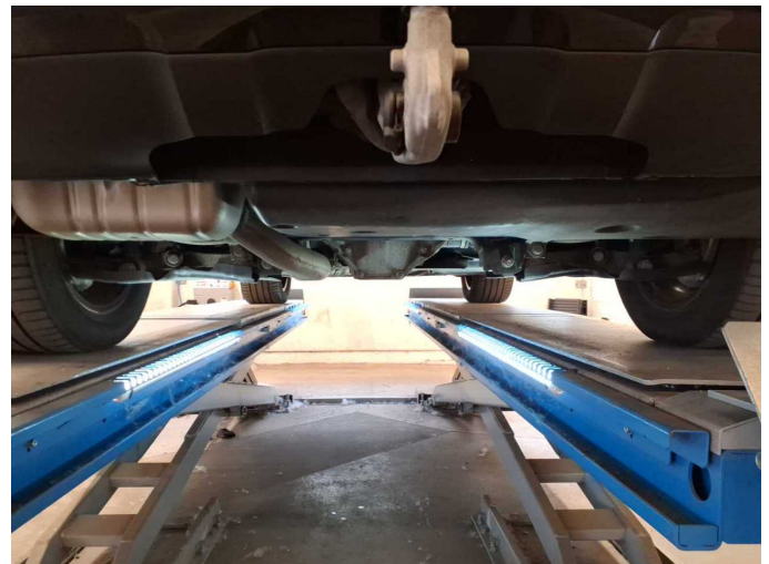
Figure 28: Misc.