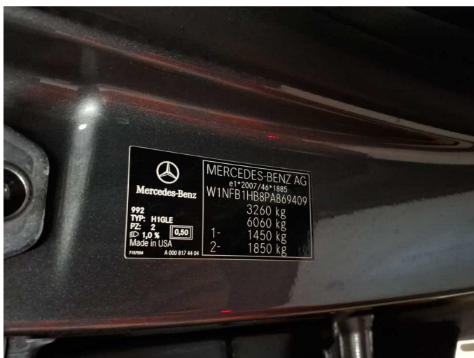
Figure 11: VIN