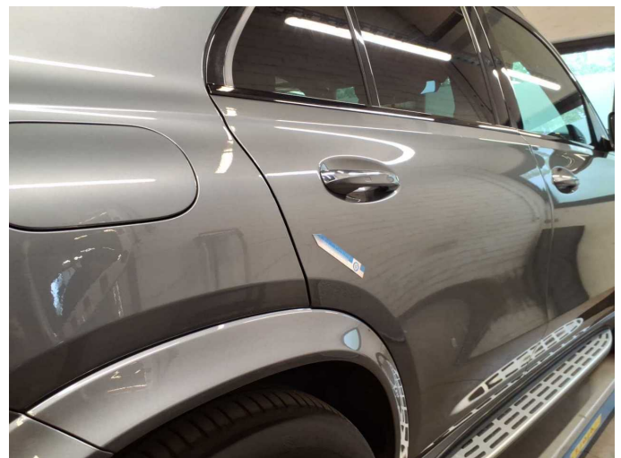
Damage 1: Door - rear right side: Door - dent(s) - Smooth repair work