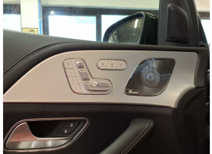
Figure 26: Misc.