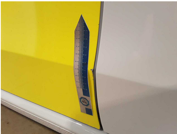
Damage 3: Door - front left side: Door edge - Scratch(es) - Smart repair