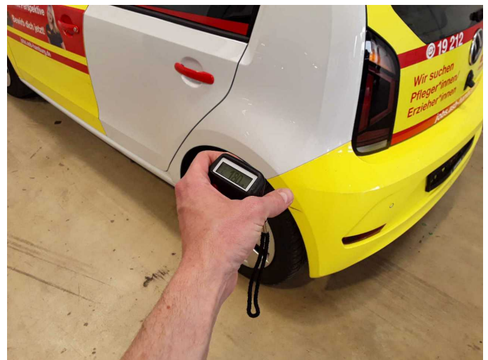
Repainting 1: Side panel - rear left side