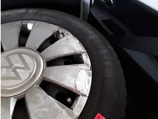
Damage 1: 2nd wheel set: 1 wheel cover - Scratch(es) - Replace