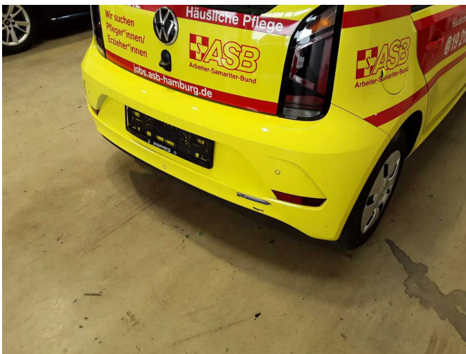
Damage 6: Rear bumper: Rear bumper - Dent / paintcoat damage - Repair and paint