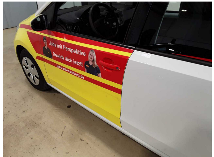
Damage 3: Door - front left side: Door edge - Scratch(es) - Smart repair