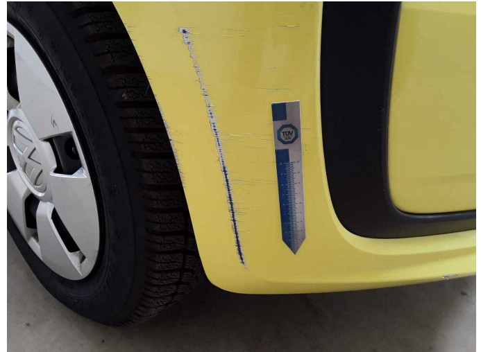
Damage 5: Front bumper: Front bumper - Scratch(es) - Paint