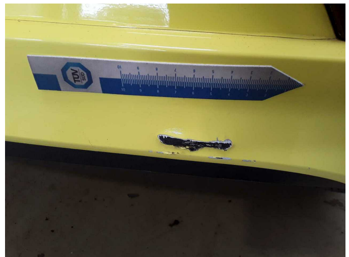
Damage 6: Rear bumper: Rear bumper - Dent / paintcoat damage - Repair and paint