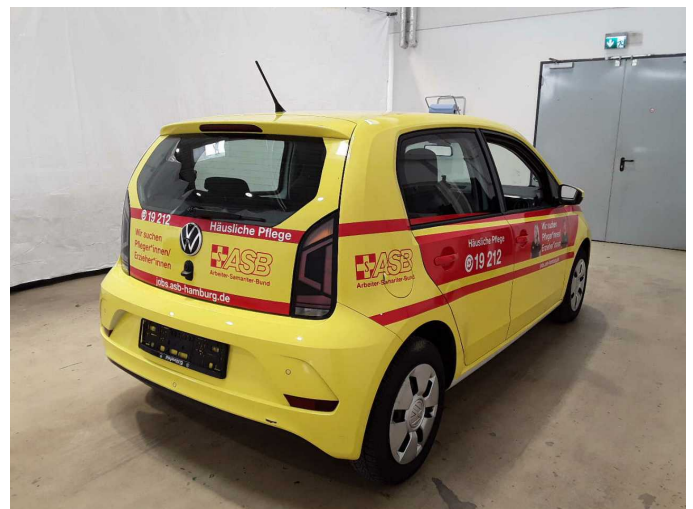
Damage 4: Body: Body - Glued / labelled - De-glude / neutralise