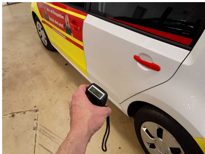
Repainting 1: Side panel - rear left side