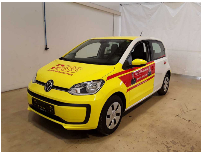
Damage 4: Body: Body - Glued / labelled - De-glude / neutralise