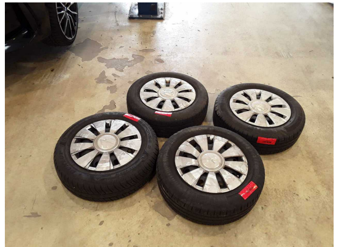
Figure 16: Additional tyres