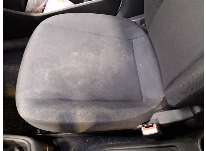
Damage 2: Seat - front: Seat cover - right side - Soiled - Clean