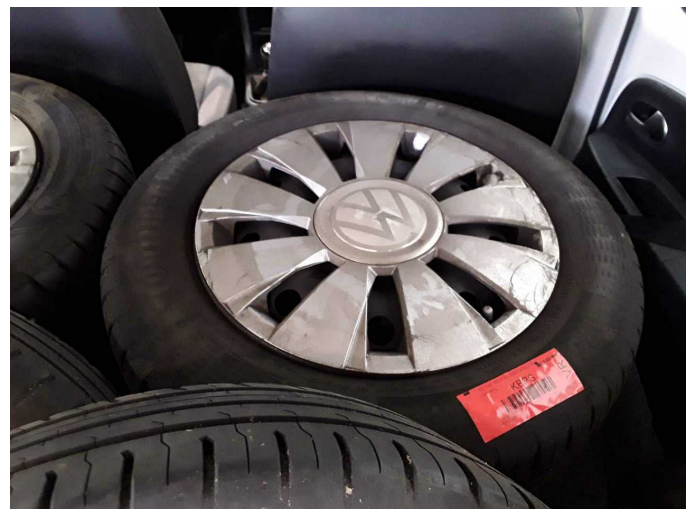
Damage 1: 2nd wheel set: 1 wheel cover - Scratch(es) - Replace