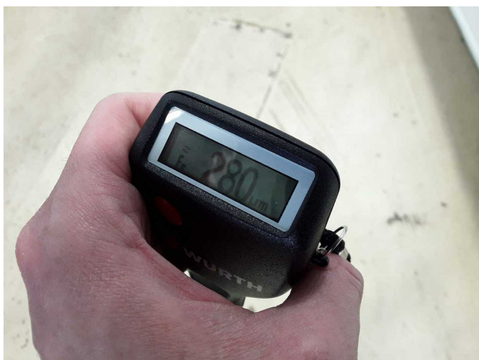
Repainting 1: Side panel - rear left side