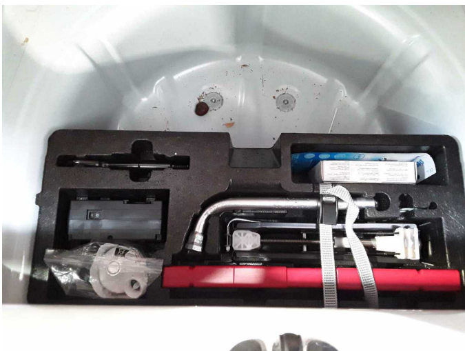
Figure 23: Misc.