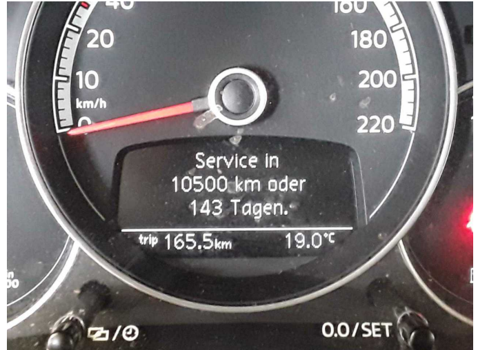
Figure 14: Documents