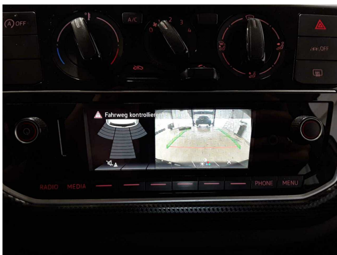
Figure 17: Misc.