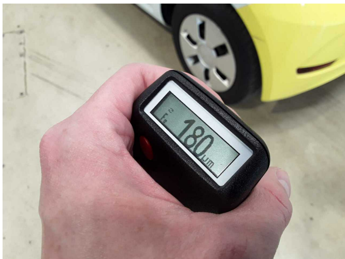
Repainting 1: Side panel - rear left side