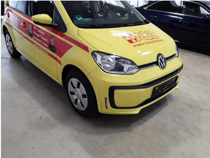
Damage 5: Front bumper: Front bumper - Scratch(es) - Paint