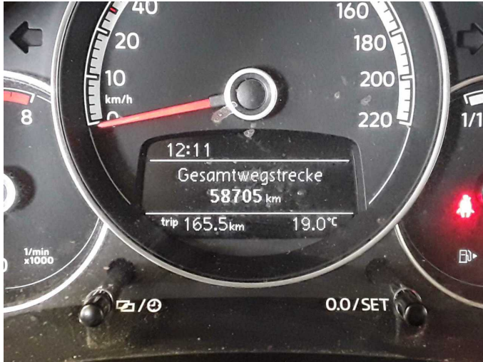
Figure 13: Documents