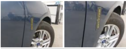
Door FR, Dent(s) and scratch(es), Repair and paint (complete)