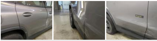
Door trim RR, Scratch(es), Replace