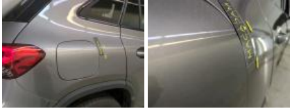
Door FR, Deformed / Strained, Replace and paint