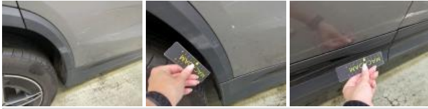
Wing RR, Dent(s), Paintless dent repair