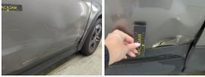
Door trim FR, Scratch(es), Replace