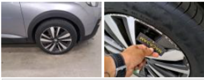
Door RR, Repaired, Acceptable