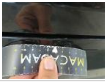
Bumper corner RL, Scratch(es), Polish