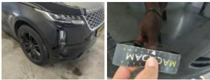
Wing RR, Scratch(es), Repair and paint (complete)