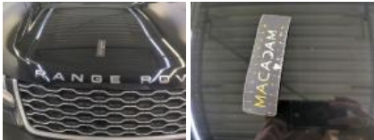
Bumper F, Scratch(es), Repair and paint (complete)