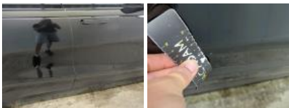
Tailgate / Boot, Scratch(es), Repair and paint (complete)