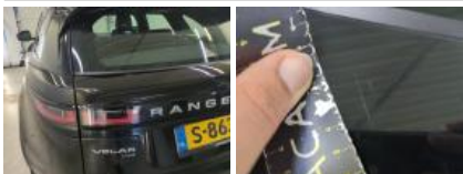
Shutter / cover R, Scratch(es), Replace