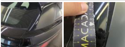
Bumper R, Scratch(es), Repair and paint (complete)