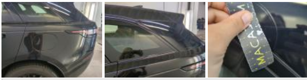
Side window trim FL, Scratch(es), Polish