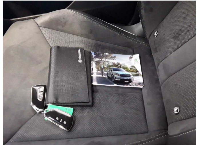
Figure 14: Documents