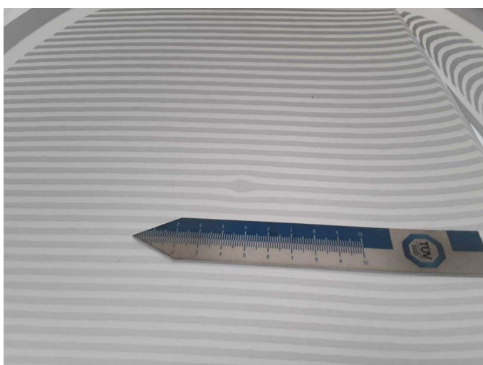
Damage 1: Bonnet: Bonnet - dent(s) - Smooth repair work