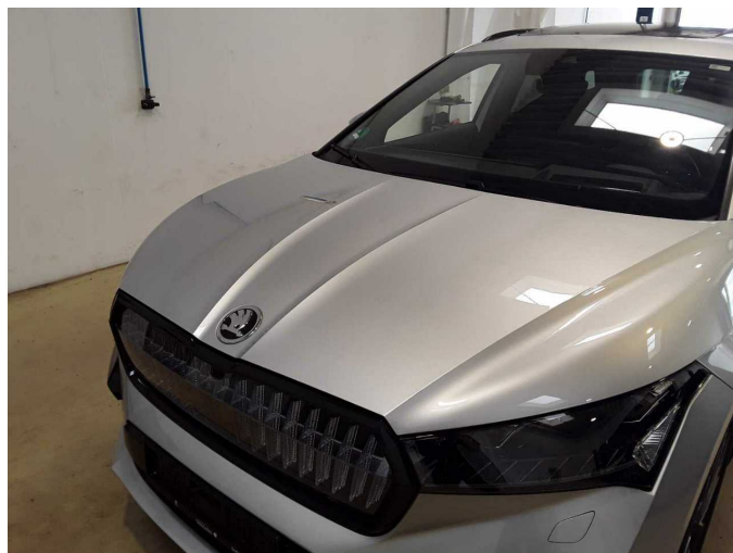
Damage 1: Bonnet: Bonnet - dent(s) - Smooth repair work