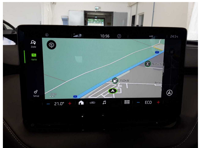
Figure 16: Navigation