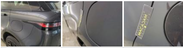
Door RR, Dent(s) and scratch(es), Repair and paint (complete)