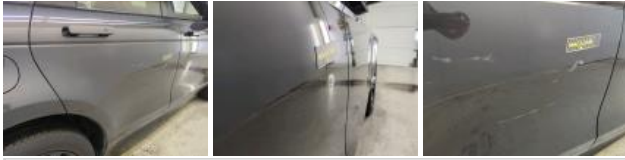
Bumper R, Scratch(es), Repair and paint (complete)