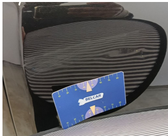
Wing Rear Right // Repair & Painting-scratch + dent