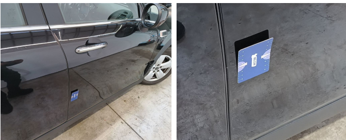
Door Front Right // Smart Repair Small-scratch