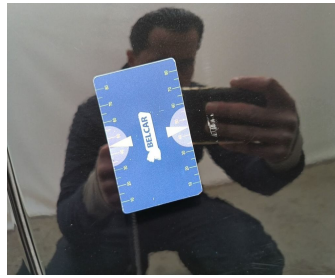
Door Rear Left // Polish-scratch