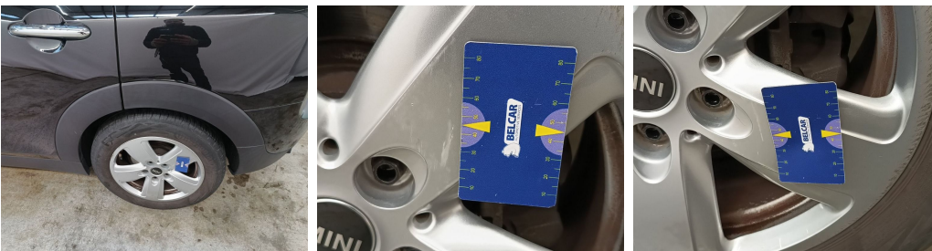
Wheel Alloy Rear Left // Repair-scratch