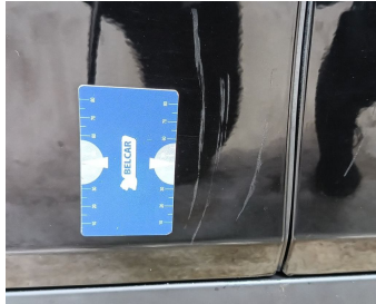
Door Front Left // Polish-scratch