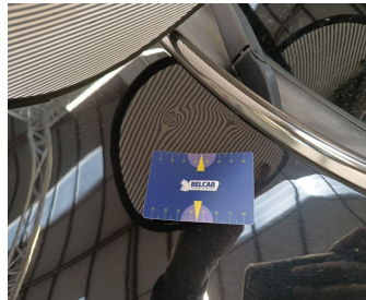
Front Bonnet // Repair & Painting-scratch + dent