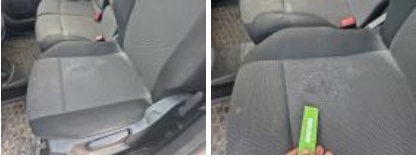
Interior, Dirty, Cleaning