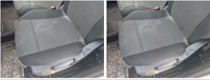
Seat cover FL, Worn, Replace