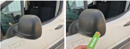
Wing FL, Scratch(es), Acceptable