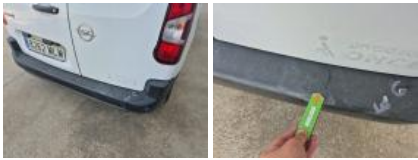
Boot door panel RL, Scratch(es), Acceptable