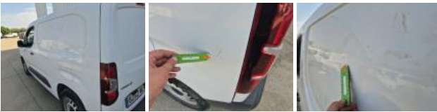
Door FL, Scratch(es), Acceptable