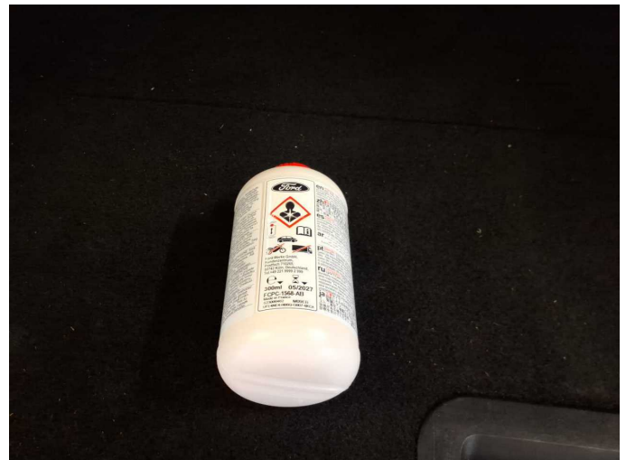
Figure 22: Misc.