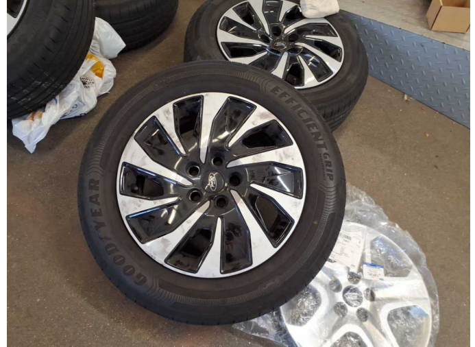
Figure 20: Misc.