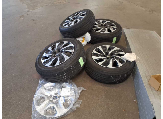
Figure 14: Additional tyres