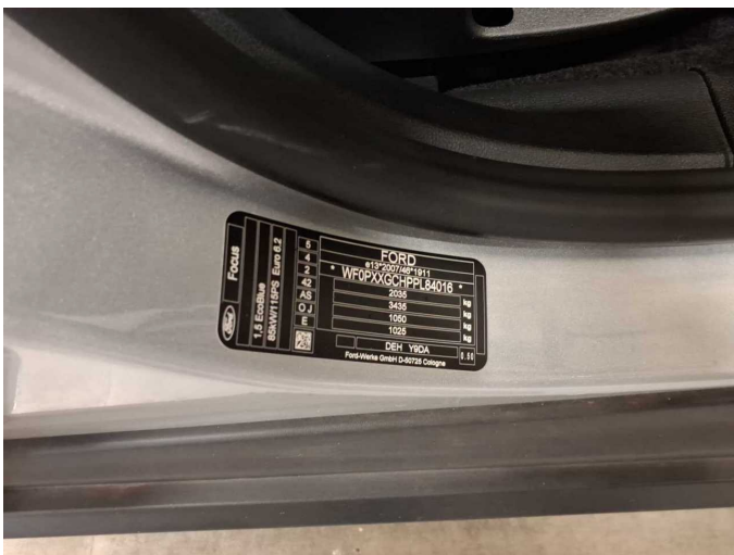
Figure 11: VIN