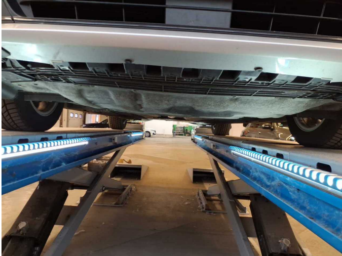
Figure 25: Misc.