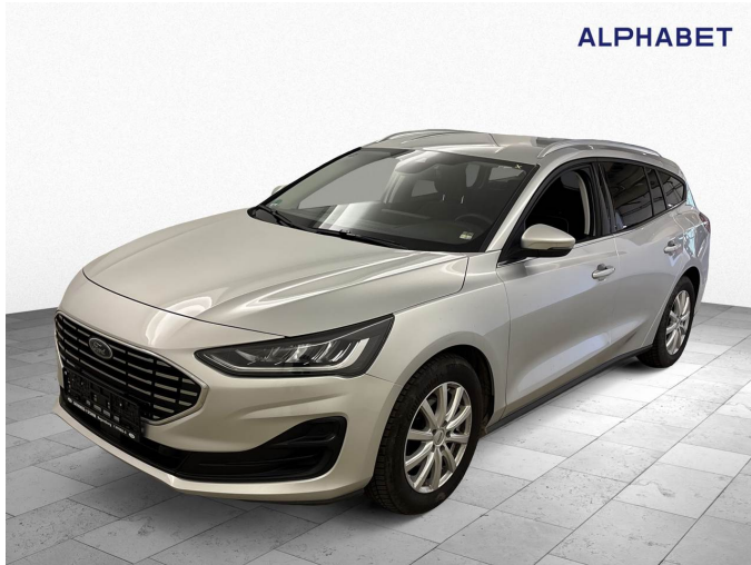
Figure 1: Diagonal front (left)