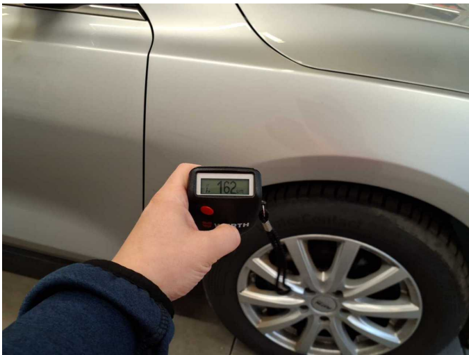
Repainting 1: Mudguard - right side