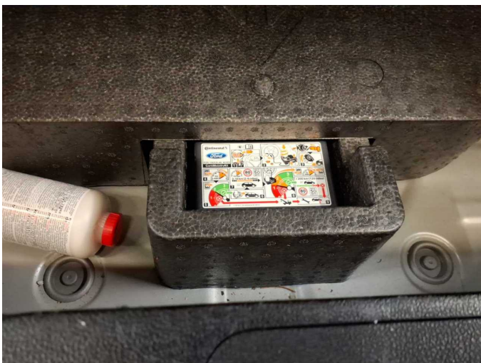
Figure 23: Misc.