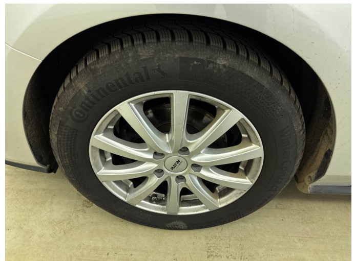
Figure 12: Mounted tyres