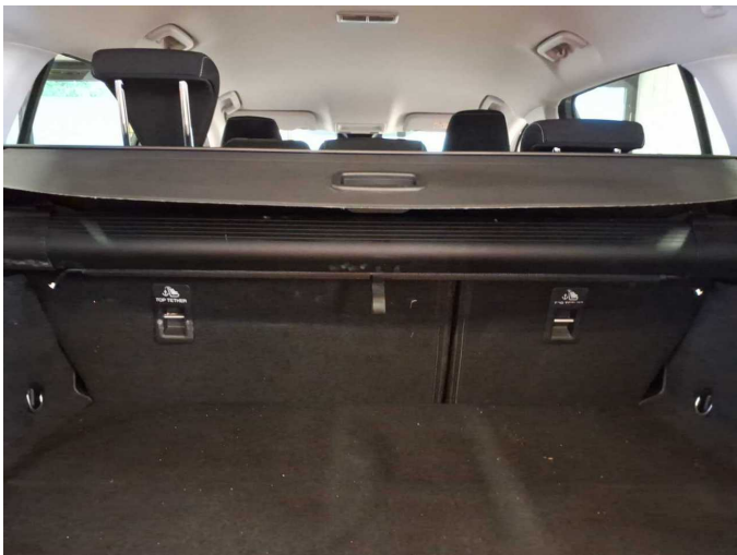
Figure 21: Misc.