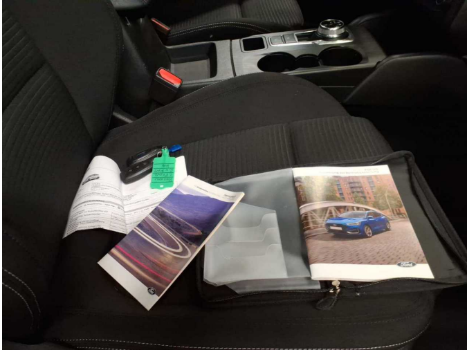
Figure 13: Documents