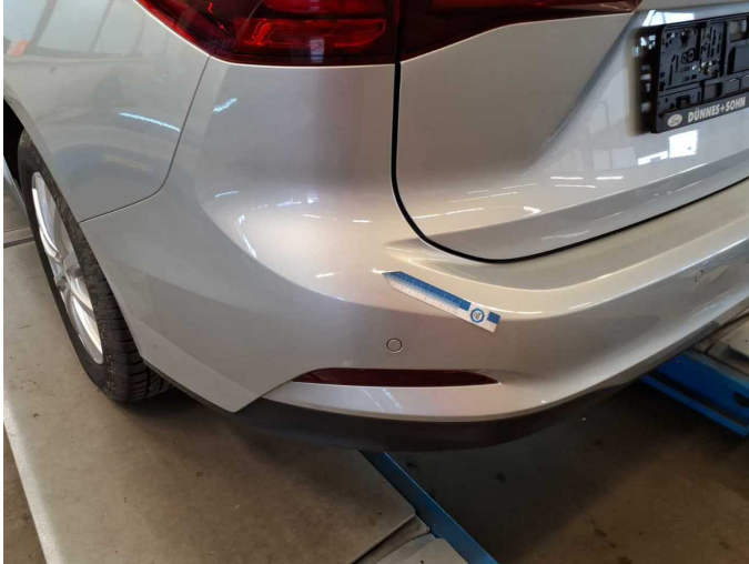
Damage 2: Rear bumper: Rear bumper - Scratch(es) - Paint