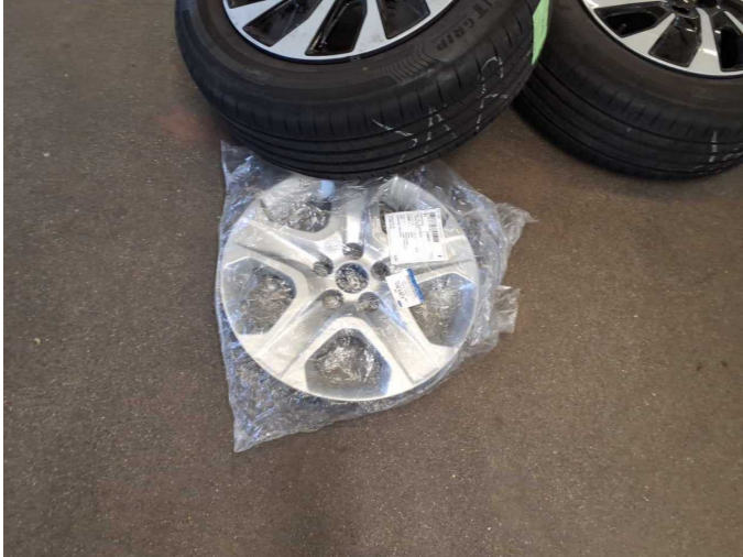
Figure 19: Misc.