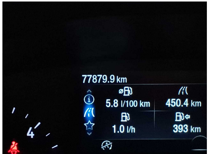
Figure 28: Misc.