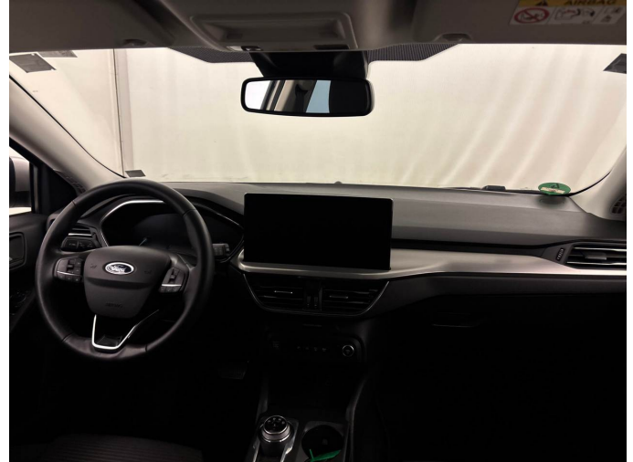
Figure 8: Instrument panel