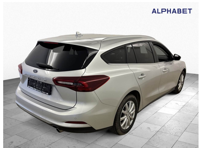
Figure 4: Diagonal rear (right)