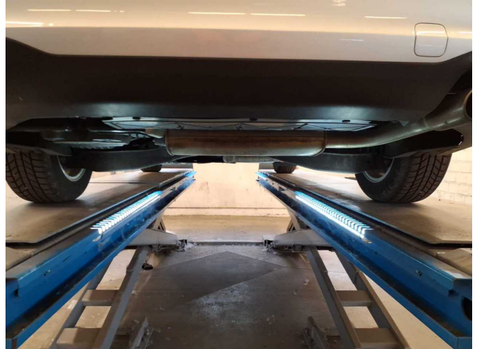
Figure 26: Misc.