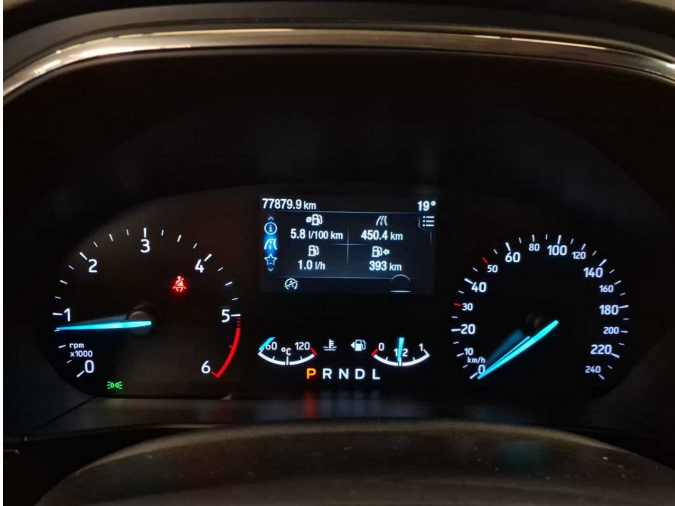
Figure 7: Instrument cluster