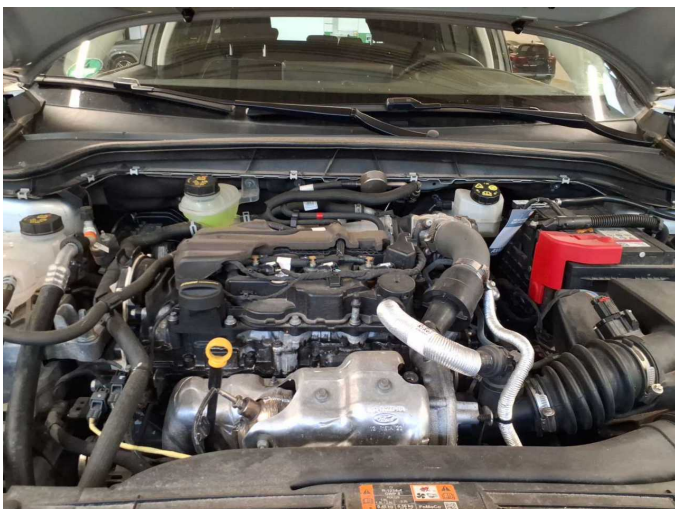
Figure 17: Misc.