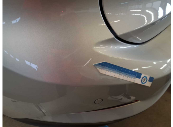
Damage 2: Rear bumper: Rear bumper - Scratch(es) - Paint