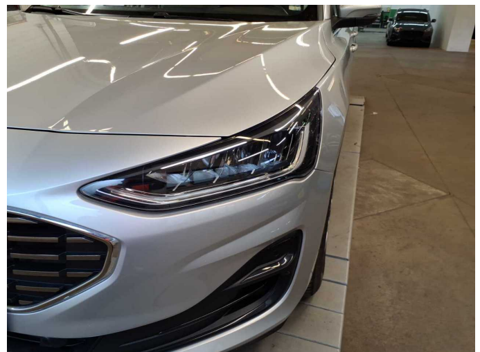
Figure 18: Misc.