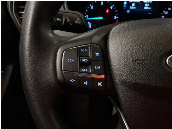
Figure 27: Misc.