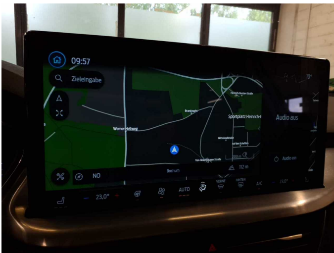
Figure 15: Navigation