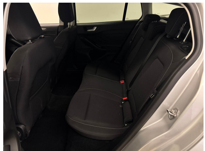
Figure 6: Interior - rear