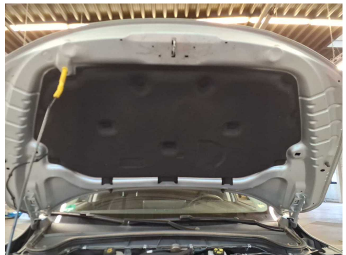
Figure 16: Misc.