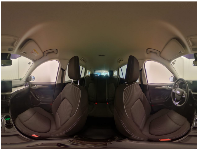
Figure 9: Interior 360° view