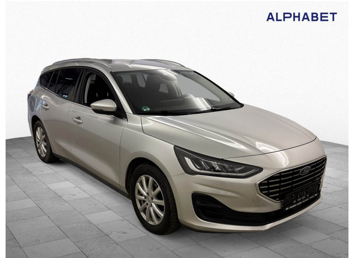
Figure 2: Diagonal front (right)