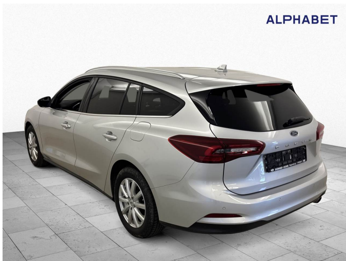
Figure 3: Diagonal rear (left)