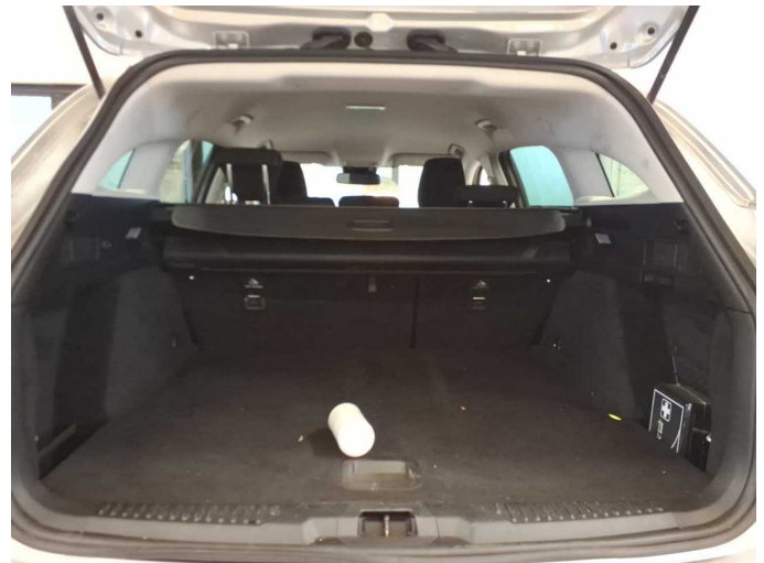
Figure 10: Cargo area