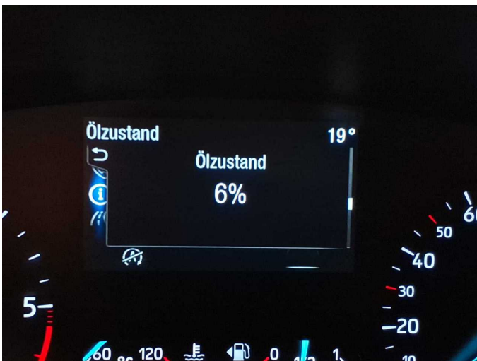
Figure 29: Misc.