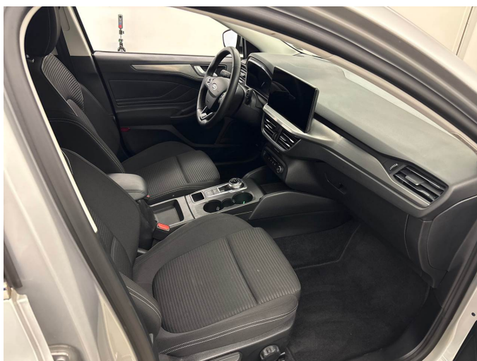
Figure 5: Interior - front