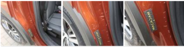
Door RR, Scratch(es), Acceptable