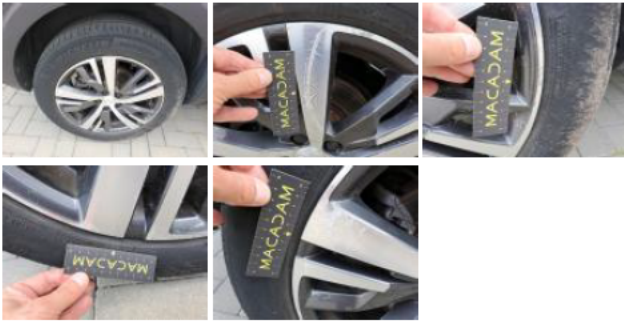
Alloy rim FR polished, Scratch(es), Repair and paint (complete)