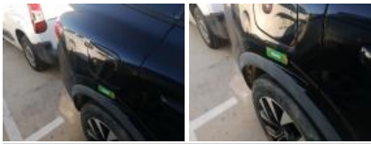
Fender moulding RR, Scratch(es), Repair and paint (complete)