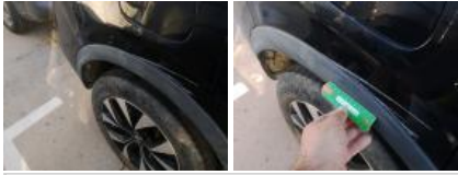
Bumper corner RR, Scratch(es), Repair and paint (complete)