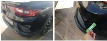
Bumper R, Dent(s) and scratch(es), Repair and paint (complete)