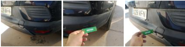
Spoiler R, Scratch(es), Repair and paint (complete)