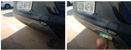
Bumper corner RL, Scratch(es), Repair and paint (complete)