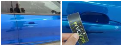
Wing FR, Stone chip(s), Repair and paint (complete)