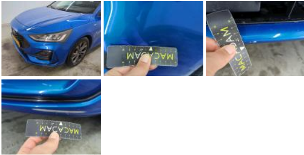
Wing RR, Scratch(es), Repair and paint (complete)