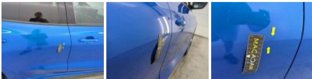
Outer door handle FR, Scratch(es), Repair and paint (complete)