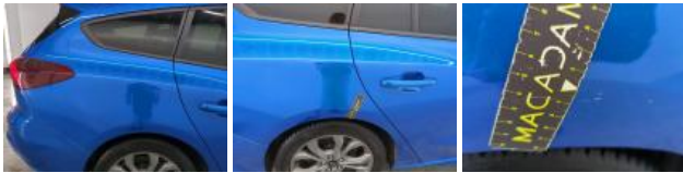
Door RR, Dent(s), Repair and paint (complete)