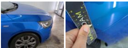
Bumper R, Scratch(es), Repair and paint (partial)