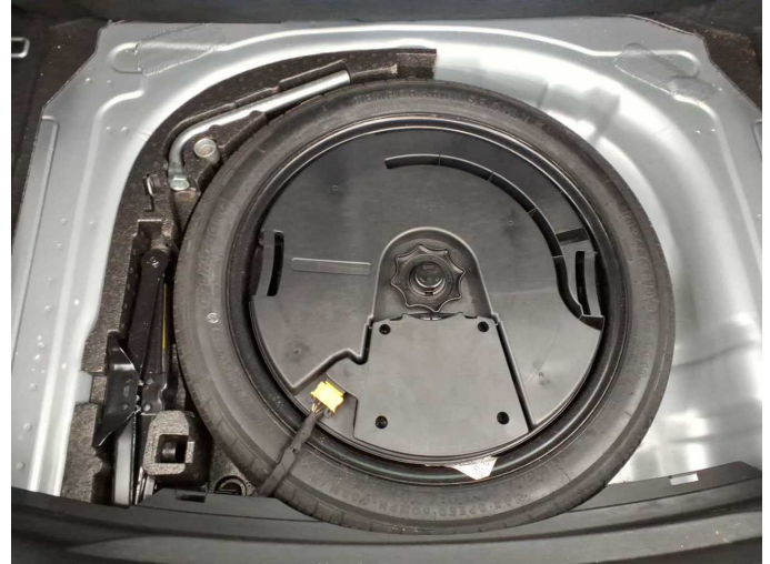
Figure 26: Misc.