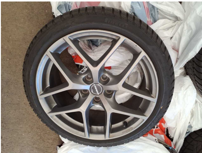
Figure 27: Misc.