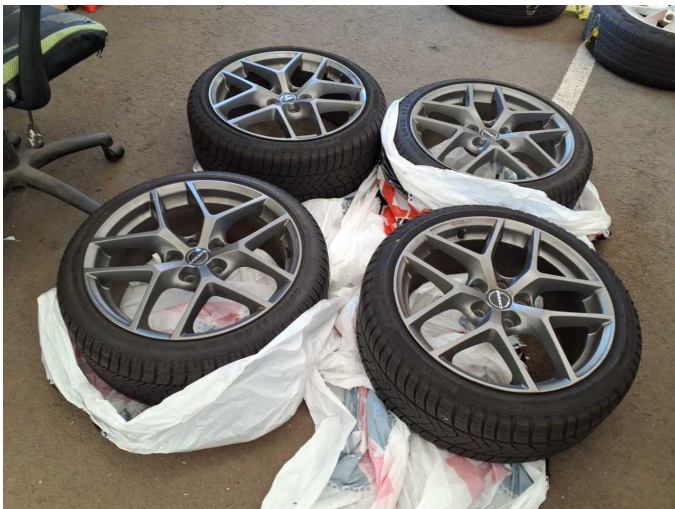
Figure 17: Additional tyres