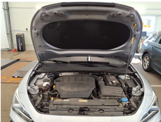
Figure 23: Misc.