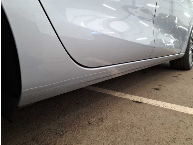
Figure 25: Misc.