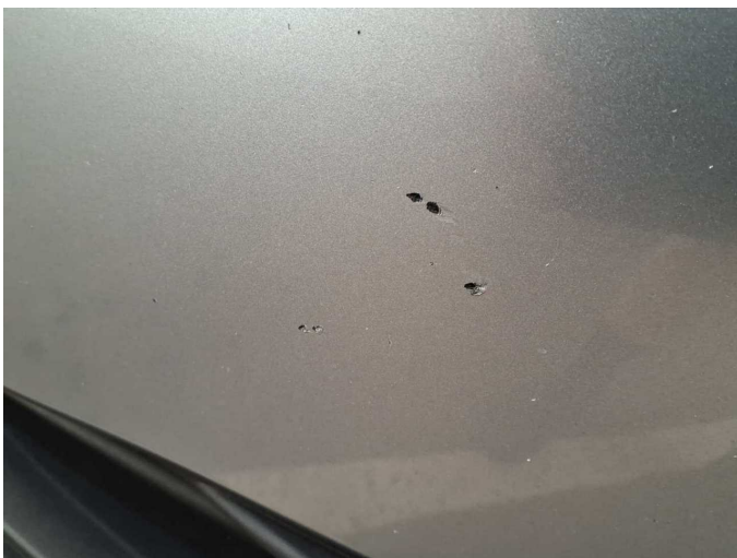
Damage 1: Front bumper: Front bumper - Scratched - Paint