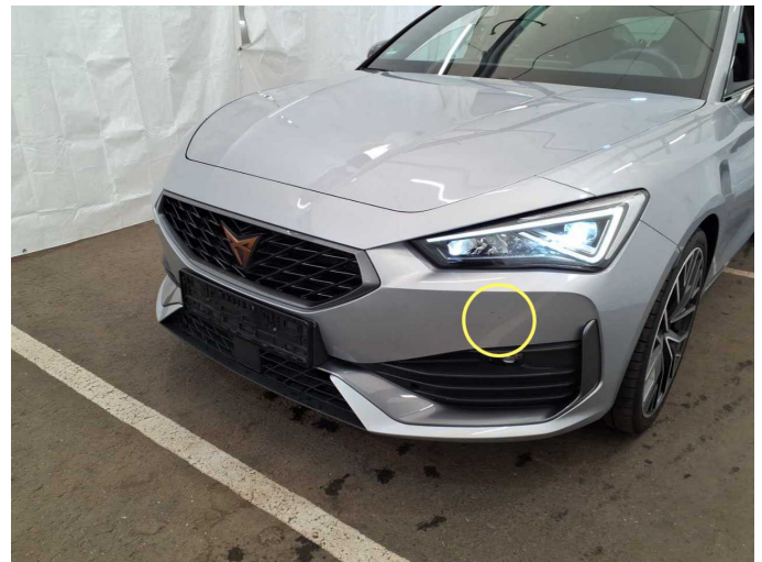
Damage 1: Front bumper: Front bumper - Scratched - Paint