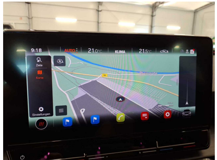
Figure 18: Navigation