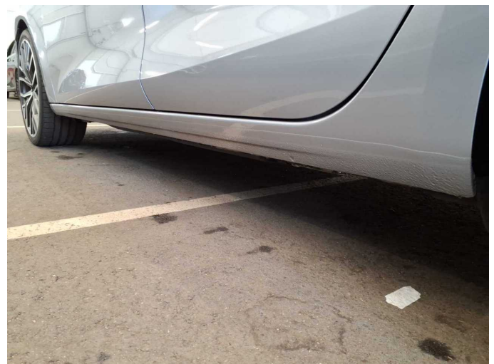
Figure 24: Misc.