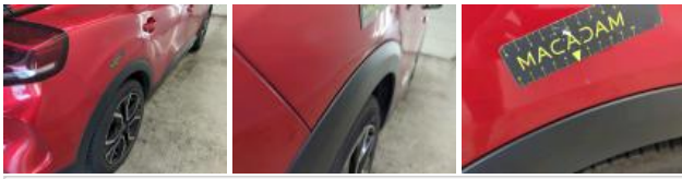
Door RR, Scratch(es), Repair and paint (complete)