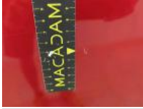
Outer door handle FR, Scratch(es), Repair and paint (complete)