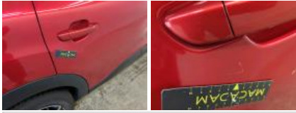
Door FR, Dent(s) and scratch(es), Repair and paint (complete)