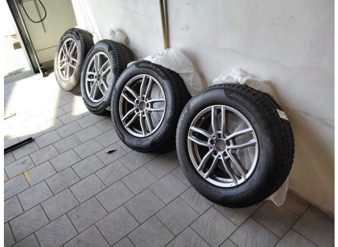
Figure 14: Additional tyres