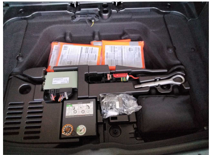
Figure 28: Misc.