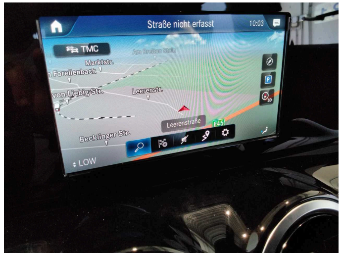
Figure 16: Navigation