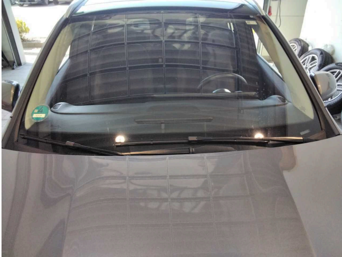
Wear and tear 1: Vehicle glazing: Windscreen - Stone chips - No deduction