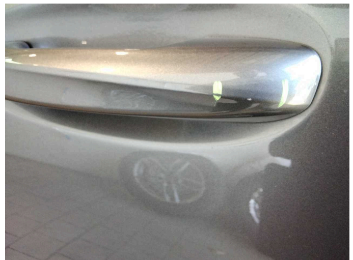
Damage 1: Door - rear left side: Door handle - outside - Scratch(es) - Smart repair