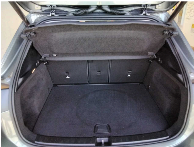
Figure 27: Misc.